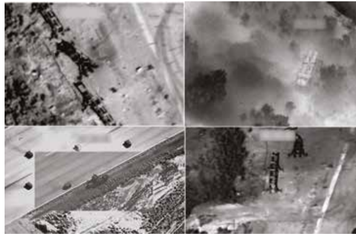
Images from video released by U.S. Central Command (CENTCOM) show precision strikes on Iranian military targets during a large-scale operation targeting air defense systems, missile sites and military infrastructure.

Kuwait's Defence Ministry confirmed its forces intercepted three ballistic missiles, one cruise missile, and ten hostile drones in Kuwaiti airspace at dawn. Defence spokesman Colonel Saud Abdulaziz Al-Atwan said shrapnel caused material damage at multiple locations across the country. One