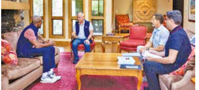
King Abdullah II of Jordan meets business, media and technology leaders during the Sun Valley Conference in Idaho, US. The King highlighted global political and economic challenges while promoting investment opportunities and strategic partnerships for Jordan across key sectors, including technology, artificial intelligence, healthcare and investment.