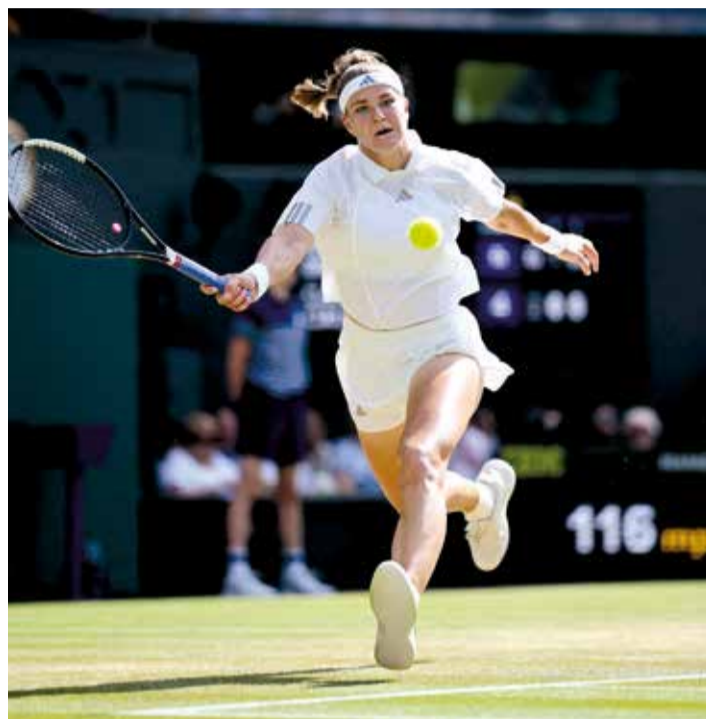
Czech Republic's Karolina Muchova returns to US player Coco Gauff

Gauff had won six of her seven previous meetings with Muchova, but the Czech won their