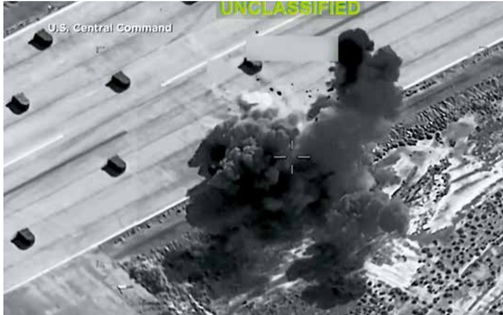
A screen grab shows a fresh round of strikes against Iran

Fighting resumes hours before Khamenei burial