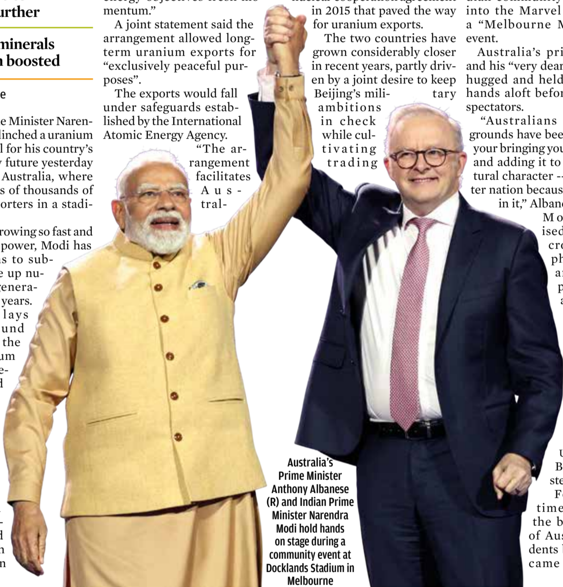
Australia's Prime Minister Anthony Albanese (R) and Indian Prime Minister Narendra Modi hold hands on stage during a community event at Docklands Stadium in Melbourne

Modi is scheduled to fly to New Zealand after Australia.