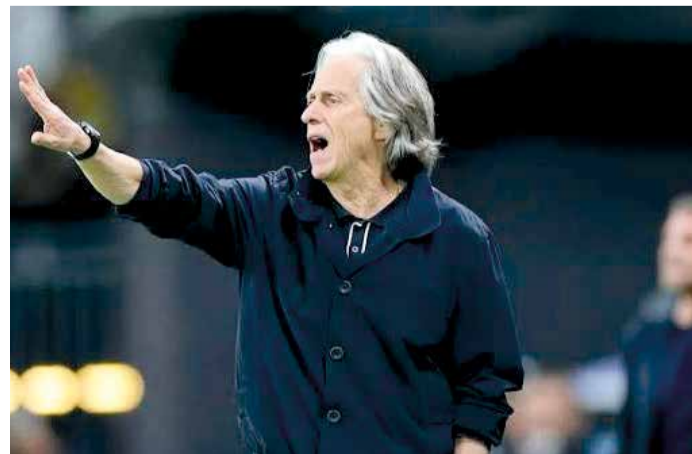
Jorge Jesus reacts during a match (file photo)

Jesus left the Saudi club Al-Nassr last May and is set to sign a four-year contract, run-