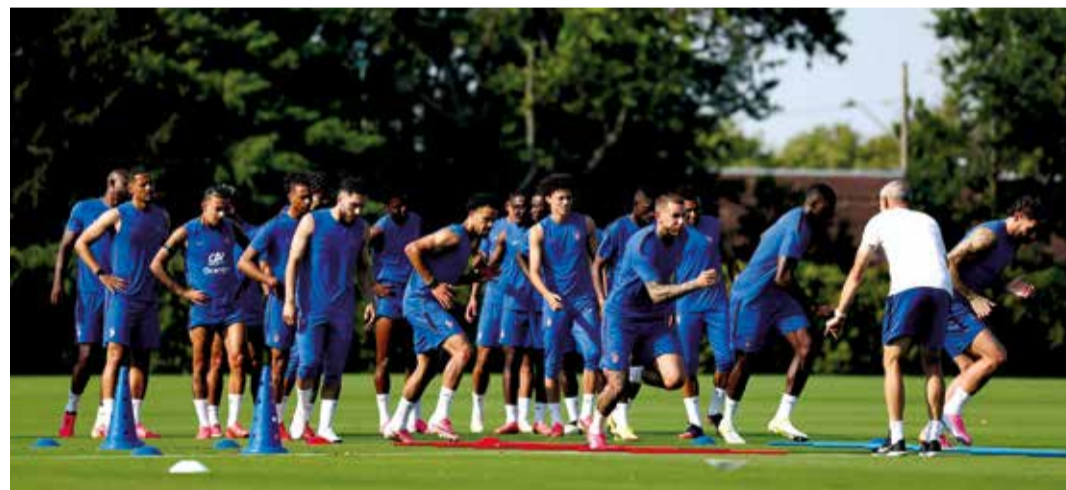
France players attend a training session (file photo)

therefore seen its share of the places shoot up, with Africa having 10 teams this year compared to just five in Qatar in 2022.