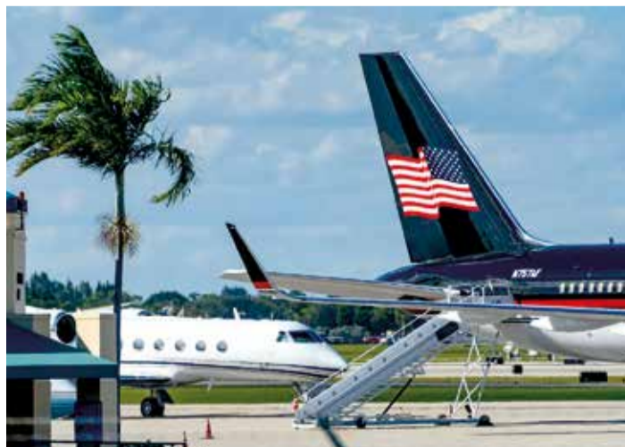
Former President Donald Trump's Boeing 757 private jet is parked at Palm Beach International Airport

A Florida airport was renamed after Donald Trump yesterday, accelerating a push by the US president and supporters to plaster his name and image on everything from national landmarks to banknotes. The Republican leader's son Eric celebrated by landing in the private family Boeing 757 -- so-called "Trump Force One" -- at what had been known as Palm Beach International Airport for nearly half a century. "A beautiful day," a grinning Eric Trump said on Fox News at the newly minted President Donald J. Trump International Airport, a short drive from the family's Mar-a-Lago golf resort and compound.