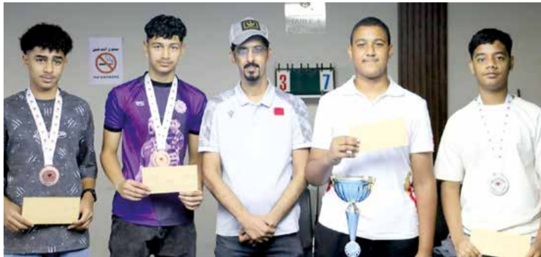
U18 Billiard Champions