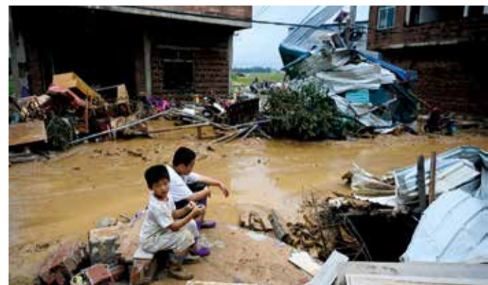
Children sit next to houses which were damaged when the Liulan reservoir collapsed