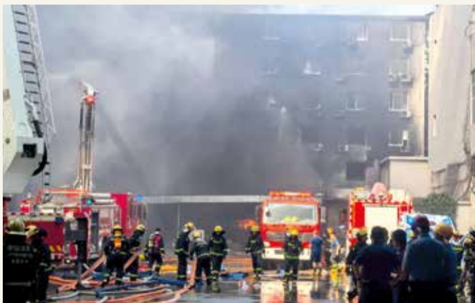
Firefighters at the scene of a footwear factory fire

Footage shared by state television CCTV showed firefighters dousing the facade and interior of a large, multi-story white building with fire hoses, as thick black smoke poured out. People can be seen taking refuge near the windows and on the roof of the building, while the