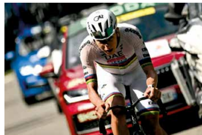
Tadej Pogacar in action