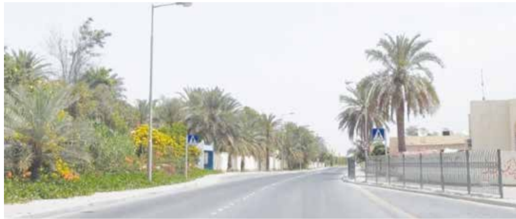
Al Mazare' Road

Ministry of Works will assess the widening project aimed at improving traffic flow