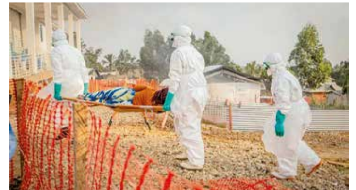
Healthcare workers carry on a stretcher a patient suffering from Ebola at a treatment centre in Bunia