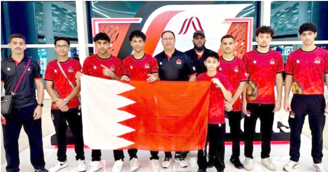
Bahrain's boxers and coaches at the airport