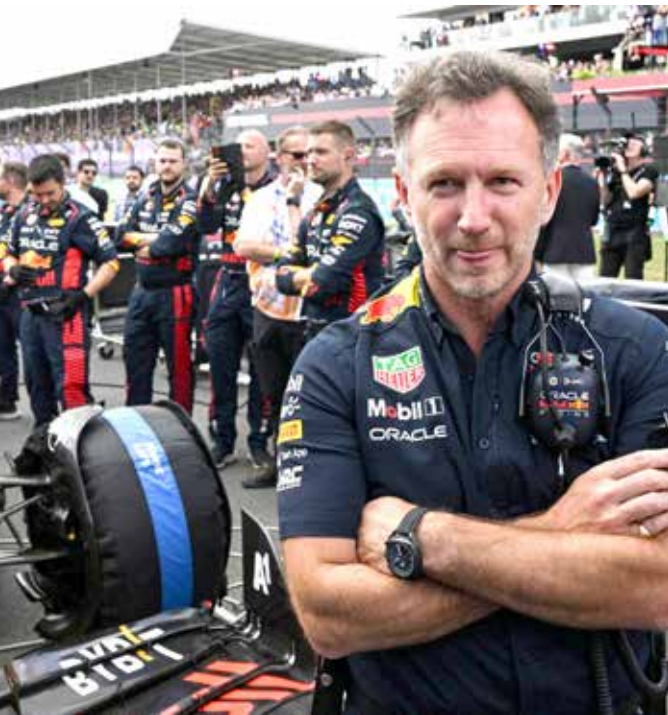
Christian Horner reacts prior to a race