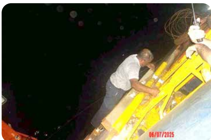
Members of the Greek owned, Liberian-flagged Magic Seas commercial vessel climbing on board the Safeen Prism, after being rescued following an attack that forced them to abandon ship, in the Red Sea