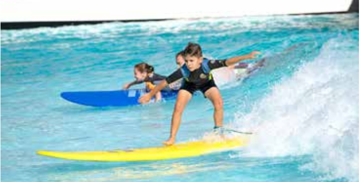
Whether young or old, the wave promises pure joy

The surf park is expected to open in 2026.