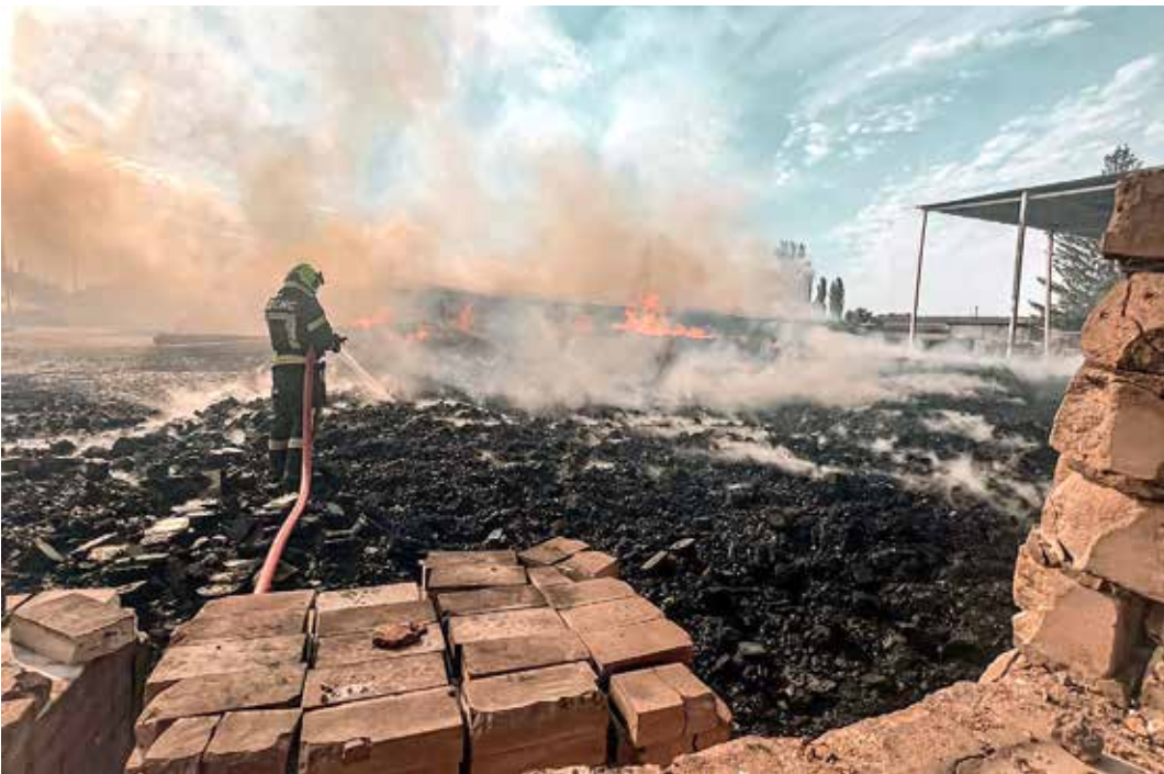
A firefighter extinguishes a fire after a Russian attack in Kyiv region.

“This is a telling attack - and it comes precisely at a time when so many efforts have been made to achieve peace, to establish a ceasefire, and yet only Russia continues to rebuff them all,” President Volodymyr Zelensky wrote on social media.