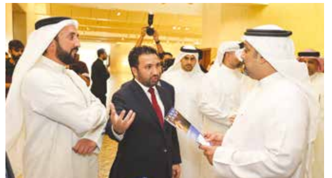
Finance Minister Shaikh Salman engages with the team behind Procural, a Bahraini startup transforming procurement through a cloud-based digital platform.