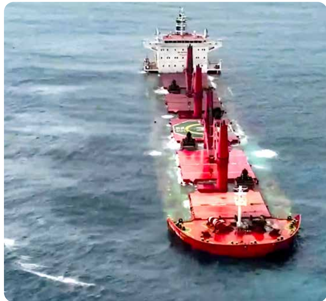
The Liberia-flagged bulk carrier Magic Seas sinking, after it was attacked by Huthi-affiliated fighters at sea

"Yemen must not be drawn deeper into regional crises that threaten to unravel the already