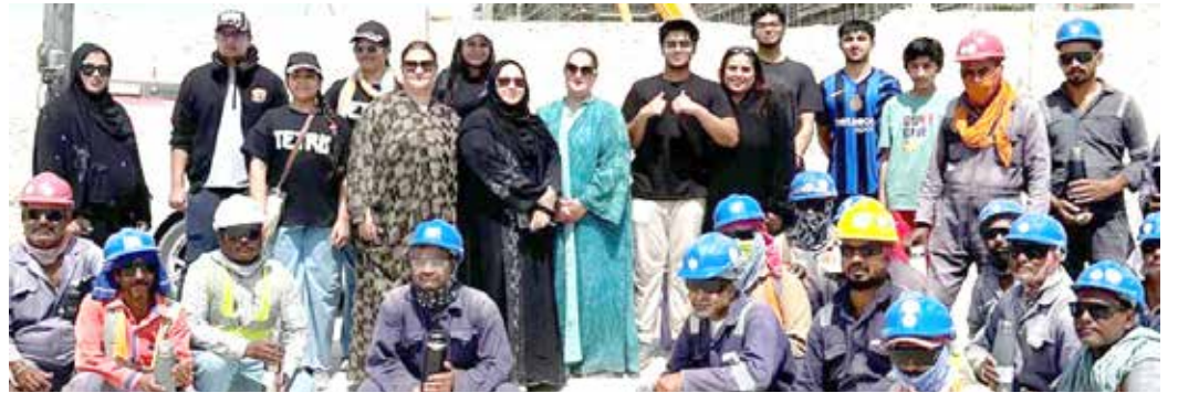
PWA officials and volunteers with construction workers