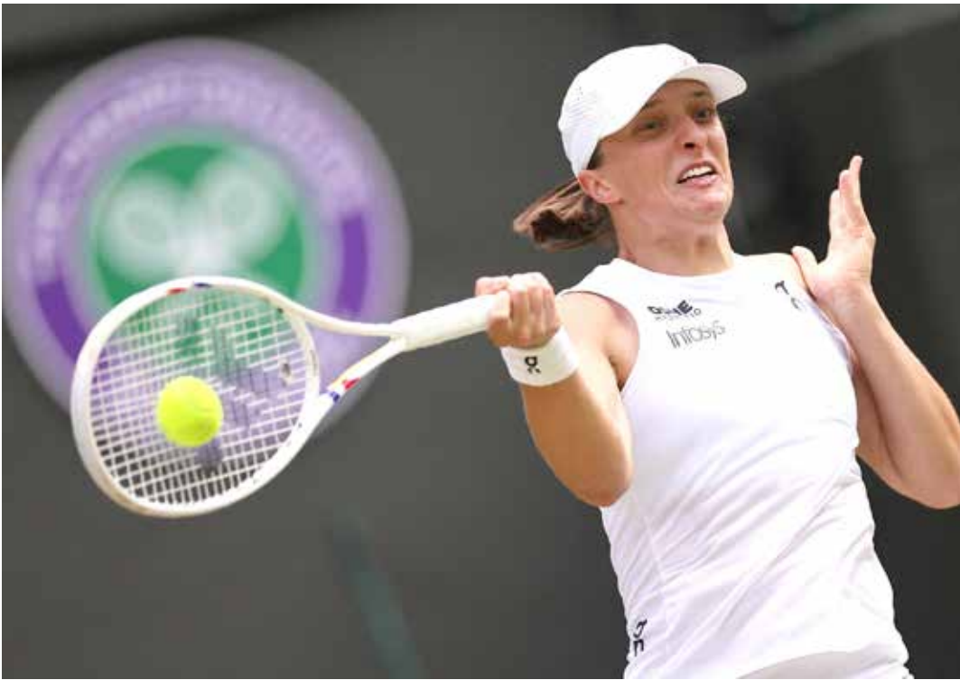
Poland’s Iga Swiatek plays a forehand return to Russia’s Liudmila Samsonova

Iga Swiatek said she had “goosebumps” after reaching the Wimbledon semi-finals for the first time in her illustrious career with a 6-2, 7-5 win against Russia’s Liudmila Samsonova yesterday. The Polish eighth seed will face former Olympic champion Belinda Bencic for a place in Saturday’s final. Swiatek has won four titles on the clay at the French Open, as well as the US Open in 2022, but has struggled on the lawns of the All England Club. Her previous best result at Wimbledon was a run to the quarter-finals in 2023. Swiatek dominated the first set against 19th seed Samsonova on Court One but was made to battle in the second set before wrapping up victory in one hour