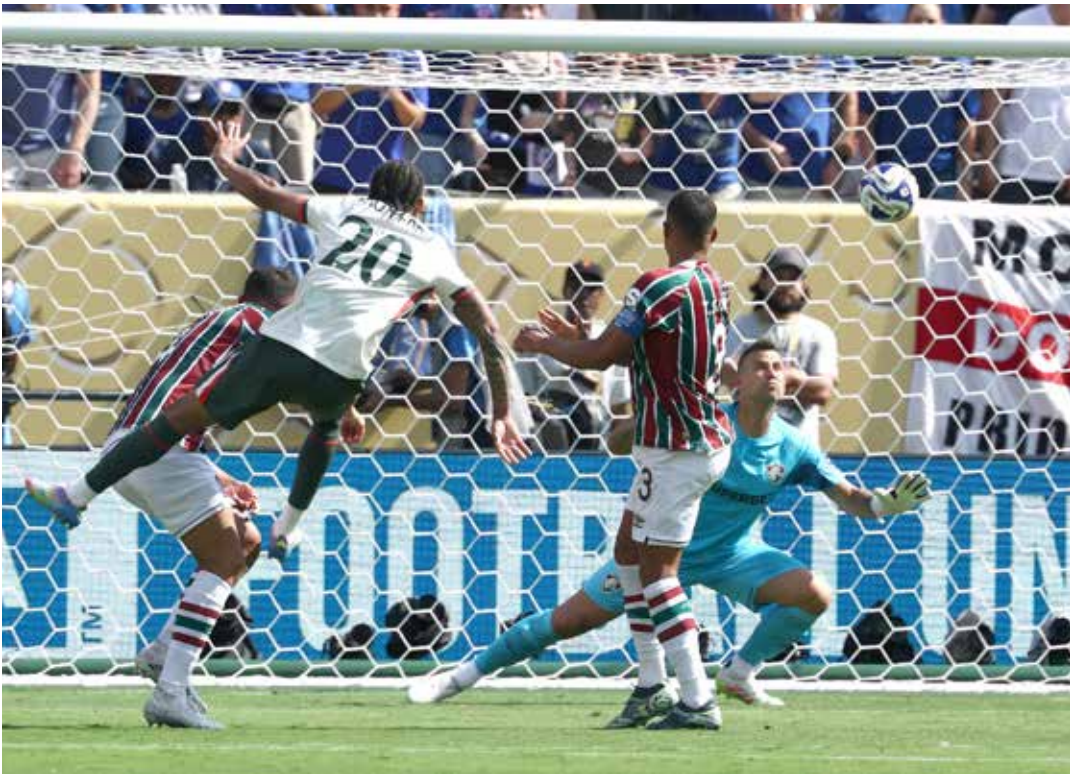
Chelsea’s Brazilian forward #20 Joao Pedro scores his team’s second goal

New signing Joao Pedro scored twice on his first start as Chelsea eased to a 2-0 win over Fluminense on Tuesday to seal a spot in the final of the Club World Cup. The Brazilian striker opened the scoring in lethal fashion in the 18th minute of the last-four clash at the MetLife Stadium and struck again shortly before the hour mark as Chelsea set up a showdown with either Real Madrid or Paris Saint-Germain in Sunday’s final. Signed from Brighton and Hove Albion last week for a reported £60 million ($79 million), the 23-year-old cut short a holiday and made his debut off the bench in the quarter-final win over Palmeiras. He was then given his first Chelsea start up front here in place of the suspended Liam Delap. Joao Pedro refused to celebrate after either goal against the club with whom he started his career and made 36 top-team appearances before moving to England with Watford in 2020. The result ends Fluminense’s impressive run at the tournament after the 2023 Copa Libertadores winners held Borussia Dortmund in the group stage, beat Inter Milan in the last 16 and knocked out Manchester City’s conquerors Al-Hilal in the quarter-finals. With their exit go the prospects of a South American winner of the first 32-team Club World Cup, with Chelsea claiming back-to-back victories