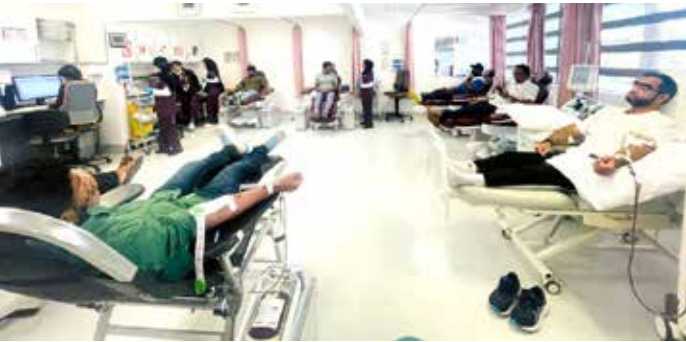
Expatriates take part in a noble cause