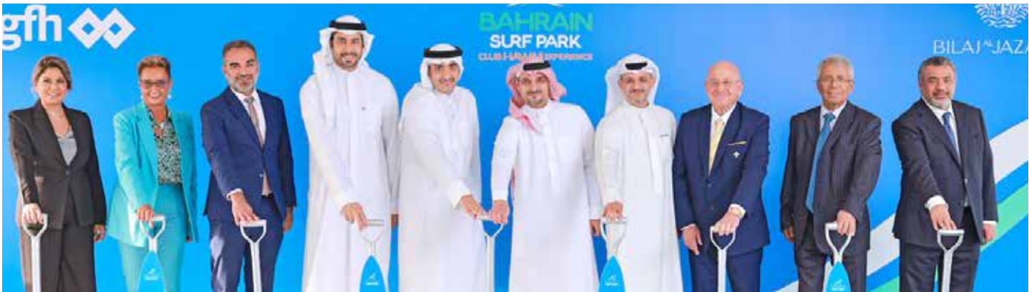
Edamah and GFH Financial Group key officials attend the groundbreaking ceremony

vision is to introduce surfing as an accessible sport and lifestyle to Bahrain's youth, families, and tourists alike.