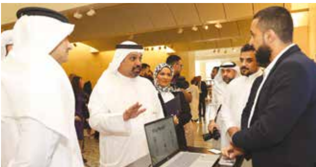
Parcel team members with the minister on their smart delivery solutions, supporting homes and small businesses across Bahrain.