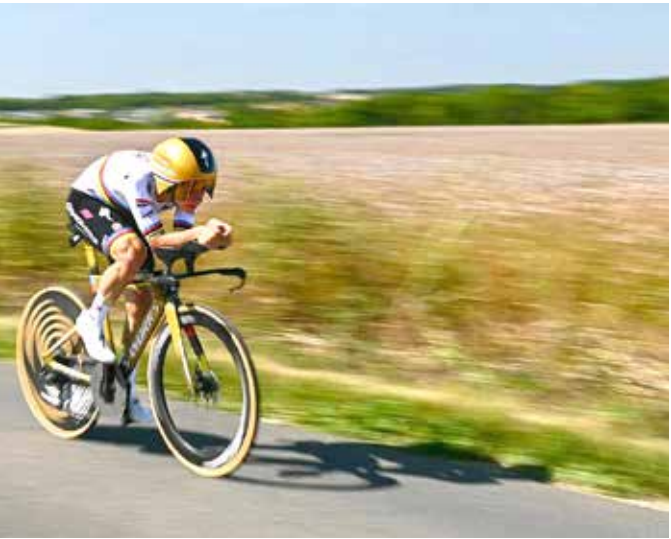
Soudal Quick-Step team’s Belgian rider Remco Evenepoel cycles during the 5th stage