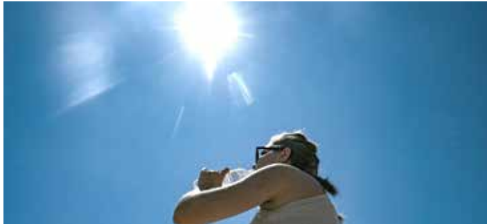
A tourist drinks water during a heatwave in Thessaloniki.

The EU’s climate monitor Copernicus yesterday said it was the hottest June on record in