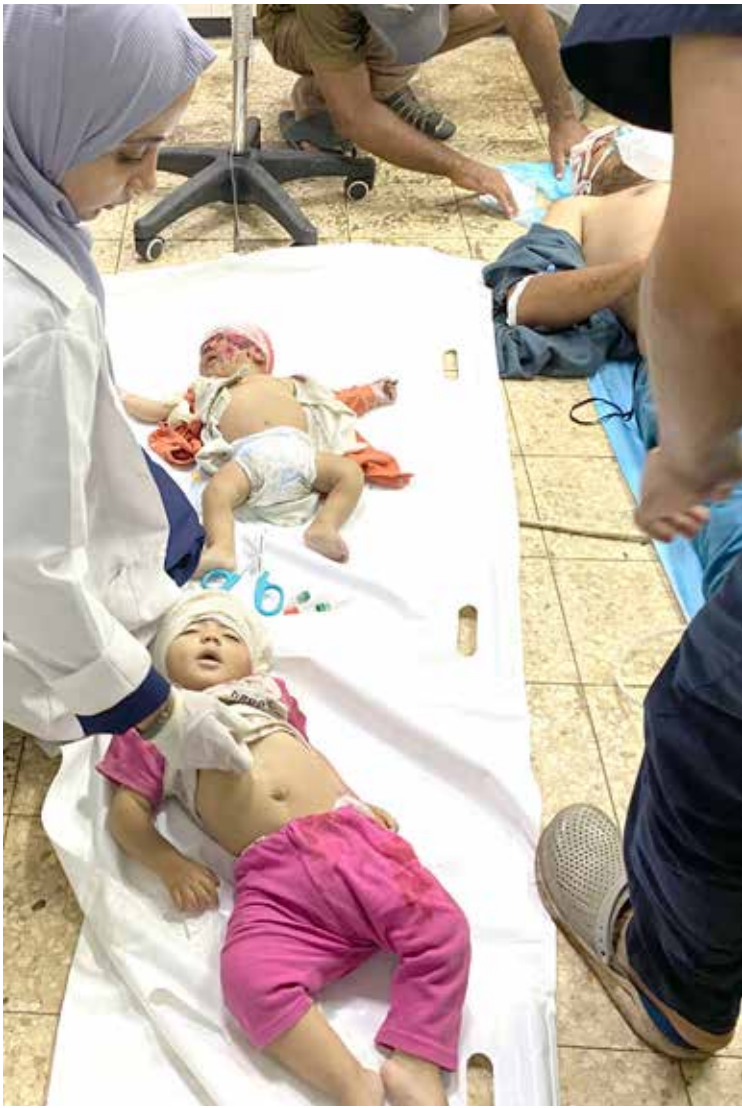
Palestinian medics attend to children wounded in an Israeli strike on a camp for displaced people near Khan Yunis, at the Nasser Hospital in the southern Gaza Strip city

But Hamas, whose bloody October 7, 2023 attack on Israel sparked the war in Gaza, said it