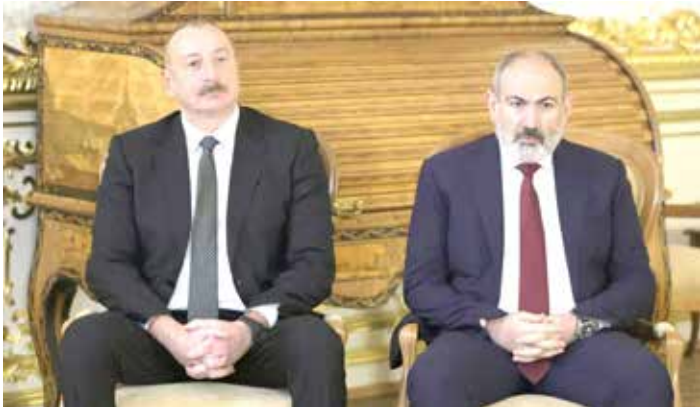
Azerbaijani President Ilham Aliyev and Prime Minister Nikol Pashinyan

The leaders of Armenia and Azerbaijan will meet today in the United Arab Emirates