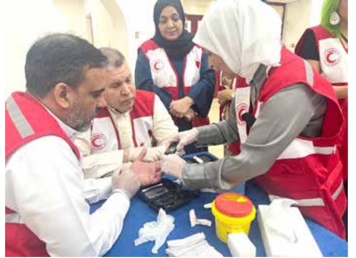
BRCS committee members teach participants key diagnostic techniques