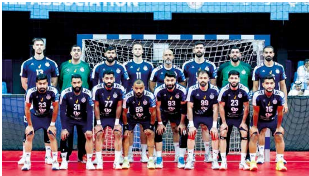
Bahrain's Al Najma handball squad