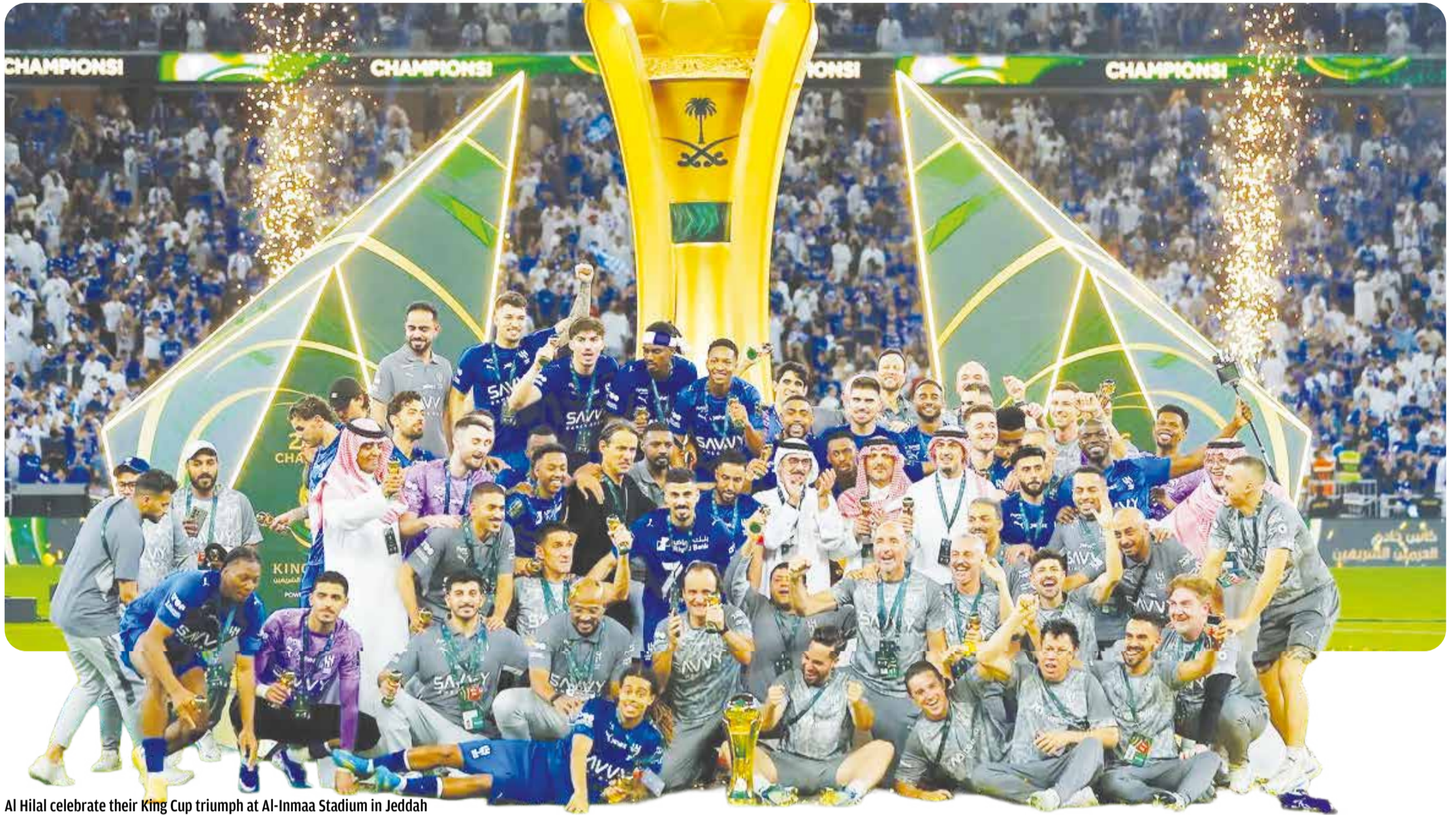
Al Hilal celebrate their King Cup triumph at Al-Inmaa Stadium in Jeddah