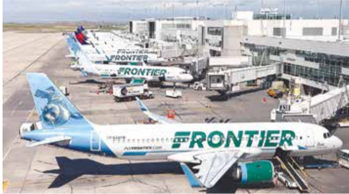
Frontier Airlines planes are parked at gates in Denver International Airport (DEN) in Denver, Colorado

The plane was quickly evacuated and 12 passengers on the flight reported minor injuries;