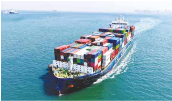
This aerial photo shows a cargo ship sailing into the port in Qingdao, in China's eastern Shandong province

The growth outpaced a Bloomberg forecast of 8.4% based on a survey of economists, and also picked up significantly from the 2.5% increase in March.