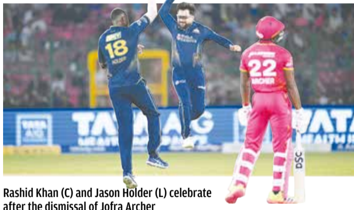
Rashid Khan (C) and Jason Holder (L) celebrate after the dismissal of Jofra Archer

Rashid Khan starred with 4-33 as Gujarat Titans crushed Rajasthan Royals by 77 runs in the IPL on Saturday. Kagiso Rabada claimed two wickets, while Jason Holder took three late wickets as Rajasthan were bowled out for 152 in reply to Gujarat's imposing 229-4. Skipper Shubman Gill led the charge with 84 off 50 balls, while Sai Sudharsan struck 55 in a 118-run opening stand.