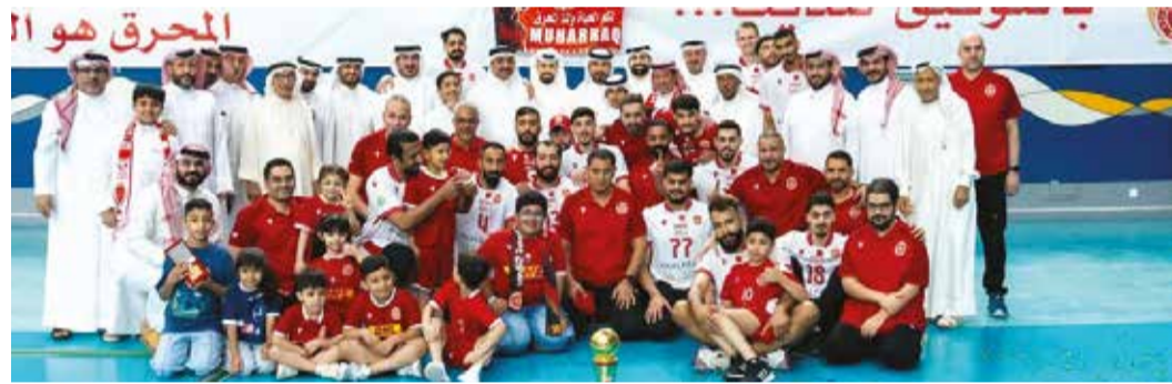
Muharraq players and officials celebrate the title with supporters