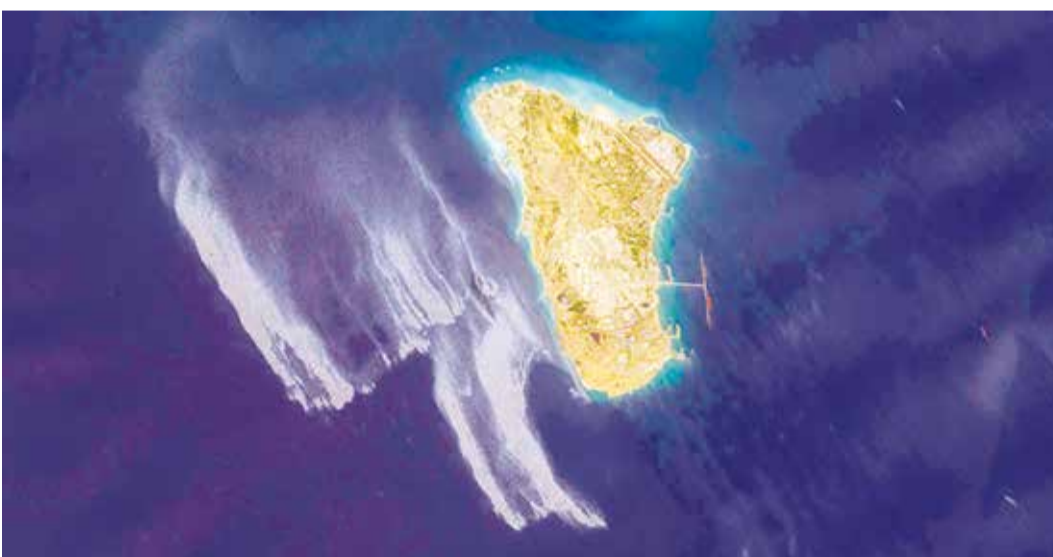
This satellite image obtained from Copernicus Sentinel Data appears to show an oil slick spreading off the coast of Kharg Island, a key oil export terminal for Iran.