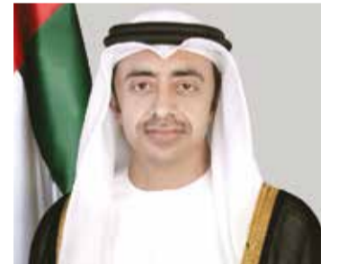
Abdullah bin Zayed Al Nahyan, Emirati Foreign Minister

Saud Al Sabah, who expressed support for Bahrain's measures to preserve security and stability. The Kuwaiti minister praised