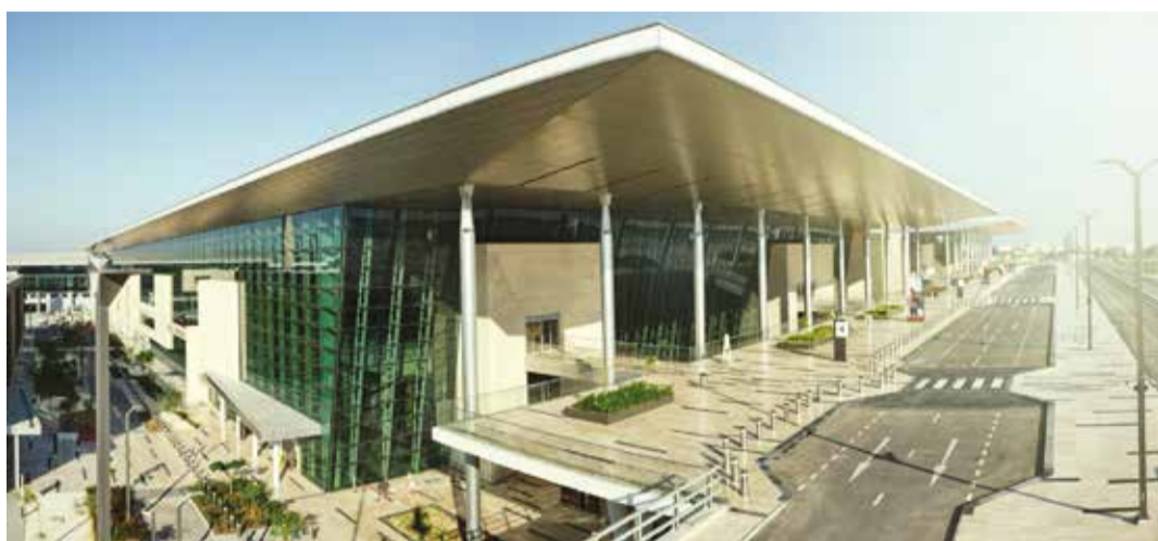
Bahrain International Airport

BAS said the expansion aligns with its broader strategy to strengthen its presence in key Gulf markets, including Saudi Arabia and Oman, while diversifying its aviation services portfolio. "The announcement of BAS Saudi represents a pivotal step in our journey towards regional