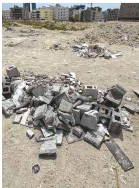
Garbage at the beach poses serious and growing environmental issue