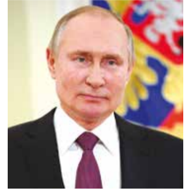
President Vladimir Putin