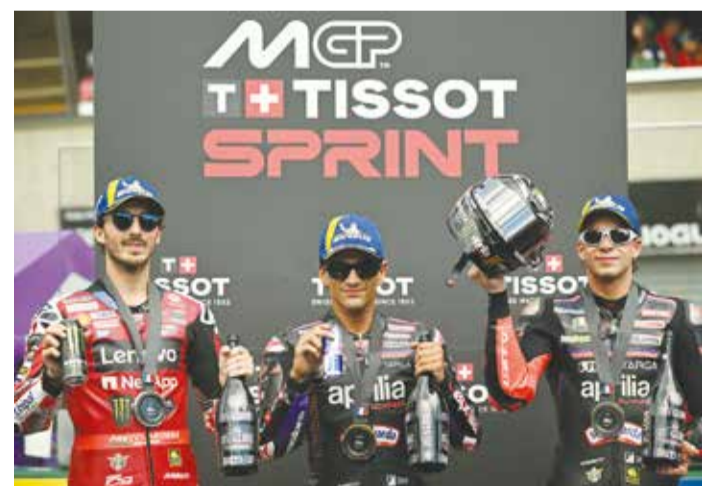
Aprilia Racing's Spanish rider Jorge Martin (C) celebrates poses on the podium with second placed Ducati Lenovo Team's Italian rider Francesco Bagnaia (L) and third placed Aprilia Racing's Italian rider Marco Bezzecchi (R) after winning the Moto GP Grand Prix of France Sprint race at Le Mans, northwestern France

He put his left foot on the ground to try to regain his balance but was flipped over the handlebars in the opposite