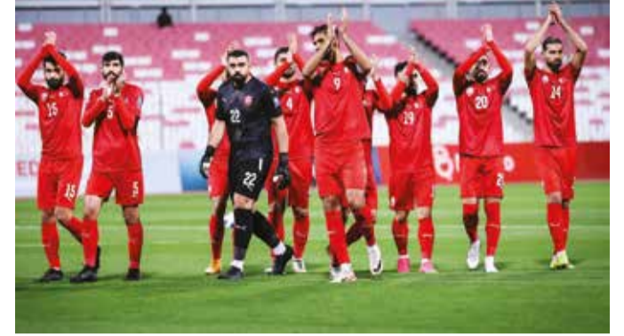
Core members of Bahrain's national football team for the tournament.png