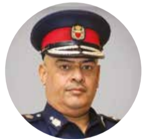
Lt-General Tariq Al Hassan

He explained that the integration and coordination between the local press and the Ministry of Interior's police media represent a distinguished model of national work and the integration of roles among its institutions.