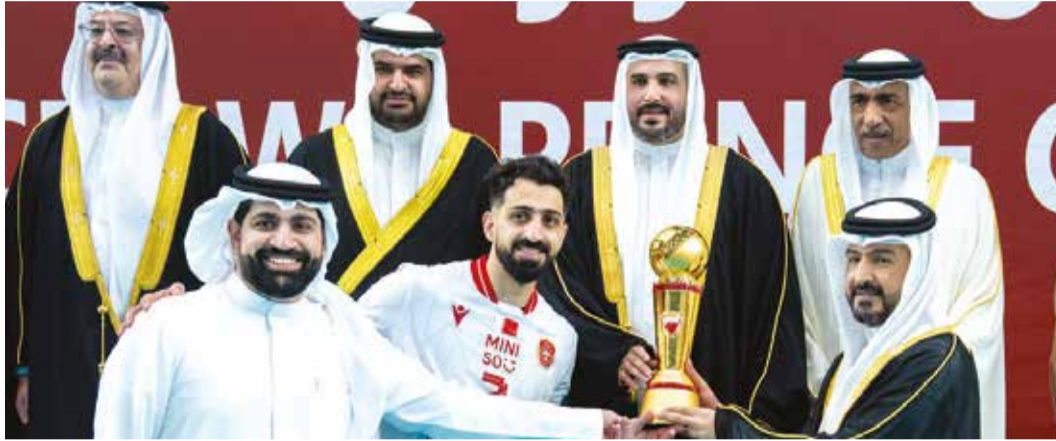
Trophy presentation following Muharraq's victory over Dar Kulaib in the final