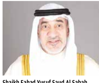
Shaikh Fahad Yusuf Saud Al Sabah, Kuwait's First Deputy Prime Minister and Interior Minister

Interior Minister General Shaikh Rashid bin Abdullah Al