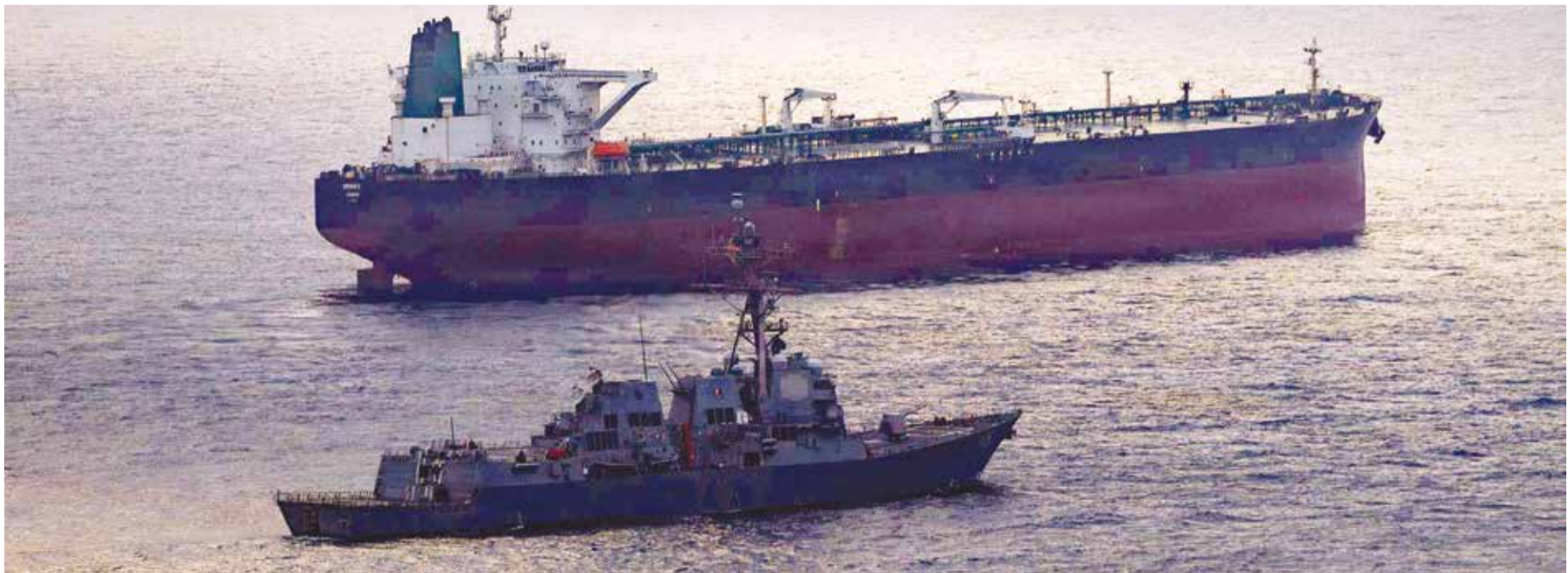
Arleigh Burke-class guided-missile destroyer USS Rafael Peralta (DDG 115) implementing a maritime blockade against the Iran-flagged crude oil tanker vessel Herby while the latter was attempting to sail toward an Iranian port

It came after a flare-up overnight Thursday to Friday in the strait, where Iran is seeking to extract tolls from foreign vessels and wield economic leverage over the US and its allies.