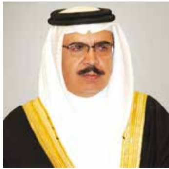
General Shaikh Rashid bin Abdullah Al Khalifa, Minister of Interior

The support came from fellow Gulf Cooperation Council (GCC) members including Kuwait, Saudi Arabia and United Arab Emirates, Morocco and Jordan, following Bahrain's announcement of arrests tied to alleged espionage and security-related offences.