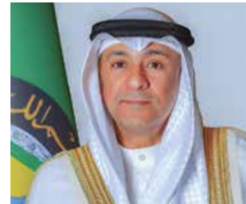
Jasem Mohamed AlBudaiwi, GCC Secretary-General

Khalifa received a phone call from Kuwait's First Deputy Prime Minister and Interior Minister Shaikh Fahad Yusuf