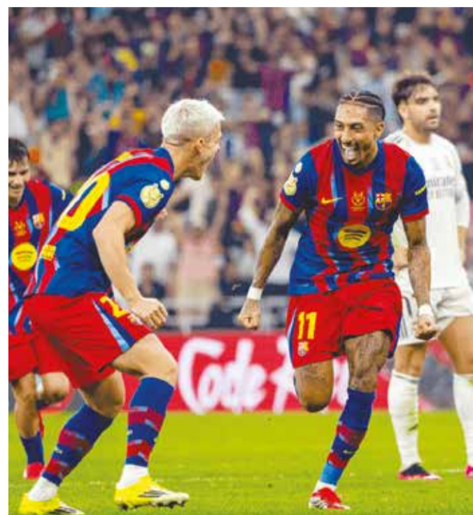
Raphina celebrates for his goal in the reverse fixture

Madrid arrive in disarray, looking to spoil the Catalan party