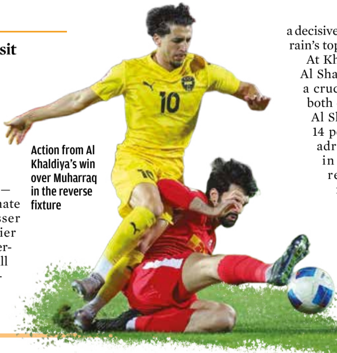
Action from Al Khaldiya's win over Muharraq in the reverse fixture

Matchweek 21 — the penultimate round of the Nasser bin Hamad Premier League — gets underway tonight, with all three fixtures kicking off simultaneously at 7pm as the season enters