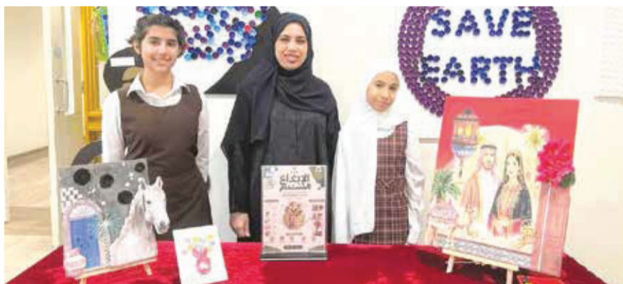
Students show their eco-friendly projects

School initiative links creativity with environmental awareness