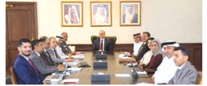
H.E. Yousif bin Abdulhussain Khalaf with Council officials

Preparations underway for annual safety conference and exhibition