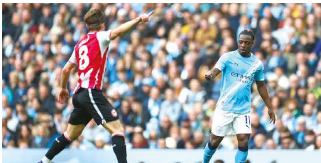
Jeremy Doku in possession against Brentford

Brentford responded with a brief spell of pressure and felt they had a case for a penalty that was turned away, but City gradually took control. The pressure eventually told when Erling Haaland bundled home City's second goal in the 75th minute,