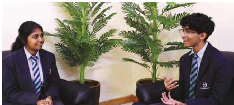
Empowering the youth through podcast