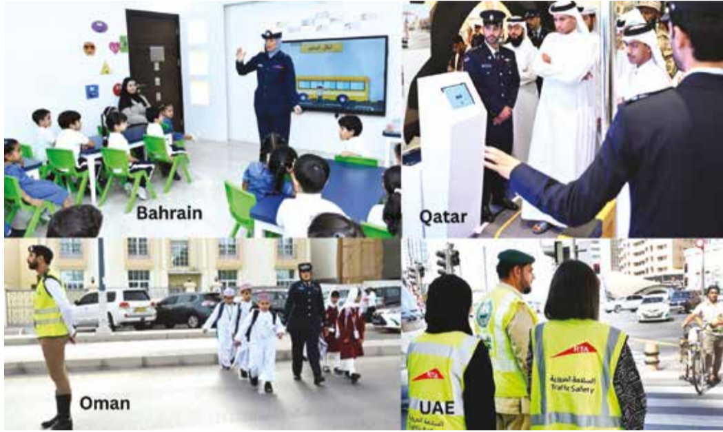
Traffic police officers across GCC countries intensify road safety awareness and enforcement during GCC Traffic Week 2026