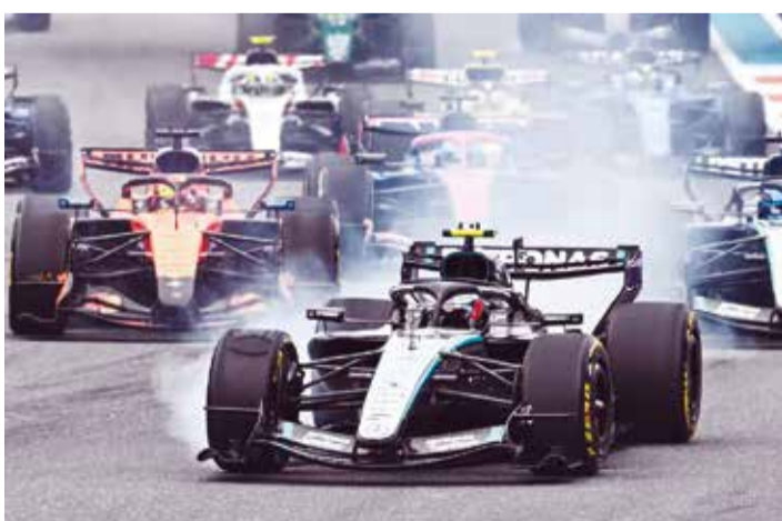
Mercedes' Italian driver Kimi Antonelli races during the 2026 Miami Formula One Grand Prix at Miami International Autodrome in Miami Gardens, Florida

ciple today for 2027 would see a nominal increase in internal combustion engine power by 50 kilowatts with a fuel-flow increase and a nominal reduction of the energy recovery system deployment power by 50 kilowatts," the FIA said in a statement.