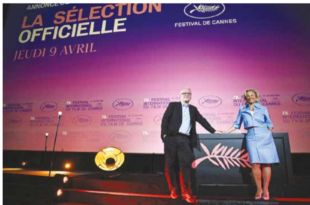
Cannes film festival General Delegate Thierry Fremaux (L) and Festival President Iris Knobloch pose after a press conference to announce the official selection of the 79th edition of the Cannes Film Festival, at the Pathe Palace cinema in Paris

After the worldwide success of "Drive My Car", the Japanese filmmaker returns with a film shot in France, with Virginie Efira as the director of a nursing home who befriends a Japanese