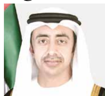
Sheikh Abdullah bin Zayed Al Nahyan