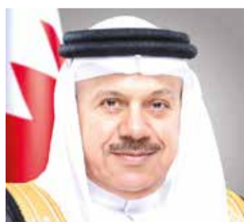
Dr. Abdullahatif bin Rashid Al Zayani