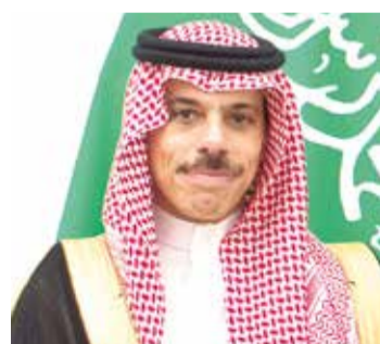
Prince Faisal bin Farhan Al Saud