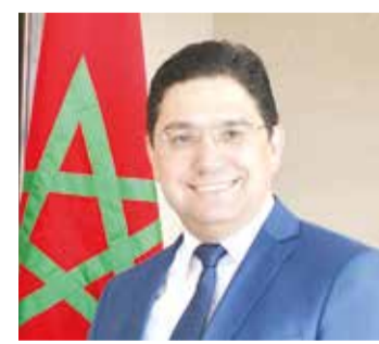
Nasser Bourita, Minister of Foreign Affairs of Morocco