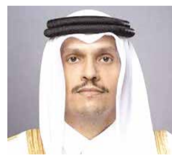
Sheikh Mohammed bin Abdulrahman Al Thani