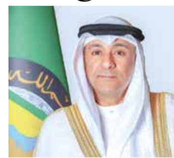
Jasem Mohamed Albudaiwi, Secretary-General of the Gulf Cooperation Council passage under the United Nations Convention on the Law of the Sea.