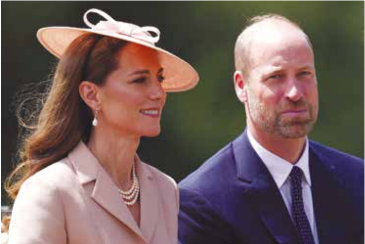
Britain’s Catherine (L), Princess of Wales and Britain’s Prince William, Prince of Wales travel in the Ascot Landau carriage

over Andrew’s close links to Epstein, with King Charles III’s brother under pressure to further explain them.