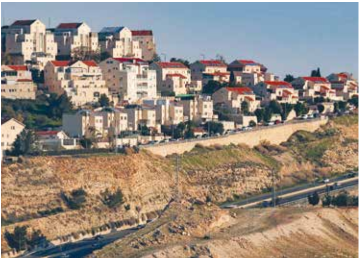
This picture taken from the “E1 corridor” northeast of Jerusalem in the occupied West Bank shows vehicles moving along a highway near the Israeli settlement of Maale Adumim (top)

The foreign ministers of Saudi Arabia, Jordan, the UAE, Qatar, Indonesia, Pakistan, Egypt and Turkey “condemned in the strongest terms the illegal Israeli