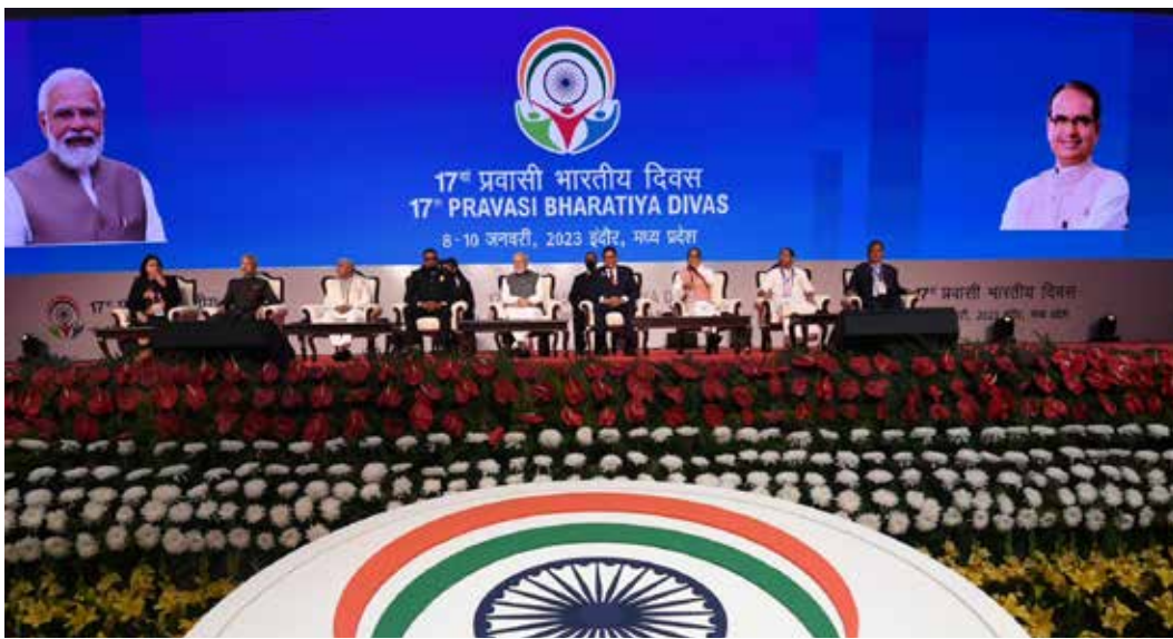
Modi opens 17th Pravasi Bharatiya Divas Convention 2023 in Indore, Madhya Pradesh, India

He also urged Indian universities to document the contri-