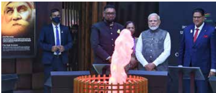
Indian PM inaugurates the 1st ever digital PBD Exhibition

Modi yesterday also opened the first ever digital PBD Exhibition on the theme AzadiKaAmritMahotsav - Contribution of Diaspora in Indian Freedom Struggle.