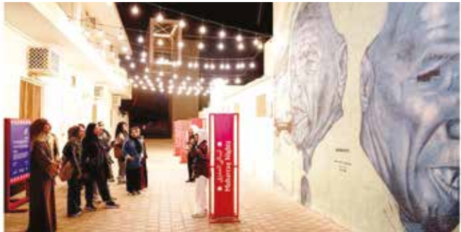
Participants get to observe and document Muharraq’s architectural and cultural characteristics