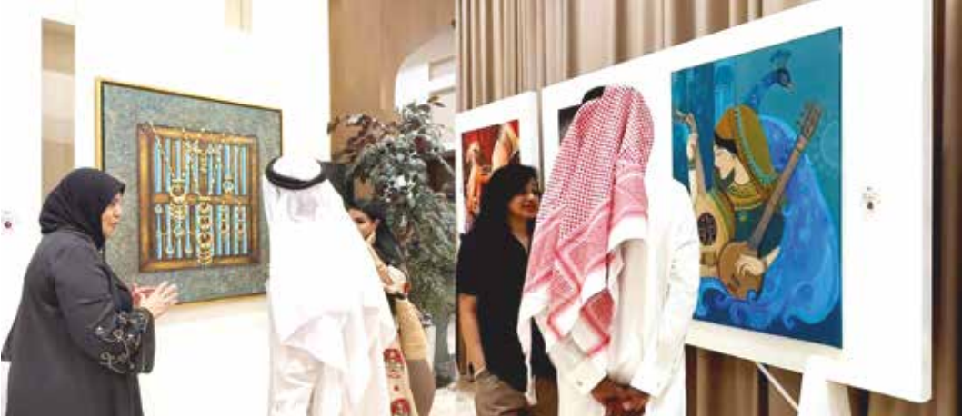
The event features brilliant works by prominent Bahraini and Indian artists