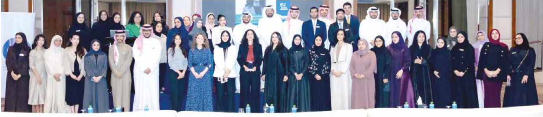
UNDP officials with participants

As part of efforts to enhance youth awareness of contemporary development issues, the United Nations Development Programme (UNDP) delivered an awareness lecture within the Young Parliamentarian Program 2025, focusing on the Sustainable Development Goals (SDGs) and global trends related to their implementation. The organization of this lecture underscores the importance of building youth capacities and enabling them to gain a deeper understanding of issues that influence public policy formulation. The lecture, presented by Her