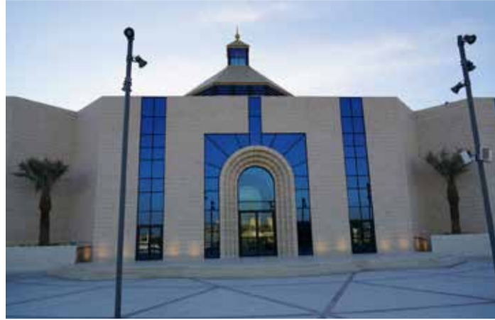
The new cathedral ... a symbol of Bahrain's commitment to fostering peace, unity and coexistence