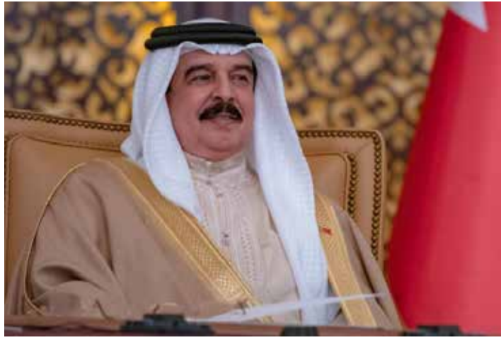
HM the King

Unfortunately, due to existing coronavirus (COVID-19) restric-