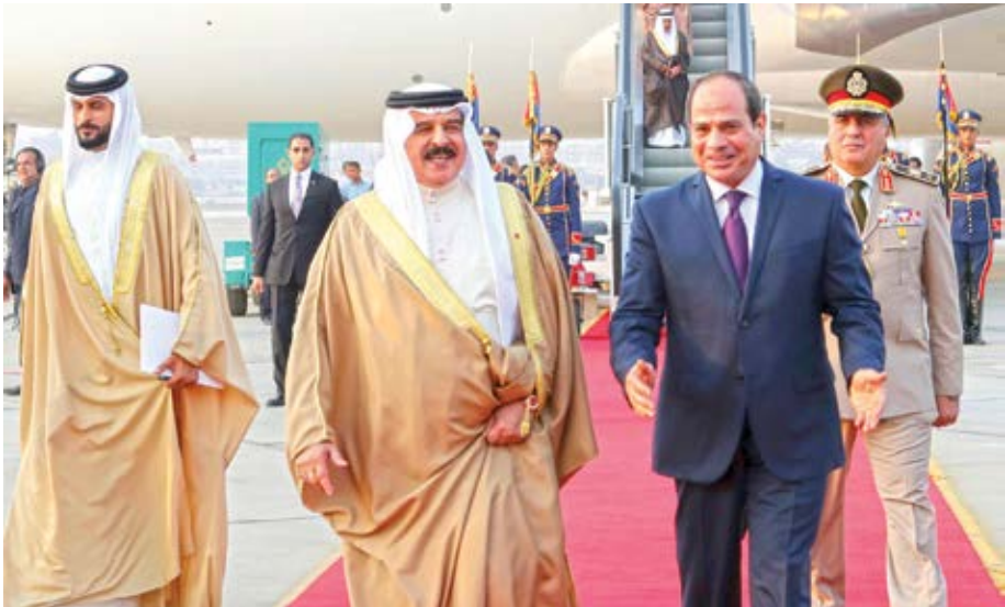
His Majesty being received by El Sisi in Cairo.