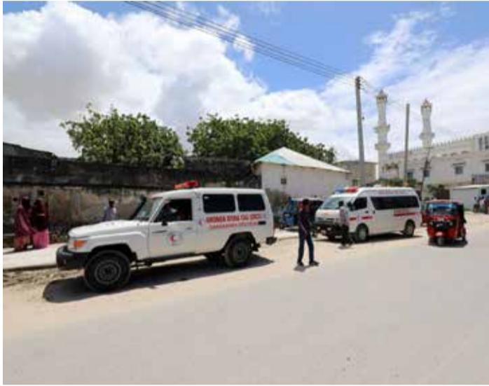
An ambulance is seen near a blast site that rocked a military base in Mogadishu

"A suicide bomber driving an explosive-laden vehicle sped toward the front gate of the camp but the guards opened fire to stop it before it detonated," Aden Mohamed, a police officer among the first responders, told VOA's Somali Service.