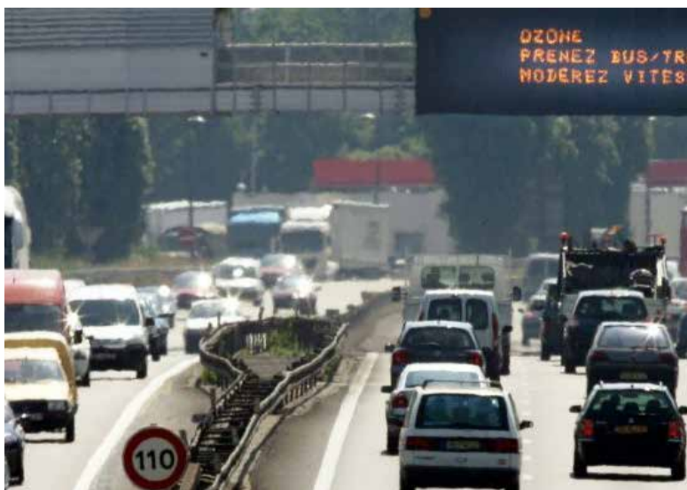
People drive their vehicle on the highway as they are stuck in a traffic jam

Authorities reminded sweltering citizens that masks must continue to be worn where they have been