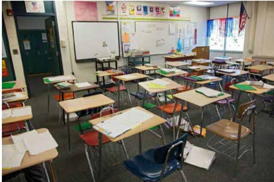
Representative picture