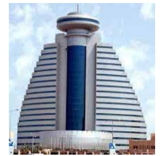
TDT | Manama

Bahrain Chamber announced holding a webinar on "The criteria and controls for determining the final beneficiary of a C.R."