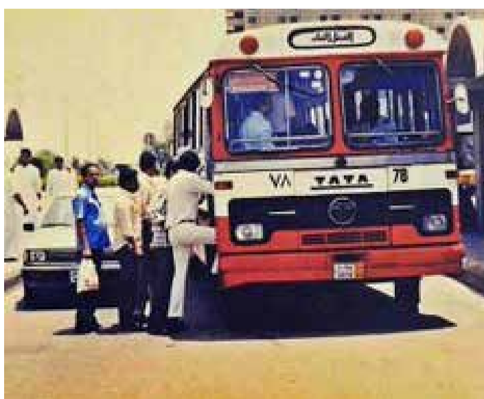
Bahrain in the '80s and '90s.