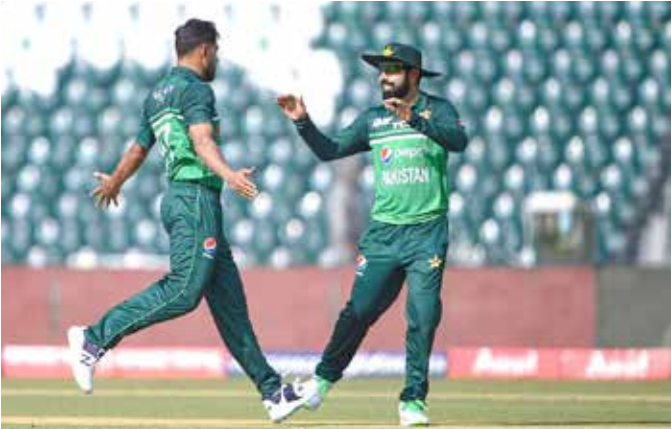
Pakistan's Haris Rauf (L) celebrates with teammate Shadab Khan (file photo)