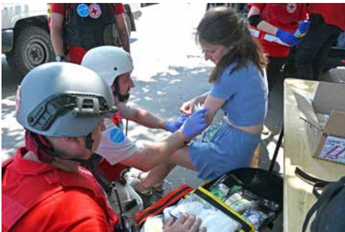
Medics provide assistance to a wounded woman following a drone attack in Kharkiv

President Donald Trump has said the United States will send additional weapons to Ukraine, triggering Russian criticism after Moscow claimed new gains in its grinding war against its neighbor.