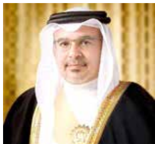
HRH Prince Salman TDT | Manama

His Royal Highness Prince Salman bin Hamad Al Khalifa, the Crown Prince and Prime Minister, issued Edict (38) of 2025 regarding the appointment of a Director at the Ministry of Finance and National Economy, based on a proposal by the Minister of Finance and National Economy.