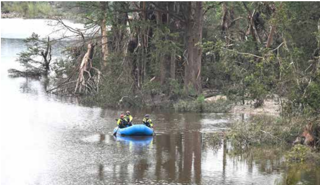
Members of a rescue team look for missing people on the Guadalupe River in Kerrville, Texas

The death toll from catastrophic flooding in Texas rose to more than 100 on Monday, as rescuers continued their grim search for people swept away by torrents of water.