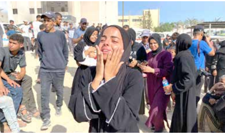
A Palestinian woman weeps as she bids farewell to a loved one during the funeral of Palestinians killed in Israeli strikes on the southern Gaza Strip the previous day, outside the Nasser Hospital in Khan Yunis

The International Committee of the Red Cross (ICRC) said yesterday that a “sharp surge” in deaths and injuries in incidents around aid distribution sites in Gaza is pushing the territory’s already stretched health system past its capacity. The ICRC said in a statement that its field hospital in south Gaza recorded 200 deaths since the new aid distribution sites were launched in late May. The facility also treated more than 2,200 “weapon-wounded pa-