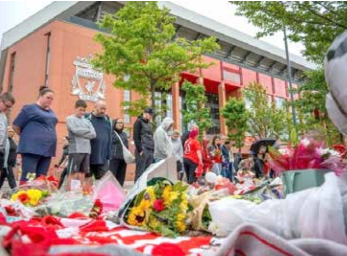
Well-wishers leave flowers, scarves and shirts at a memorial set up close to Anfield football ground for their Portuguese forward Diogo Jota in Liverpool