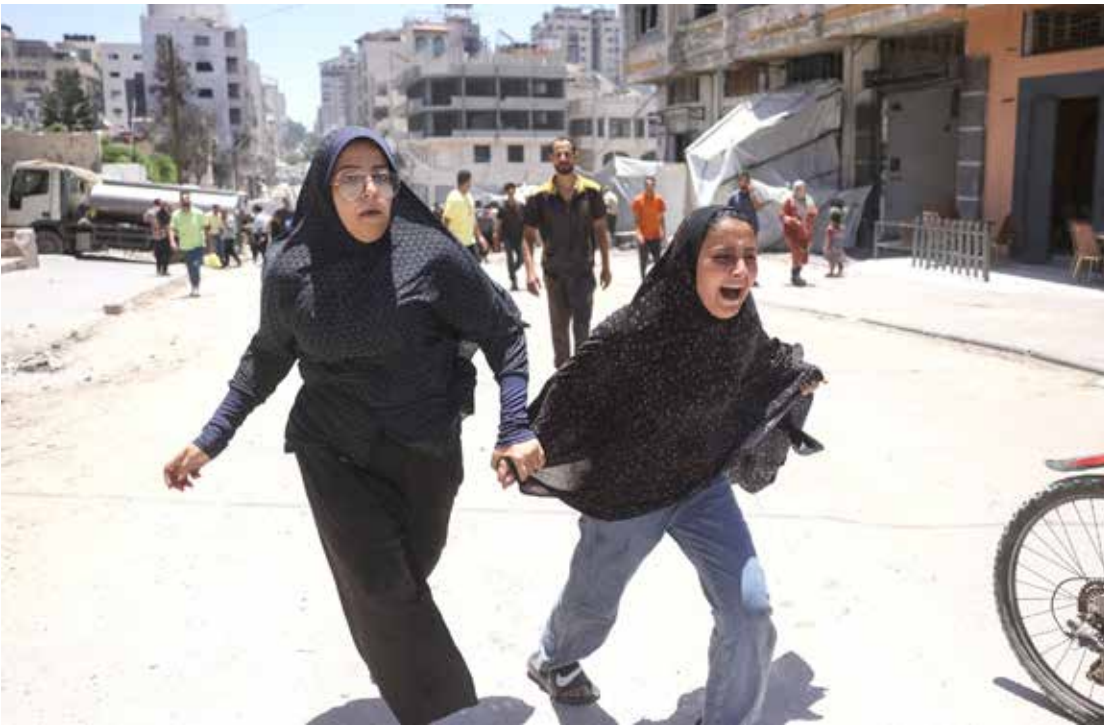
Two girls react after an Israeli strike hit a tent housing displaced Palestinians, in Gaza City