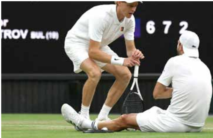
Grigor Dimitrov (R) speaks with Jannik Sinner (L) after getting injured (file photo)

Sinner trailed the Bulgarian by two sets when Dimitrov was dramatically forced to retire after injuring a pectoral muscle.