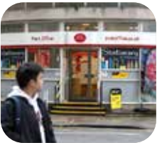
UK post office scandal may have caused 13 suicides: inquiry