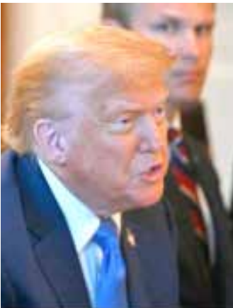
AFP | Washington, United States