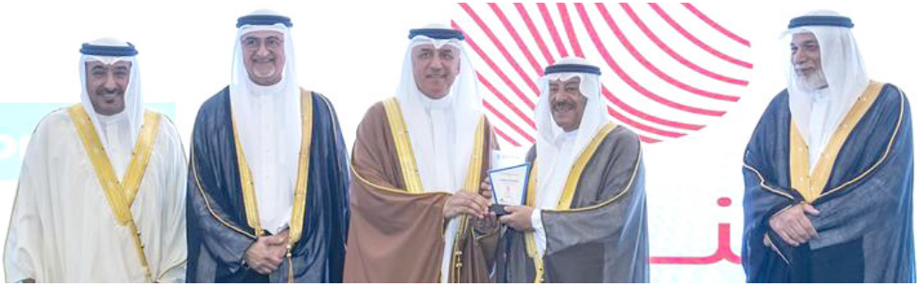
H.E. Ali bin Saleh Al Saleh at a previous ceremony of the event

Bahrain's digital future is getting a strong push from its young innovators, with the upcoming Bahrain Digital Content Awards putting the spotlight on local creativity, innovation, and content excellence. Set to take place on Sunday, the event is being held under the patronage of His Excellency Ali bin Saleh Al Saleh, Chairman of the Shura Council. Organised by WorkSmart in strategic partnership with the World Summit Awards (WSA), the ceremony reflects Bahrain's growing ambitions in the digital economy. This year's edition introduces a dedicated youth category aimed at nurturing fresh talent and recognising emerging creators across digital platforms.