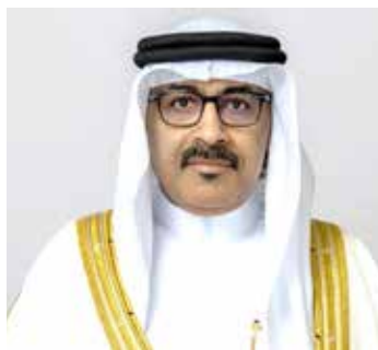
H.E. Dr. Mohammed bin Mubarak Juma

H.E. Dr. Juma underscored that the scholarship expansion reflects the continued support of His Majesty King Hamad bin Isa Al Khalifa and the directives of His Royal Highness Prince Salman bin Hamad Al Khalifa, the Crown Prince and Prime Minister.