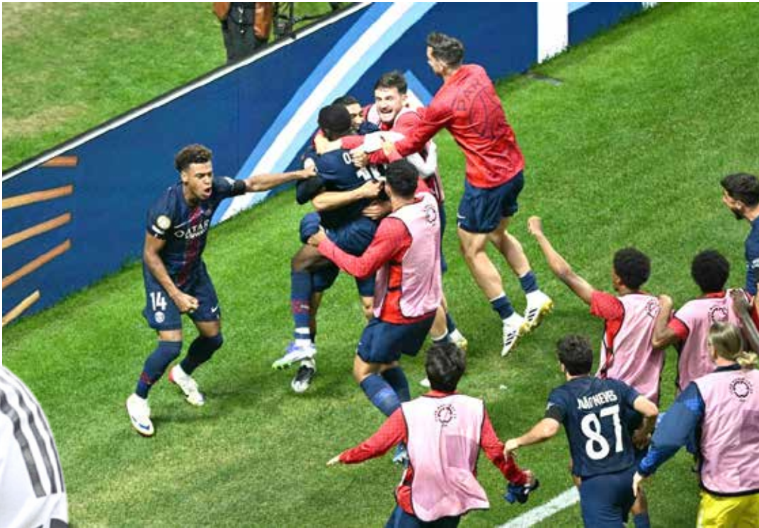
Paris Saint-Germain's French forward #10 Ousmane Dembele (C) celebrates with teammates after scoring his team's second goal against Bayern Munich

over the way he was treated by PSG in the summer of 2023. He believes he was sidelined by PSG and made to train with players the club were looking to offload after refusing to agree a new contract. Mbappe missed a