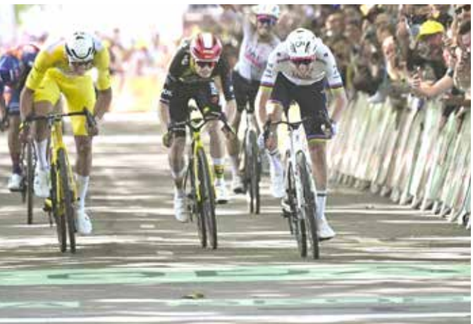
UAE Team Emirate - XRG team's Slovenian rider Tadej Pogacar (R) sprints to the finish line