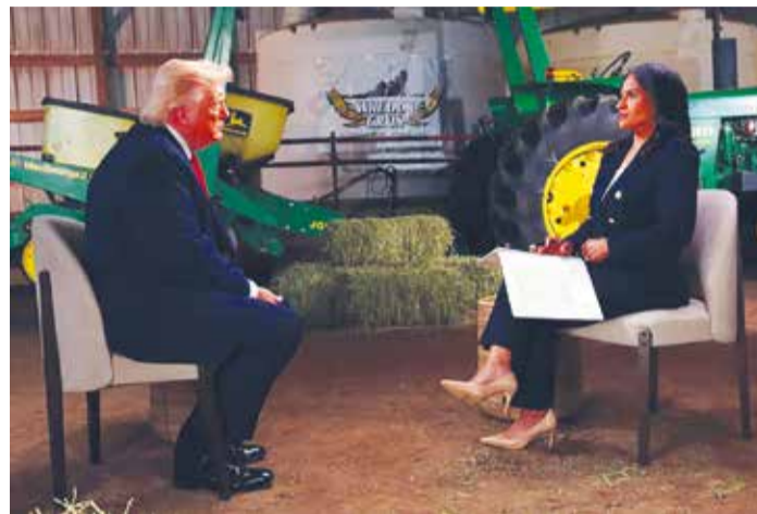
The interview, filmed Friday, was conducted on a farm in Wisconsin