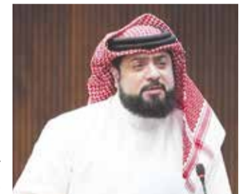
Mohammed Salman Al Ahmed, MP

The proposal also calls for stiffer penalties for anyone found to have tampered with an odometer to mislead buyers. Al Ahmed said many consumers have weak means of checking a car's true mileage,