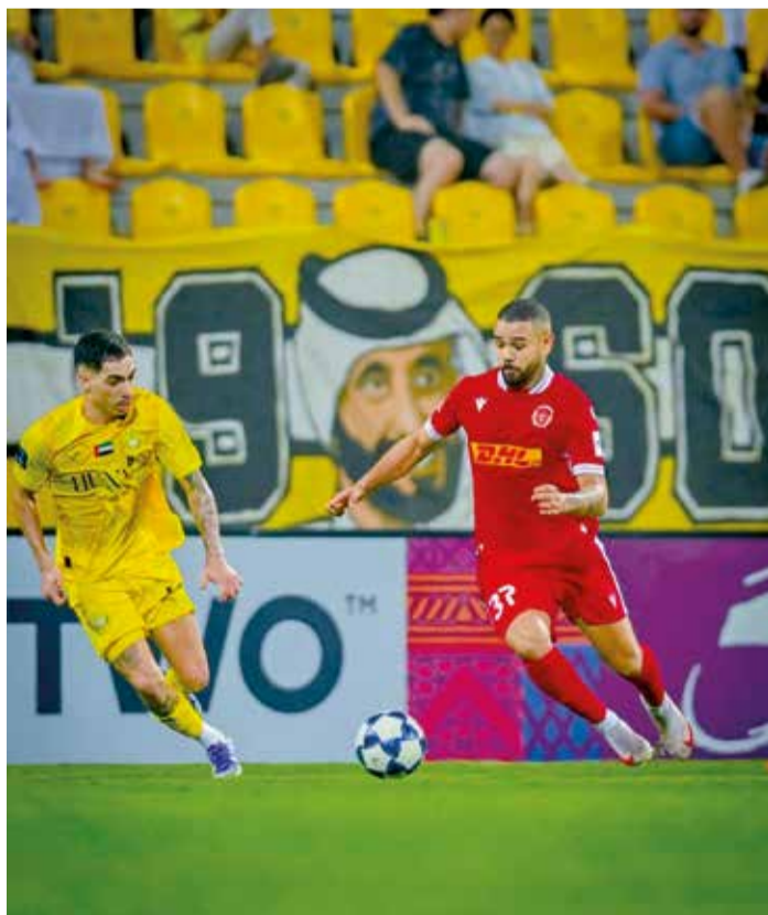
Action from Muharraq's AFC Champions League Two match against Al Wasl last season

Meanwhile, Riffa will compete in the Gulf Club Champions League as Bahrain's sole representative in the regional tournament. Their qualifica-