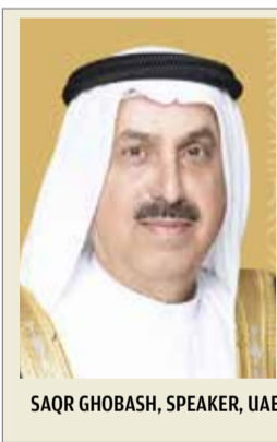
SAQR GHOBASH, SPEAKER, UAE FEDERAL NATIONAL COUNCIL

The UAE's Federal National Council President has condemned the Iranian terrorist attacks on Bahrain, saying the kingdom's security was ‘an indivisible part’ of the UAE's own security and of the Gulf security system. In a letter to Parliament Speaker Ahmed bin Salman Al Musallam, Saqr Ghobash said the attacks amounted to a clear breach of Bahrain's sovereignty, security and stability, as well as a grave breach of international law and the rules governing ties between states. Mr Ghobash said the UAE was following the developments with deep condemnation and stood firmly with Bahrain against any threat to its sovereignty and stability. ‘The security of the Kingdom of Bahrain is an indivisible part of the security of the UAE,’ he said, adding that any harm to Bahrain's sovereignty and stability was also a blow to Gulf security as a whole. He said the developments