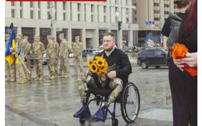
A man holds flowers during the funeral ceremony of Yaroslav Varnak, a 23-year-old serviceman who was killed in action in Kyiv