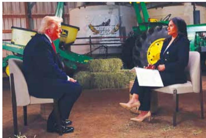
The interview, filmed Friday, was conducted on a farm in Wisconsin