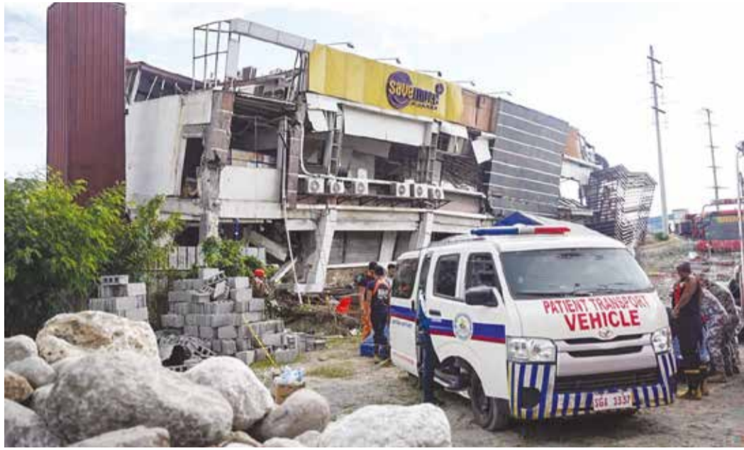
Responders conduct a rescue operation at a collapsed building after a 7.8 magnitude earthquake in General Santos City