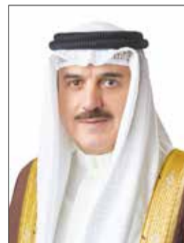
H.E. Ahmed bin Salman Al Musallam, Speaker of the Parliament