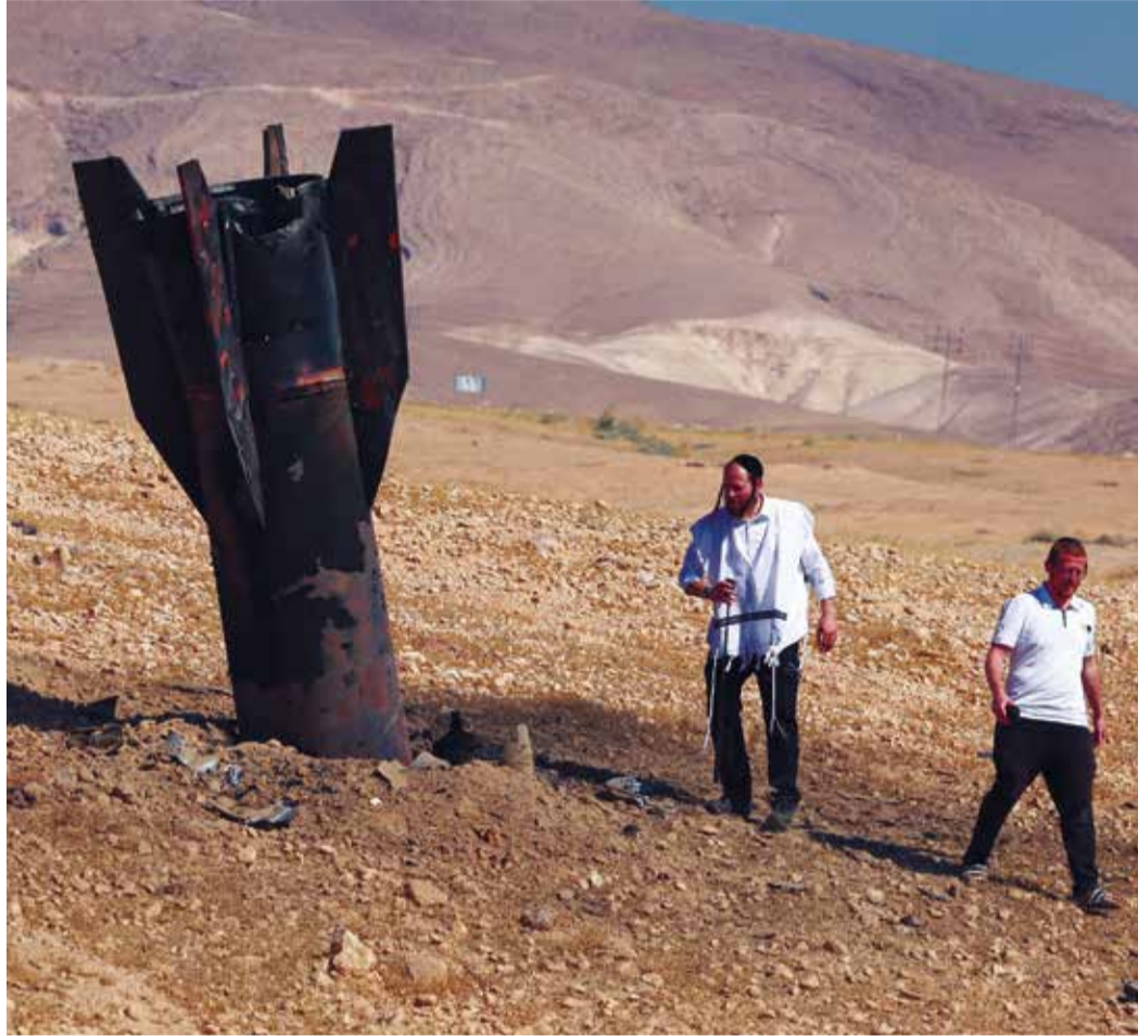
Two men examine a fallen rocket half-buried in the ground on the outskirts of Jericho

Congress of Vienna ends after reshaping the political map of Europe