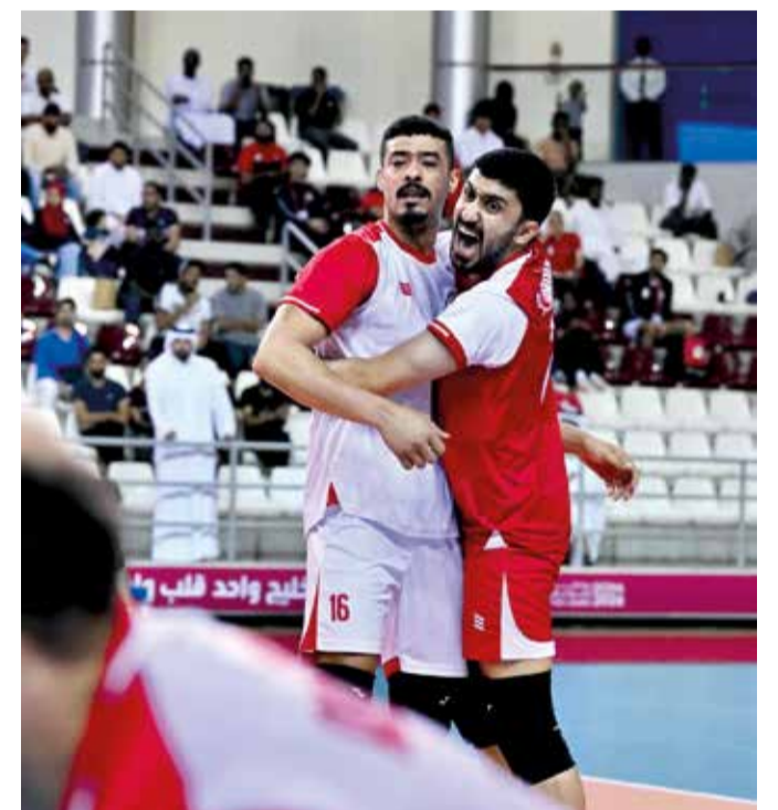
Celebratory moment from Bahrain's victory at the Gulf Games last month