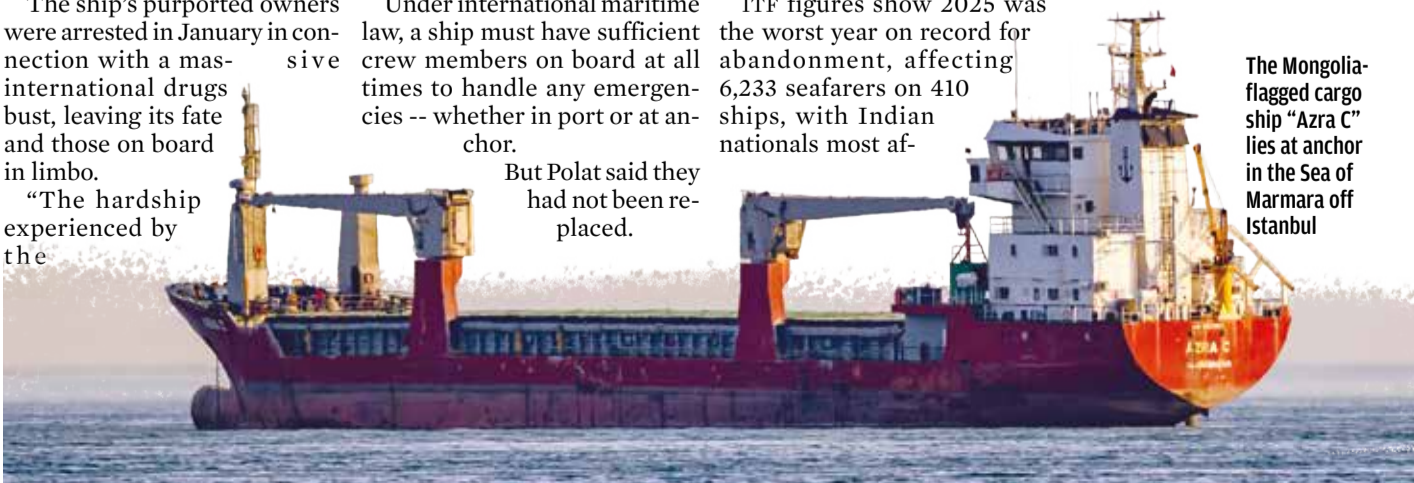
The Mongolia-flagged cargo ship "Azra C" lies at anchor in the Sea of Marmara off Istanbul

There are currently 15 foreign-flagged vessels classed as abandoned at anchor in the Sea of Marmara, which lies between the Bosphorus Strait that leads to the Black Sea and the Dardanelles Strait, the gateway to the Mediterranean.