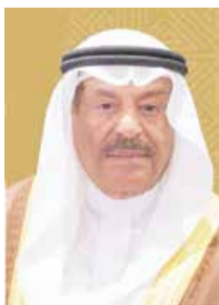
H.E. Ali bin Saleh Al Saleh, Chairman of the Shura Council

“The security of the Kingdom of Bahrain is an indivisible part of the security of the UAE.”