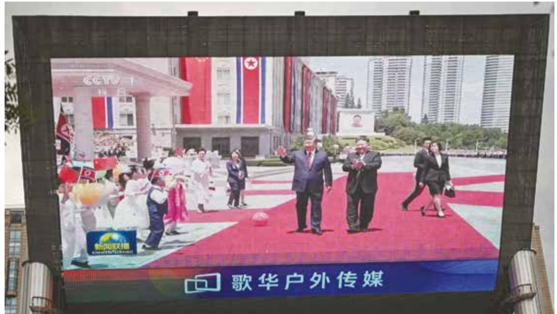
This picture shows a giant screen displayed outside a shopping mall in Beijing on June 8, 2026, showing a news program about the meeting between China's President Xi Jinping and North Korean leader Kim Jong Un held in North Korea.

The two sides should strengthen exchanges "in diplomacy, law