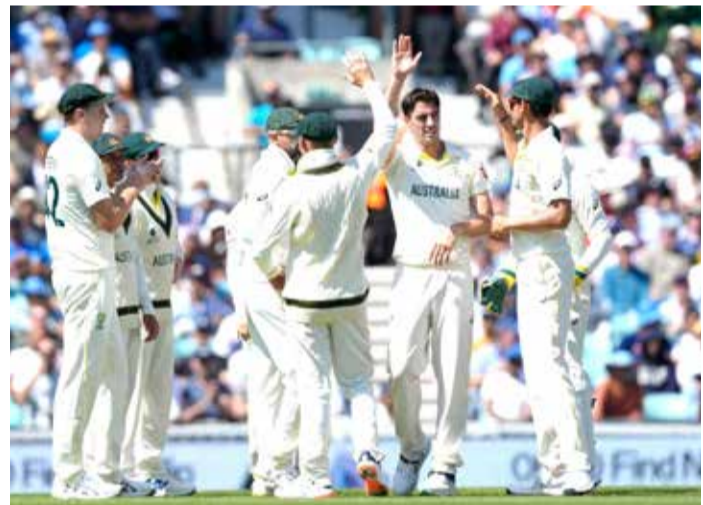
Australia's Pat Cummins celebrates dismissing India's captain Rohit Sharma

England's Stuart Broad tried to rile Australia before this match by saying he hoped Cheteshwar Pujara and Virat Kohli