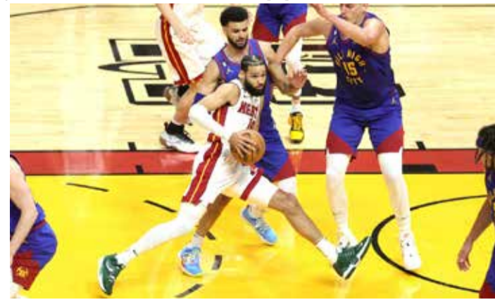
Caleb Martin of the Miami Heat drives to the basket against Jamal Murray and Nikola Jokic of the Denver Nuggets

Murray scored 34 points and grabbed 10 rebounds and 10