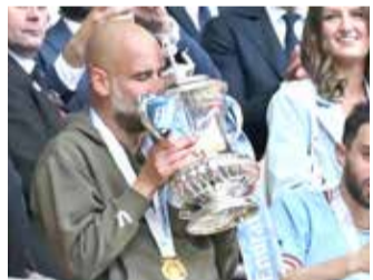
Manchester City boss Pep Guardiola holds the FA Cup

That figure saw them overtake Madrid, last year's Euro-