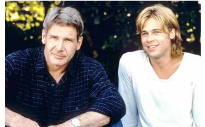
Harrison Ford admits to clashing with Brad Pitt Fox | Los Angeles

Harrison Ford admitted to clashing with Brad Pitt over creative differences on the set of their 1997 movie 'The Devil's Own.'