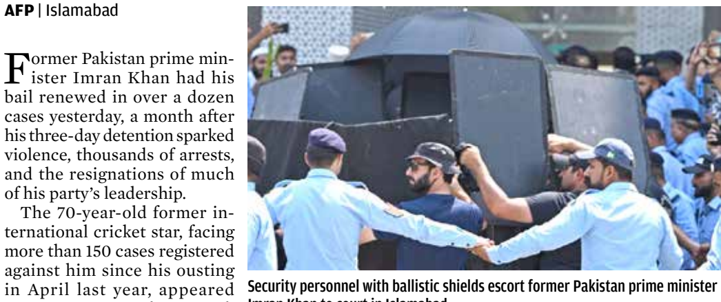
Imran Khan to court in Islamabad

Pakistan has been mired in economic and political crisis for over a year, with little respite