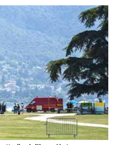
he 'Jardins de l'Europe' in Annecy