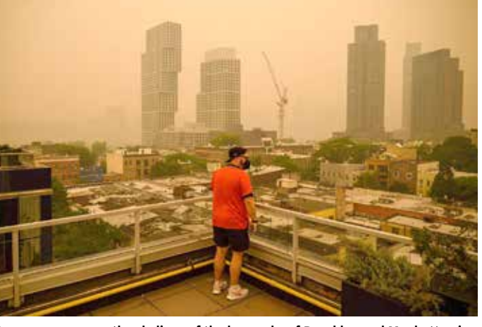
Heavy smog covers the skylines of the boroughs of Brooklyn and Manhattan in

canceled all outdoor activities and Charlotte." including recess, physical ed-