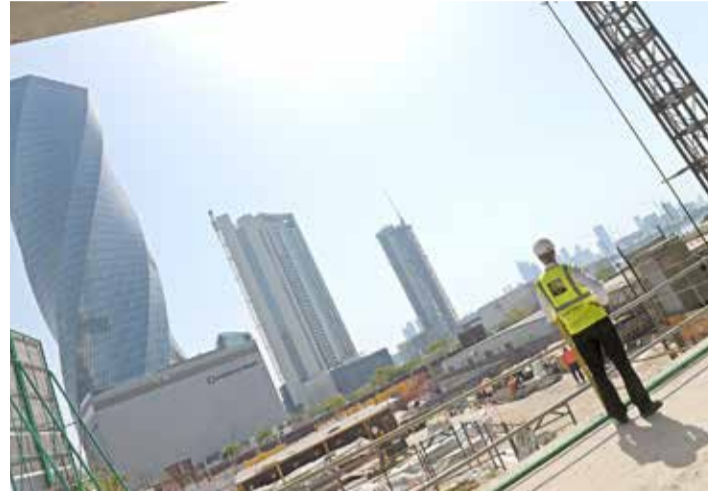
Workers work on the construction site of the Golden Gate towers at Bahrain Bay in Manama on March 25, 2023

Regarding relative humidity, May's mean relative humidity stood at 42%, while the mean maximum relative humidity was 62% and the mean minimum relative humidity was 25%. The highest relative humidity of 79% was observed on May 22nd, while the lowest relative humidity of 10% occurred on May 13th.