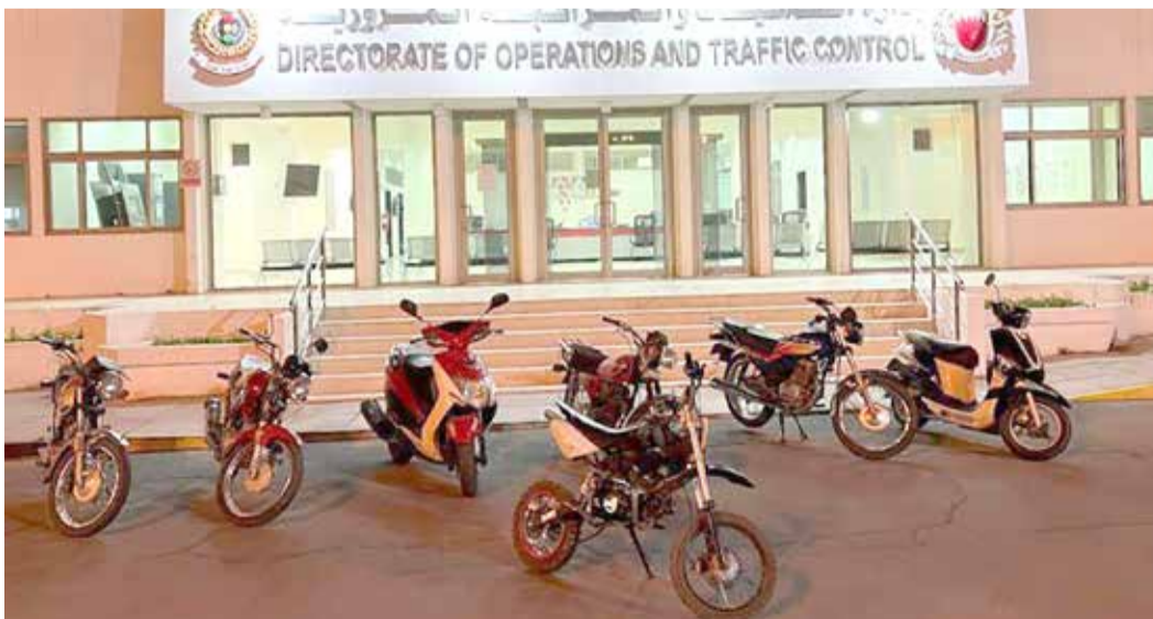
The two-wheelers seized by police on display before the Directorate of Operations and Traffic Control

The department emphasised its zero-tolerance policy towards activities that violate the