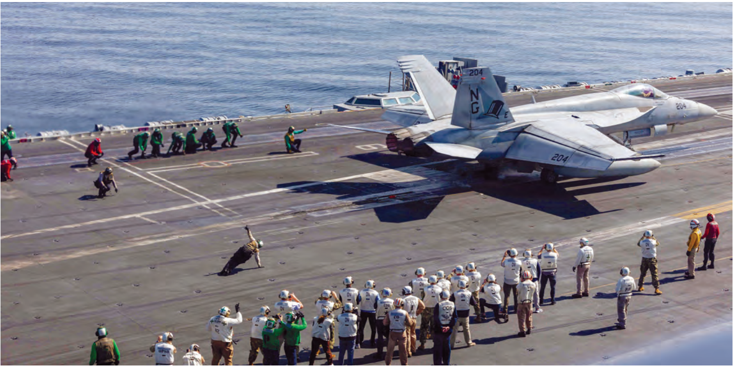
Observers including US lead negotiators Steve Witkoff and Jared Kushner, as they watch flight operations on the flight deck of Nimitz-class aircraft carrier USS Abraham Lincoln (CVN 72) in the Arabian Sea,

The United States and Iran reopened negotiations on Friday in Oman