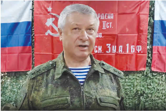
Russian Lieutenant General Vladimir Alekseyev

The man in his 60s was "arrested and handed over to Russia" after fleeing to the United Arab Emirates, while a suspected accomplice was arrested in