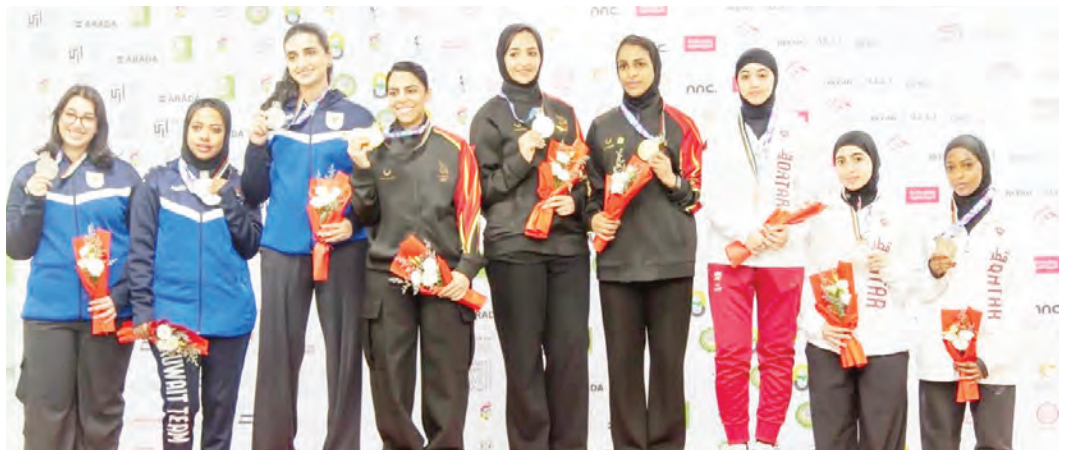
Bahrain's champions stand tall as Kuwait takes silver, Qatar bronze

These wins bring Al Riffa Club's total in shooting to four golds and one bronze. They rank fourth on the overall medal table with 21 points, behind Sharjah Women's Sports Club from the UAE, which leads with nine golds and 46 points. Bahrain's women's basketball team, Al Hala, also played yesterday, losing 81-52 to Jordan's Al Fuheis (19-6, 25-17, 23-13, 14-16). The team opened the tournament with a narrow 68-65 defeat to hosts Al Sharjah