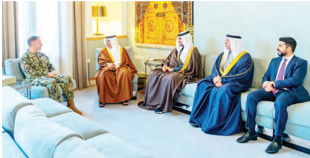
HRH Prince Salman meets with Admiral Charles Bradford Cooper II

Comprehensive Security Integration and Prosperity Agreement (C-SIPA).