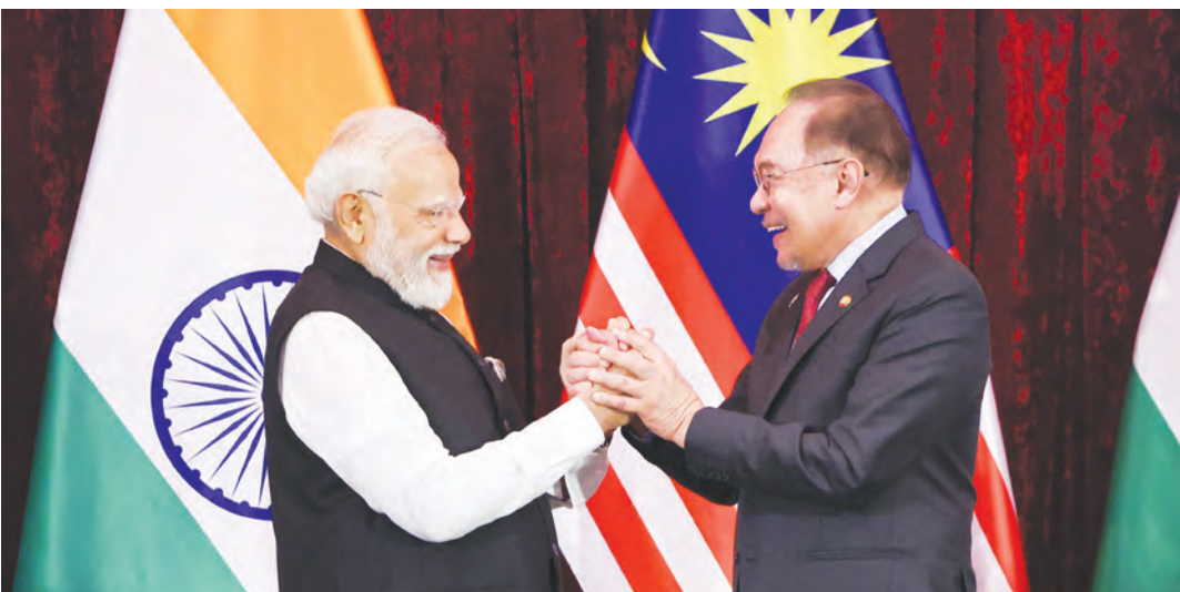
India's Prime Minister Narendra Modi and Malaysian Prime Minister Anwar Ibrahim hold hands during a press conference in Putrajaya

“Along with AI and digital technologies, we will advance our partnership in semiconductors, health, and food security,” Modi said.