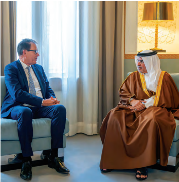
HRH the Deputy King with the Director General of UNIDO