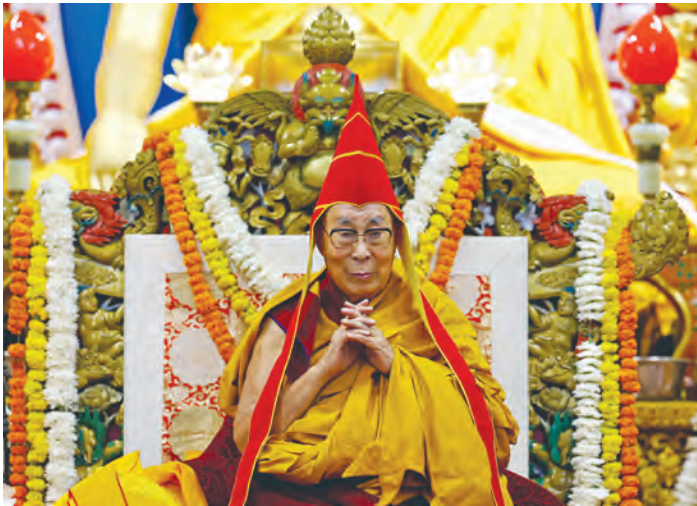
Tibetan spiritual leader the Dalai Lama attends a long-life prayer offering ceremony at the Main Tibetan Temple in McLeod Ganj, near Dharamsala

firm that His Holiness has never met Jeffrey Epstein or authorised any meeting or interaction with him by anyone on His Holiness's behalf," it added.