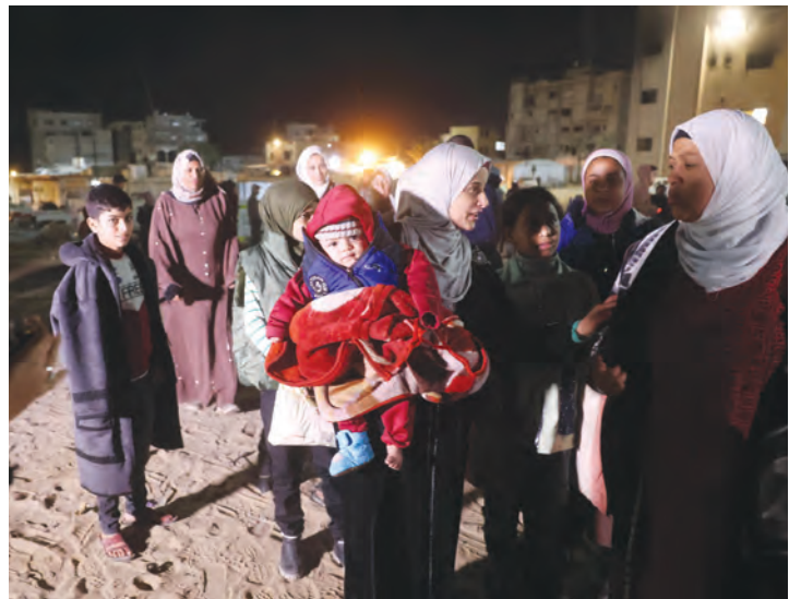
Palestinians, coming from the Rafah crossing with Egypt, arrive at Nasser Hospital in Khan Yunis in the southern Gaza Strip

"Official statistics on the movement at the Rafah crossing from