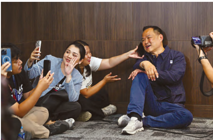
Thailand's Prime Minister and Bhumjaithai Party leader Anutin Charnvirakul speaks to journalists

His Bhumjaithai party was forecast to win nearly 200 seats by Channel 3 on the basis of results from the parties. The progressive People's Party trailed