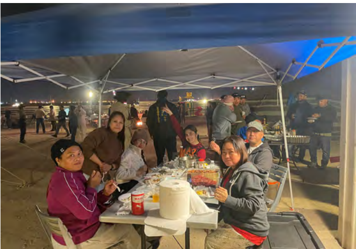
Three organizations demonstrate unity through teamwork, friendship, and shared experiences

“The theme was reflected throughout the program, from shared activities to cooperative