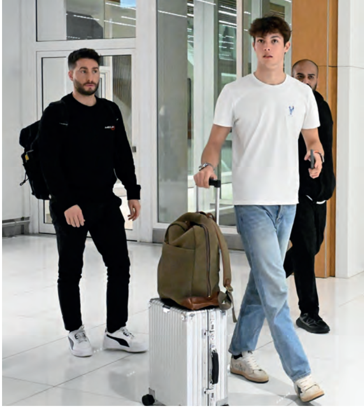
Oliver Bearman of Haas team arrives in Bahrain

There is also free access on both open days of the second Bahrain test on 19 and 20 February for all who purchased their tickets to the F1 Gulf Air Bahrain Grand Prix 2026 before 8 September last year.