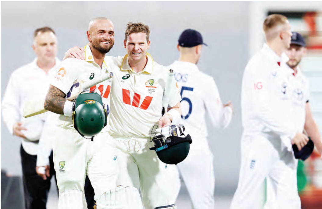
Australia's captain Steve Smith (C) celebrates with team mate Jake Weatherald (2nd L) after hitting the winning runs

Their batting, apart from Joe Root and Zak Crawley in the first innings and captain Ben