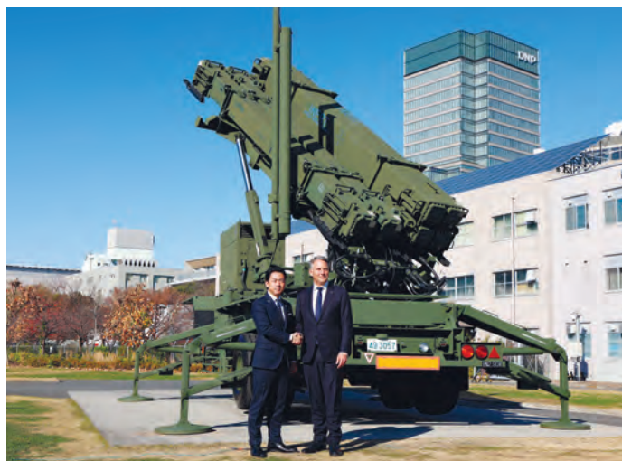
Japanese Defence Minister Shinjiro Koizumi (L) poses with Australian Defence Minister Richard Marles in front of a Patriot Advanced Capability-3 (PAC-3) missile interceptor unit at the Defense Ministry in Tokyo

Defence Minister Shinjiro Koizumi said the incident