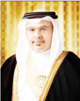
HRH Prince Salman