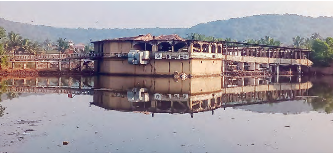
A general view shows the burned nightclub following a fire that broke out last midnight in Goa

A fire that ripped through an Indian nightclub in the popular tourist resort region of Goa killed 25 people, the state's chief minister said yesterday. Tourists were among the dead in the blaze, which broke out at about midnight at a club in Arpora in the north of the coastal state. Prime Minister Narendra Modi said in a statement that the deaths were "deeply saddening". Goa, a former Portuguese colony on the shores of the Arabian Sea, lures millions of tourists every year with its nightlife, sandy beaches and laid-back coastal atmosphere. "Today is a very painful day for all of us," Goa Chief Minister Pramod Sawant said in a statement, saying that "25 people have lost their lives and six have been injured." Sawant told journalists that "three to four" tourists had died, without giving their nationalities. "I have ordered a magisterial inquiry into the entire incident to identify the cause and fix responsibility," Sawant added. "Fire show" Video images from the Press Trust of India news agency showed rescuers carrying the injured or dead on stretchers down the narrow stone staircase of the Birch nightclub. "Most people died due to suffocation in the basement and kitchen area," Nitin V. Raiker, Goa's fire chief, told Indian broadcaster CNN News18. "I received information that there was a club party going on, and a fire show was organised in the club. The wooden parts of the club caught fire, and smoke spread throughout the building."