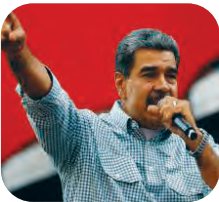
Venezuela acknowledges death of detained opposition figure

◆ Venezuela acknowledged yesterday an opposition figure died while in custody, as the Trump administration slammed Caracas as "vile" and the South American country's army swore in thousands of new soldiers amid mounting US military pressure. Leftist President Nicolas Maduro has called for stepped-up military recruitment after the United States deployed a fleet of warships and the world's largest aircraft carrier to the Caribbean under the pretext of combating drug trafficking. Washington has accused Maduro of leading the alleged "Cartel of the Suns," which it declared a terrorist organization last month. Under President Donald Trump, US forces have carried out deadly strikes on more than 20 alleged drug-smuggling vessels, killing at least 87 people.