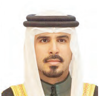
HH Shaikh Mohammed bin Salman