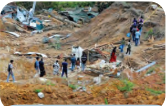
Sri Lanka issues landslide warnings as cyclone toll hits 627

◆ Sri Lankan authorities issued fresh landslide warnings on Sunday with rains lashing areas already devastated by a powerful cyclone, as the death toll rose to 627. A chain of tropical storms and monsoon rains has battered Southeast and South Asia, setting off landslides, flooding vast tracts and cutting off communities from Sumatra island's rainforests to the highland plantations of Sri Lanka. At least 1,826 people have been killed in the natural disasters rolling across Sri Lanka, Indonesia, Malaysia, Thailand and Vietnam over the past two weeks. Indonesia's president on Sunday vowed to step up aid, with demonstrators rallying after the country's death toll surpassed 900. More than two million people in Sri Lanka -- nearly 10 percent of the population -- have been affected by last week's floods and landslides triggered by Cyclone Ditwah, the worst on the island this century.