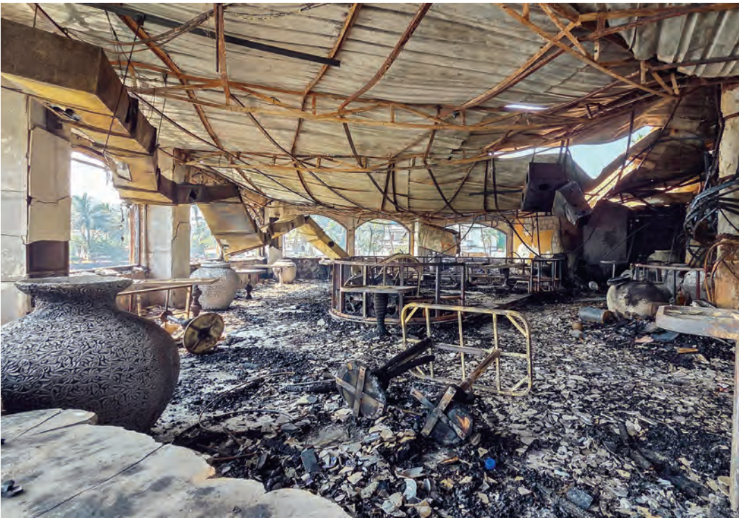
A burned-out interior is seen inside the Birch nightclub following a fire that broke out last midnight, in Goa