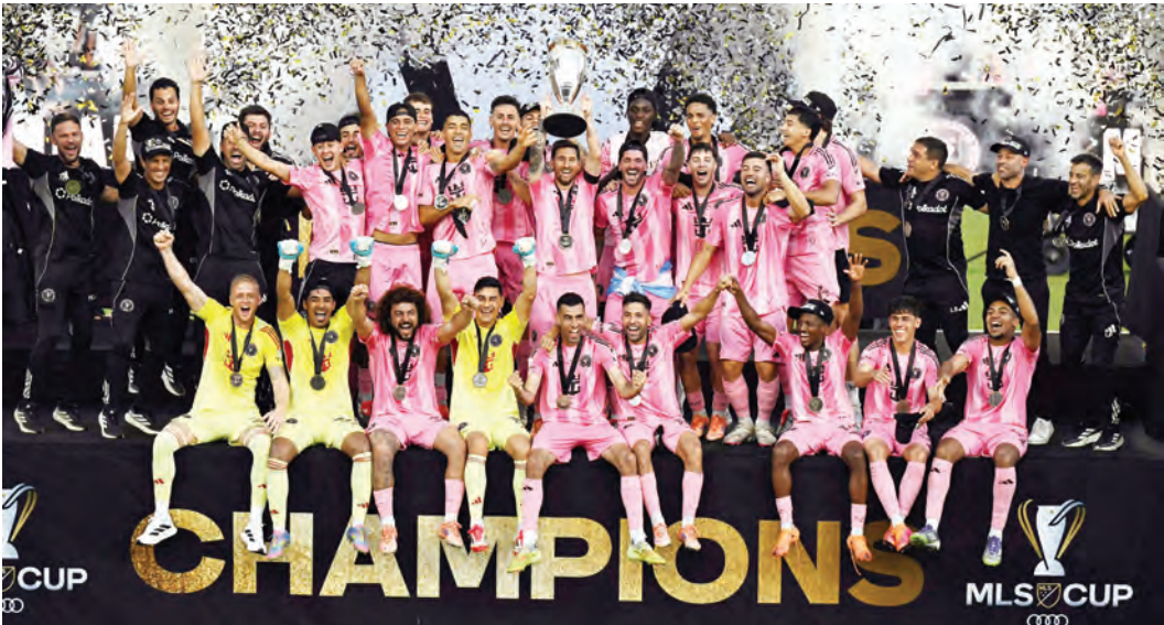
Lionel Messi celebrates with his Inter Miami team-mates after their MLS Cup victory over Vancouver Whitecaps

Miami's first Major League Soccer crown provided glittering vindication for co-owner David Beckham, the former