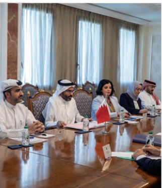
The meeting in progress

dom's commitment to enhancing cooperation with Russia and advancing ties to serve the shared interests of both coun-