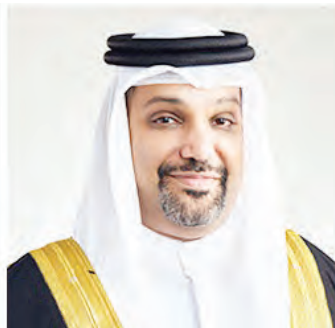
H.E. Shaikh Salman

McLaren's achievement marks the first time in 27 years that the team has secured both titles in the same season.