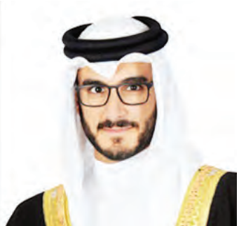
HH Shaikh Isa bin Salman