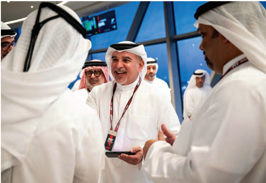
His Royal Highness Prince Salman bin Hamad Al Khalifa, the Crown Prince and Prime Minister, attends the Abu Dhabi Grand Prix