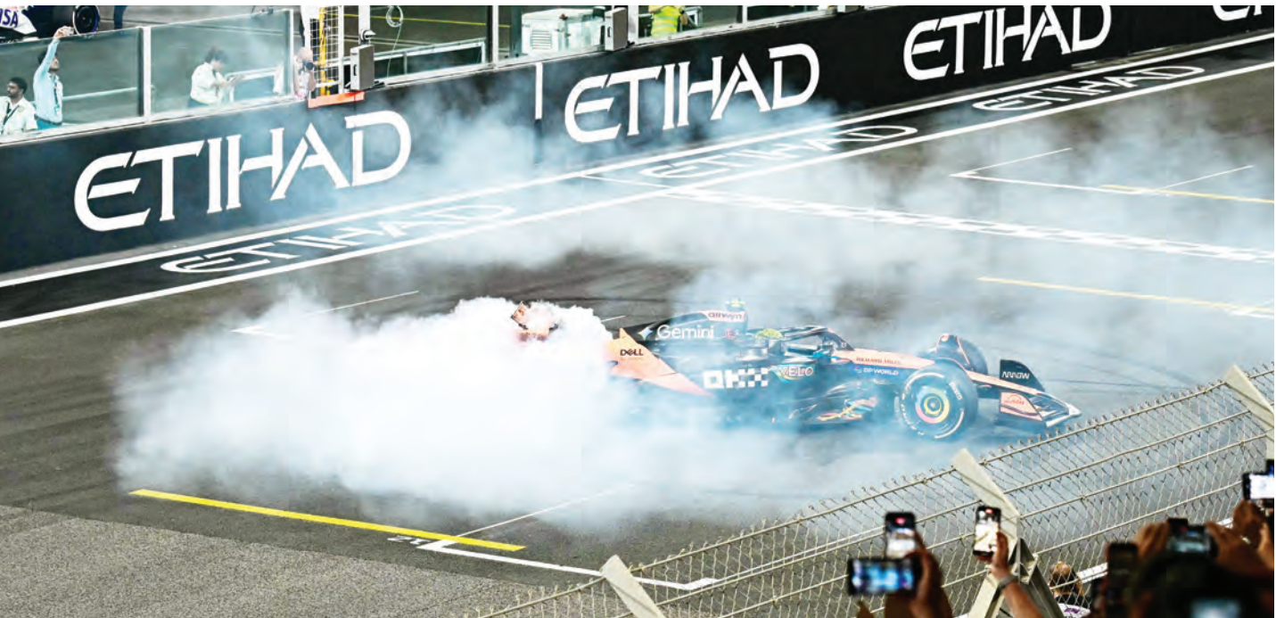
McLaren’s British driver Lando Norris performs a donut as he celebrates winning the world championship title

For Norris, 26, this was a painful period.