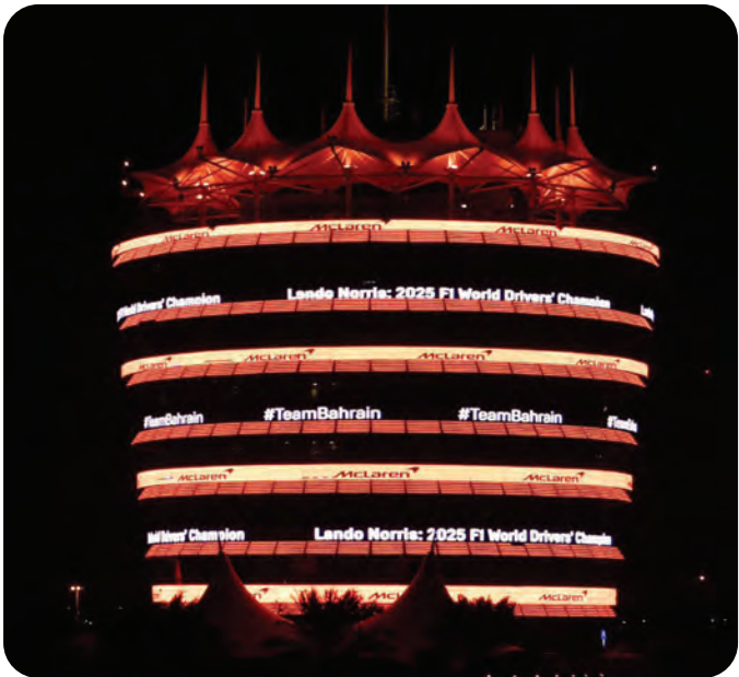
Bahrain International Circuit (BIC), ‘The Home of Motorsport in the Middle East’, turns Papaya to celebrate a new World Champion: Lando Norris!

back to them, I feel like I did my part for the team this year so I’m proud of myself.”