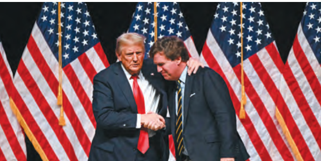
Former US President and Republican presidential candidate Donald Trump (L) shakes hands with US commentator Tucker Carlson at the end of a live interview in the finale of the Tucker Carlson Live Tour at Desert Diamond Arena in Glendale, Arizona