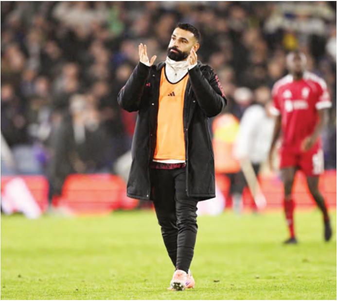
Liverpool's Egyptian striker #11 Mohamed Salah applauds fans on the pitch

Mohamed Salah took aim at Liverpool manager Arne Slot in an astonishing rant that could spell the end of his legendary career at Anfield after claiming he has been "thrown under the bus" during the Premier League champions' slump in form. The Egyptian was left on the bench for the third consecutive game in Saturday's 3-3 draw at Leeds and was not even introduced as a substitute by Slot. After next weekend's home match against Brighton, Salah is set to depart for the Africa Cup of Nations (AFCON) and hinted that could be his final appearance in a Liverpool shirt should he be selected. "I'm very, very disappointed. I have done so much for this club down the years and especially last season," Salah told reporters in the mixed zone at Elland Road. "Now I'm sitting on the bench and I don't know why. It seems like the club has thrown me under the bus. That is how I am feeling. I think it is very clear that someone wanted me to get all of the blame." "I got a lot of promises in the summer and so far I am in the bench for three games, so I can't say they keep the promise. I said many times before that I had a good relationship with the manager and all of a sudden, we don't have any relationship. I don't know why, but it seems to me, how I see it, that someone doesn't want me in the club." "This club, I always support it. My kids will always support it. I love the club so much, I will always do. I called my mum yes-