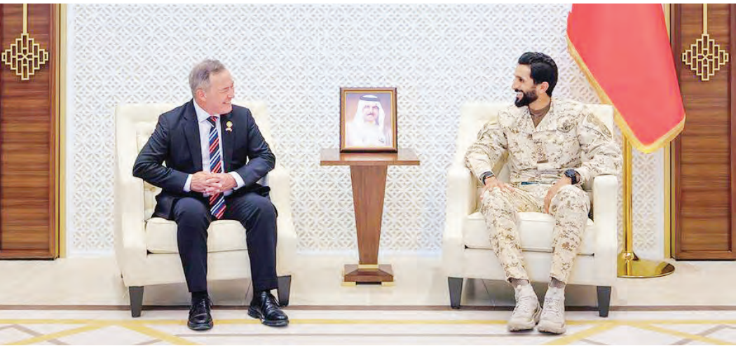
HH Shaikh Nasser receives US Congress delegation head, Representative James Moylan

The meeting was attended by His Excellency Shaikh Khalid bin Ali Al Khalifa, Deputy National Security Advisor, and H.E. Shaikh Ahmed bin Abdulaziz Al Khalifa, Chairman of