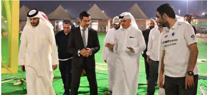
H.E. Wael bin Nasser Al Mubarak with key officials at the venue

The Minister added that the exhibition this year will feature a rich and integrated