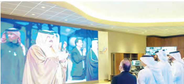
HH Shaikh Nasser meets Bapco officials, engineers and technicians during refinery tour

"This increase will raise the Kingdom's export capacity of high-value petroleum products by up to 40%, exceeding the operational targets initially set for the programme," His Highness said. As part of Bahrain's drive to localise energy-related industries, HH Shaikh Nasser inaugurated the Bapco Manufacturing Facilities, a unit featuring advanced workshops capable of producing spare parts and vital equipment for the refinery. The facility currently meets 10% of the company's annual requirements.