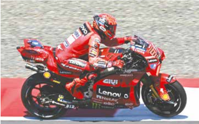
Ducati Lenovo Team's Spanish MotoGP rider Marc Marquez rides during the second free practice ahead of the MotoGP Indonesian Grand Prix

Newly-crowned world champion Marc Marquez was on Monday ruled out of the next two races after suffering a fracture and ligament injury to his right shoulder in the Indonesia MotoGP race. The Spaniard was shunted off his Ducati at high speed on the first lap of the Indonesia MotoGP on Sunday. Ducati said the Spaniard had "suffered a fracture at the base of the coracoid process and a ligament injury to his right shoulder," but ruled out any