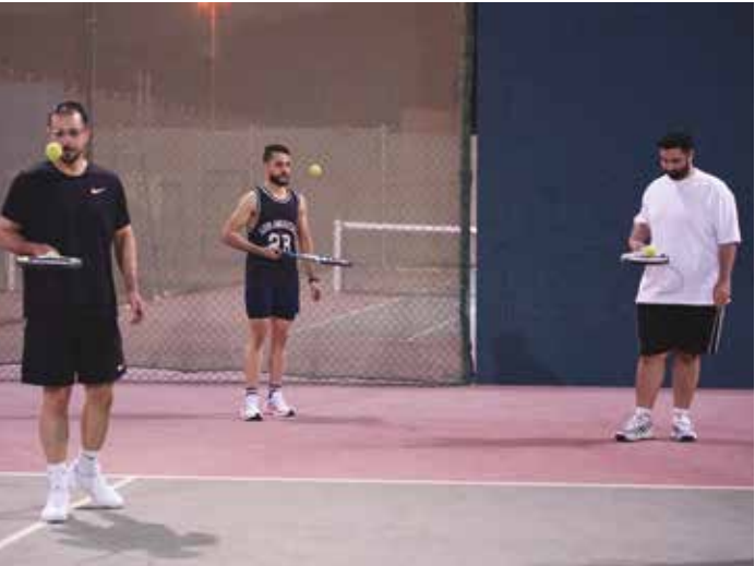
Participants attend the programme