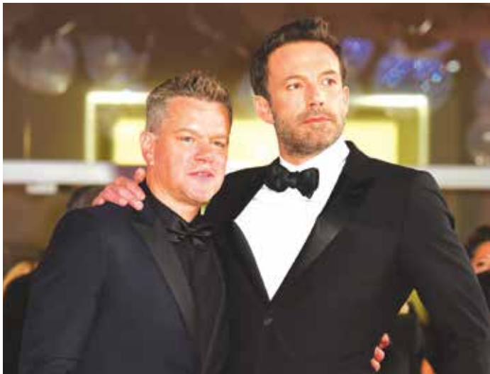
Matt Damon and Ben Affleck

Matt Damon and Ben Affleck will never stop acting together even if they “oversaturate the marketplace”. The two life long friends - who met at high school and first worked with on 1997’s Good Will Hunting - have made three films together in the last four years, with The Last Duel, Air and The Rip. Matt has revealed how he started crying after watching Peter Jackson’s Beatles documentary Get Back, which concluded with a title card noting how the band never worked together again. Speaking to GQ magazine, he recalled telling Ben: “Who cares if we oversaturate the marketplace with movies we’re both in?” “We’re crazy if we don’t take advantage of the fact that we are both still here and able to do this.” In The Rip, the pair fall