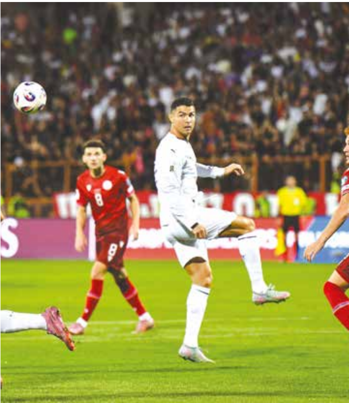
Portugal's forward Cristiano Ronaldo in action