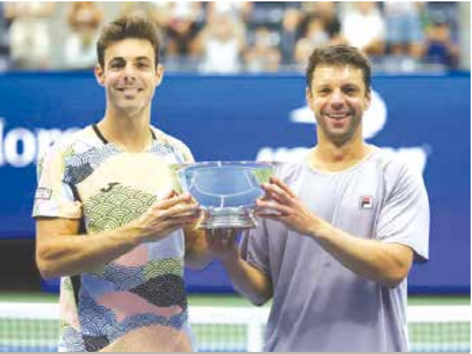
Spain's Marcel Granollers (L) and Argentina's Horacio Zeballos with the trophy

Marcel Granollers and Horacio Zeballos saved three championship points against all-British pair Joe Salisbury and Neal Skupski on Saturday to win their first US Open men's doubles title. Salisbury and Skupski were a point away from winning with their opponents serving down 5-4 down in the third set but Granollers and Zeballos fought back to prevail 3-6, 7-6 (7/4), 7-5. It is a second Grand Slam triumph for Spain's Granollers and Argentina's Zeballos. They also beat Salisbury and Skupski in three sets at this year's French Open final. "When you play these kind of matches it's so unfair there's a winner and a loser," said Zeballos. "I don't really know how we... won those last points after what we did during the match. We kept fighting. I think if I had to describe the match with one phrase is 'never give up'."