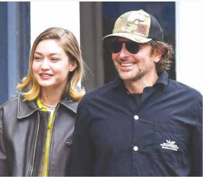
Gigi Hadid and Bradley Cooper

Gigi Hadid and Bradley Cooper are "on the same page about what they want long-term". The 30-year-old model has been dating Bradley, 50, for two years, and the loved-up couple are both happy with where their relationship is heading. A source told People: "They've talked about blending their lives more, but they're not pushing it. They're on the same page about what they want long-term, and they're letting it happen naturally." The celebrity duo are said to be "in a great place right now". The source added: "Their schedules are packed, but they've figured out a rhythm that works for them and the kids. Khai, four, with Zayn Malik - and Bradley don't intended to rush things. The insider said: "They're not in a rush but what they have