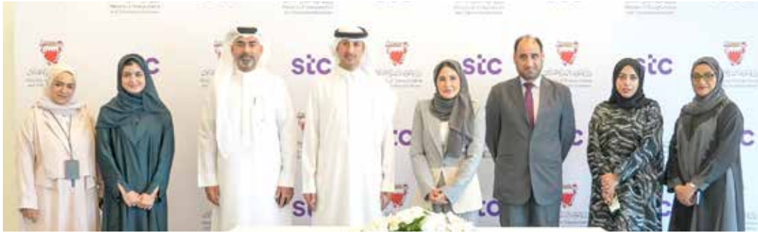
Representatives from the Ministry of Transportation and Telecommunications and stc Bahrain

Bahrain has marked a milestone in its digital transformation with the launch of the Kingdom’s first digital bus station, a pioneering step hailed as a breakthrough for public transport and smart mobility. The Ministry of Transportation and Telecommunications signed a strategic cooperation agreement with stc Bahrain to establish the hub, which officials say will consolidate Bahrain’s position as a regional leader in