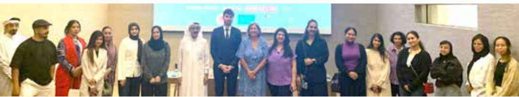
Representatives from the Embassy of France, BACA and the Alliance Française Bahrain