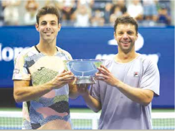
Spain's Marcel Granollers (L) and Argentina's Horacio Zeballos with the trophy

Marcel Granollers and Horacio Zeballos saved three championship points against all-British pair Joe Salisbury and Neal Skupski on Saturday to win their first US Open men's doubles title. Salisbury and Skupski were a point away from winning with their opponents serving down 5-4 down in the third set but Granollers and Zeballos fought back to prevail 3-6, 7-6 (7/4), 7-5. It is a second Grand Slam triumph for Spain's Granollers and Argentina's Zeballos. They also beat Salisbury and Skupski in three sets at this year's French Open final. "When you play these kind of matches it's so unfair there's a winner and a loser," said Zeballos. "I don't really know how we... won those last points after what we did during the match. We kept fighting. I think if I had to describe the match with one phrase is 'never