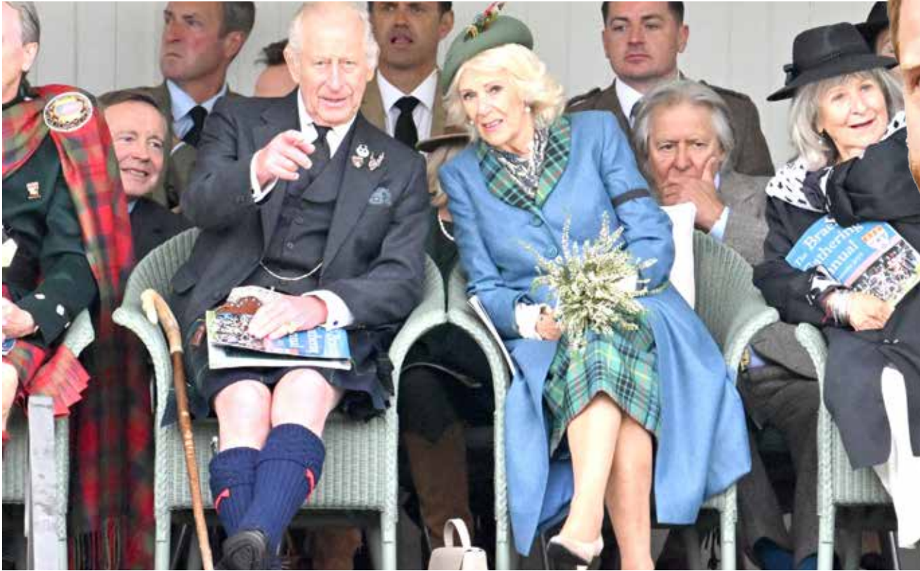
Britain's King Charles III and Britain's Queen Camilla attend the annual Braemar Gathering in Braemar, central Scotland

A photo of them sitting together, accompanied by Harry's UK