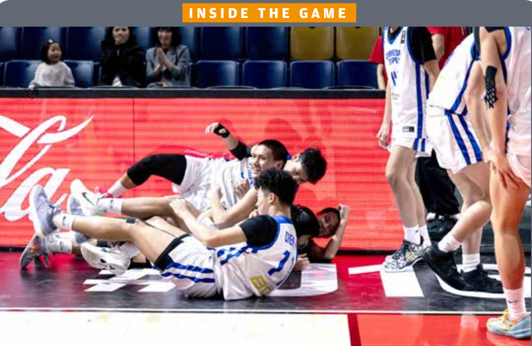
Chinese Taipei rejoice after their win