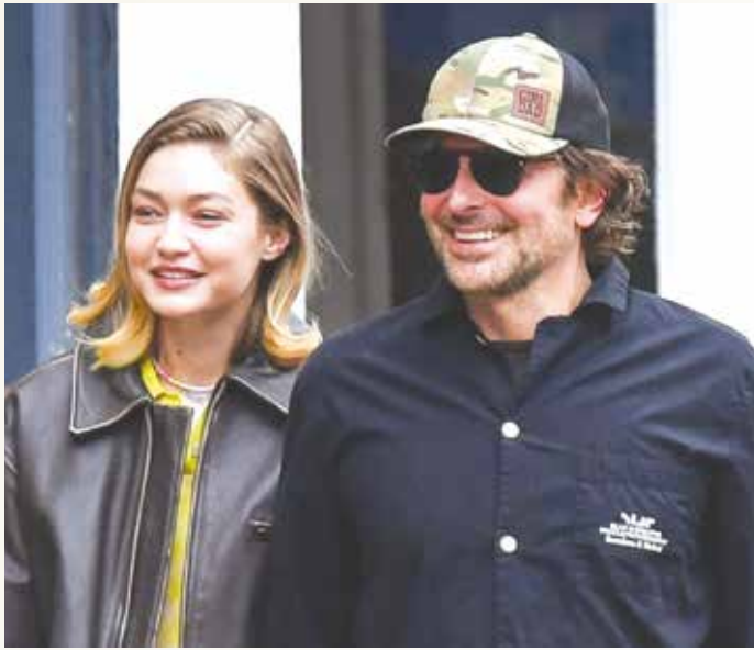
Gigi Hadid and Bradley Cooper