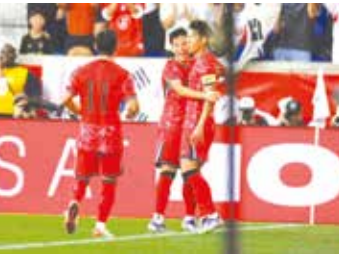
Son Heung-min, at right being hugged, celebrates his goal with teammates

secure South Korea’s triumph against a US side coached by Mauricio Pochettino -- Son’s former boss at Tottenham Hotspur. Son joined Major League Soccer’s Los Angeles FC in a blockbuster move last month that has energized Korean football fans in the United States.