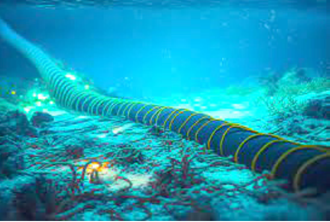
Dubai, United Arab Emirates

Global tech giant Microsoft yesterday said network traffic for its Azure cloud computing platform was experiencing increased delays in parts of the Middle East due to "undersea fibre cuts" in the Red Sea. Microsoft did not provide an explanation for what caused the cuts to the submarine lines but noted its network had been affected since Saturday. "Network traffic that does not traverse through the Middle East is not impacted," the company said in a statement. The internet access monitoring organisation NetBlocks noted that a series of submarine cable outages in the Red Sea has degraded internet connectivity in several countries, including in India and Pakistan. Global internet and telecom cables have followed shipping routes through the Red Sea, but there has been growing