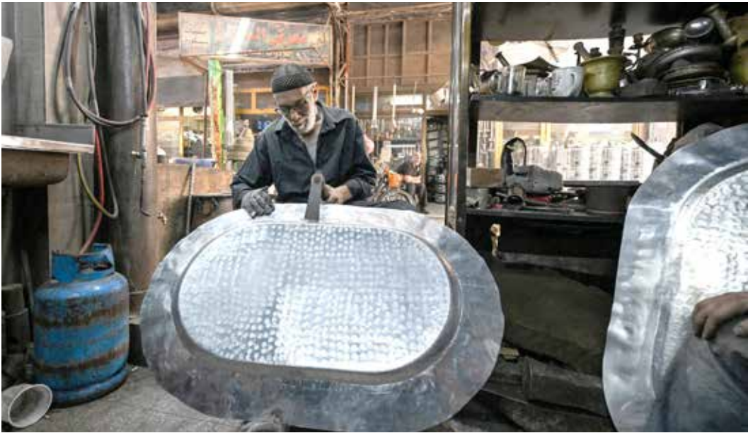
A Syrian coppersmith uses a metallic tool as he makes a large tray, in front of a workshop in Damascus

Saudi Arabia announced yesterday humanitarian projects for Syria including the removal of wartime rubble around Damascus, weeks after inking investment deals worth billions to help rebuild the country's infrastructure.