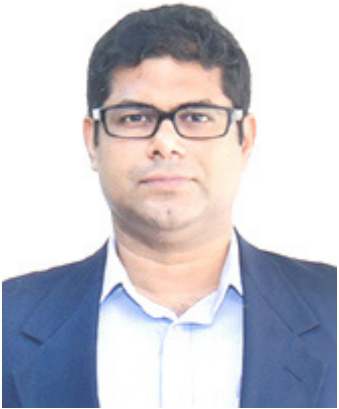
H.E. Ambassador Vinod K Jacob

The GST Council comprising the Union and the States collectively agreed in early September 2025 to GST rate cuts and reforms.