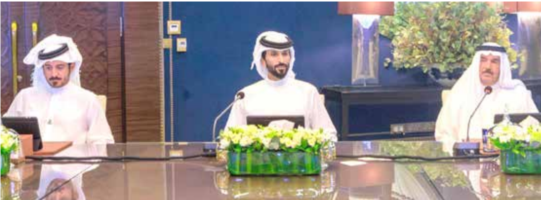
HH Shaikh Nasser and HH Shaikh Khalid chair the meeting

The project will assign each participating school a specific sport and combine it with a