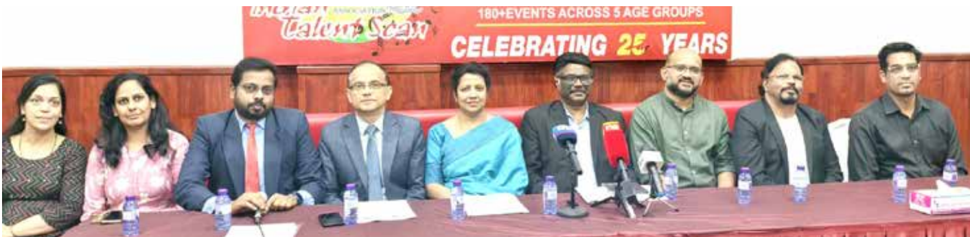
KCA officials and members at a press conference