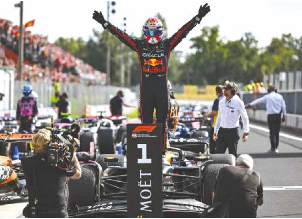
Red Bull Racing’s Dutch driver Max Verstappen celebrates after winning the Italian Formula One Grand Prix

Max Verstappen slowed McLaren’s Formula One dominance yesterday with a phenomenal display of driving on his way to victory at the Italian Grand Prix, the fastest ever race in the sports history. Starting from pole, reigning world champion Verstappen completed a magical weekend at Monza which included the fastest lap ever in F1 in Saturday’s qualifying by schooling McLaren pair Lando Norris and Oscar Piastri at Monza. Red Bull’s Verstappen has little chance of securing a fifth straight drivers’ title as he still trails championship leader Piastri by 94 points with the Australian finishing third. “It was really enjoyable,” said Verstappen who took the chequered flag in 1hr 13mins 24.325sec. “I think we pitted at the right