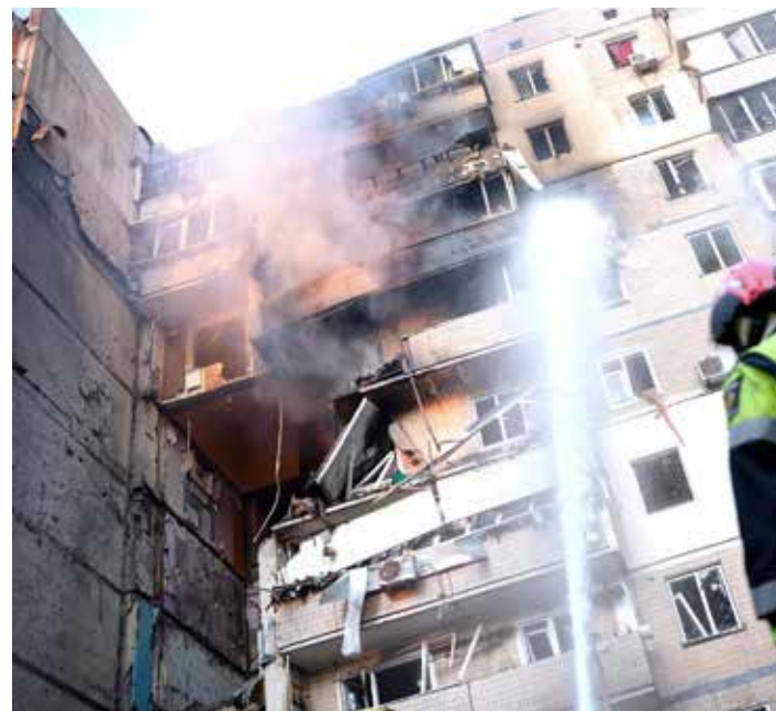
A firefighter works at a heavily damaged residential building following Russian drone and missile strikes in Kyiv

strikes were carried out on other targets within the boundaries of Kyiv", explicitly denying responsibility for the government building strike.