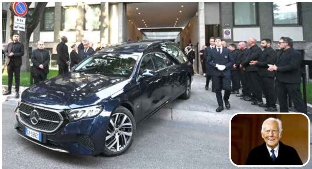
Armani's security staff members applaud as the hearse carrying the coffin of late Italian fashion designer Giorgio Armani leaves the Armani Theatre, in Milan