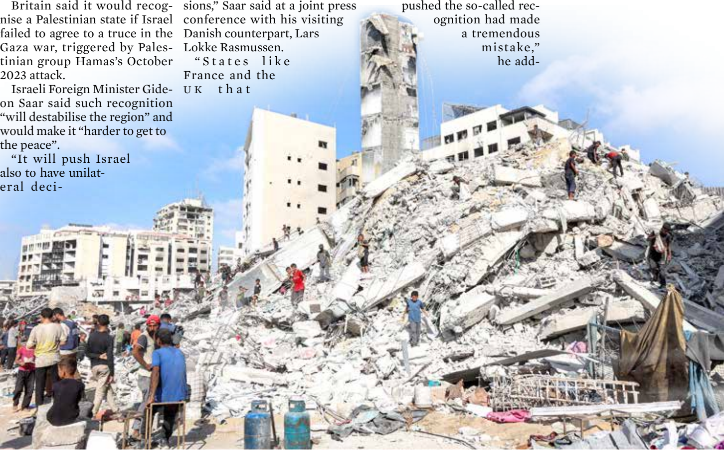
People search for salvage at the mound of rubble at the site of the collapsed Sussi Tower, which was destroyed earlier by Israeli bombardment, in Gaza City

pushed the so-called recognition had made a tremendous mistake," he added.