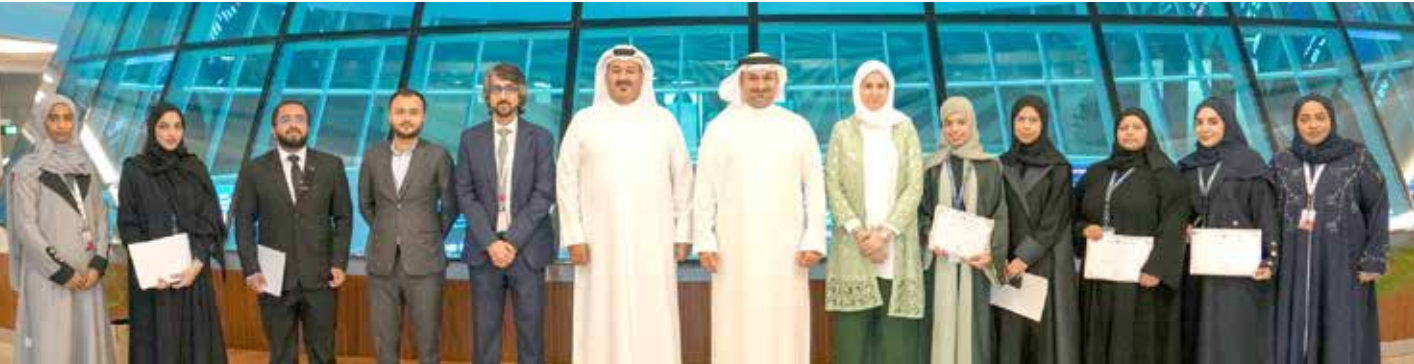
H.E. Abdulla bin Adel Fakhro with the graduates