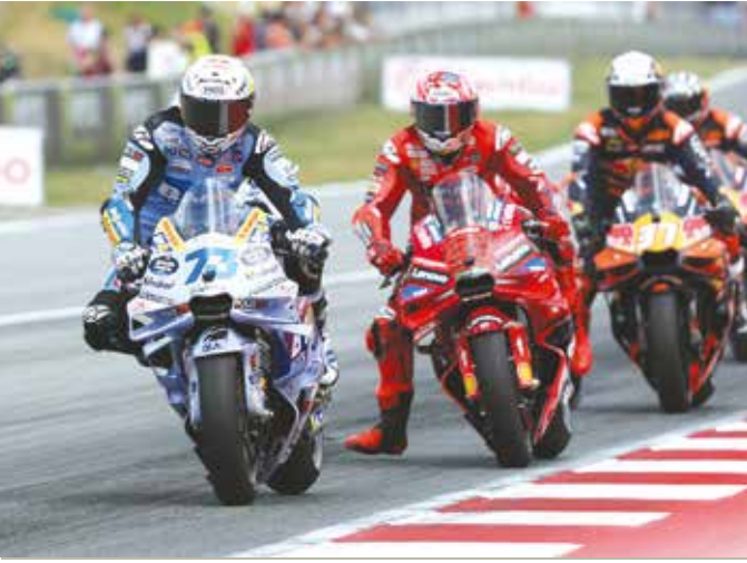
BK8 Gresini Racing MotoGP team’s Spanish MotoGP rider Alex Marquez (L) rides ahead of Ducati Lenovo Team’s Spanish MotoGP rider Marc Marquez