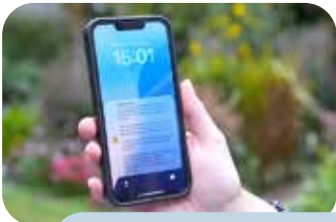
UK mobile phones blare in national emergency test

◆ Millions of mobile phones across the UK blared a siren sound at the same time on Sunday as part of government efforts to better prepare for national emergencies. The nationwide drill caused England's third ODI cricket match against South Africa to be paused while kick-off for a rugby league match was pushed back to avoid disruption. At 3:00 pm (1400 GMT), phones and tablets emitted the noise and vibrated for about 10 seconds, while users also received a message saying it was just a test. It was only the second test of the country's national emergency alert system following the first in 2023. The government had in recent weeks embarked on a publicity drive to minimise any shock caused, including through announcements at rail stations and signs on motorways.