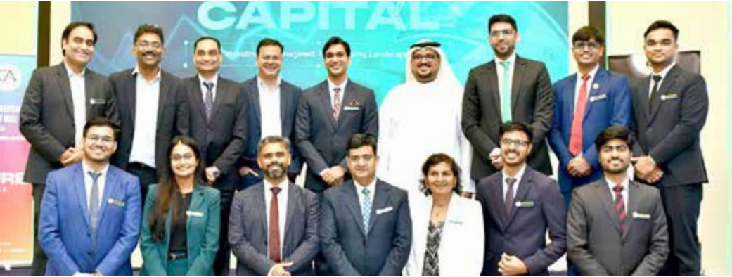
ICAI Bahrain officials with distinguished guests and participants