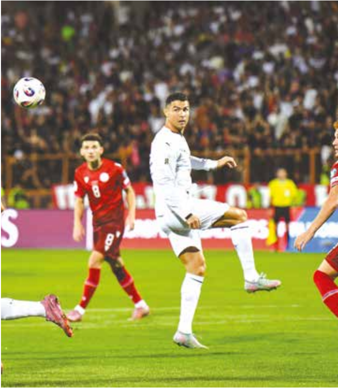
Portugal's forward Cristiano Ronaldo in action