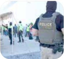
Seoul says over 300 South Koreans detained in US to be released

◆ Seoul said yesterday that negotiations with the United States to secure the release of South Korean workers detained in a raid by US immigration officials have been "concluded" and they would soon be freed and flown home. It follows the arrest of more than 300 South Korean workers at a Hyundai-LG battery plant being built in the southern state of Georgia on Thursday. The operation, carried out in the town of Ellabell, was the largest single site raid implemented so far under US President Donald Trump's nationwide anti-migrant drive, catching Seoul officials off guard. "As a result of the swift and united response... negotiations for the release of the detained workers have been concluded," Kang Hoon-sik, chief of staff to President Lee Jae Myung, said on Sunday.