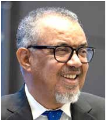
Geneva, Switzerland

World Health Organization chief Tedros Adhanom