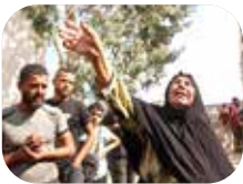
◆ A drone launched from Yemen injured a man when it fell on Ramon airport in southern Israel on Sunday, Israel's Magen David Adom emergency

service said. "Paramedics are providing medical treatment... to a 63-year-old male in mild condition, fully conscious, with shrapnel injuries to his limbs," the service said in a statement. A spokesperson for Israel's airports authority said the drone "hit the arrivals hall" and that operations at Ramon airport had been halted. The Israeli military said the drone was the fourth launched from Yemen within minutes of each other on Sunday.