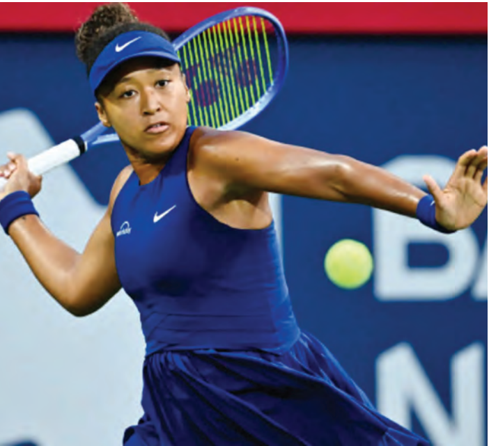
Naomi Osaka of Japan plays a forehand against Elina Svitolina of Ukraine

Four-time Grand Slam champion Naomi Osaka and Canadian teen sensation Victoria Mboko booked a championship showdown with gritty semi-final wins on Wednesday in the WTA Canadian Open in Montreal. Japan's Osaka, chasing her first tour-level title since the 2021 Australian Open, saved a pair of set points in the second-set tiebreaker to polish off a 6-2, 7-6 (9/7) victory over Denmark's Clara Tauson -- who was coming off victories over Wimbledon champion Iga Swiatek and Australian Open winner Madison Keys. Mboko saved a match point in a thrilling 1-6, 7-5, 7-6 (7/4) victory over former Wimbledon champion Elena Rybakina. The 18-year-old wild card fed off the energy of the crowd, crediting ecstatic supporters with carrying her through after a tumble left her with a sore right wrist in the third set of her first tour-level semi-final.