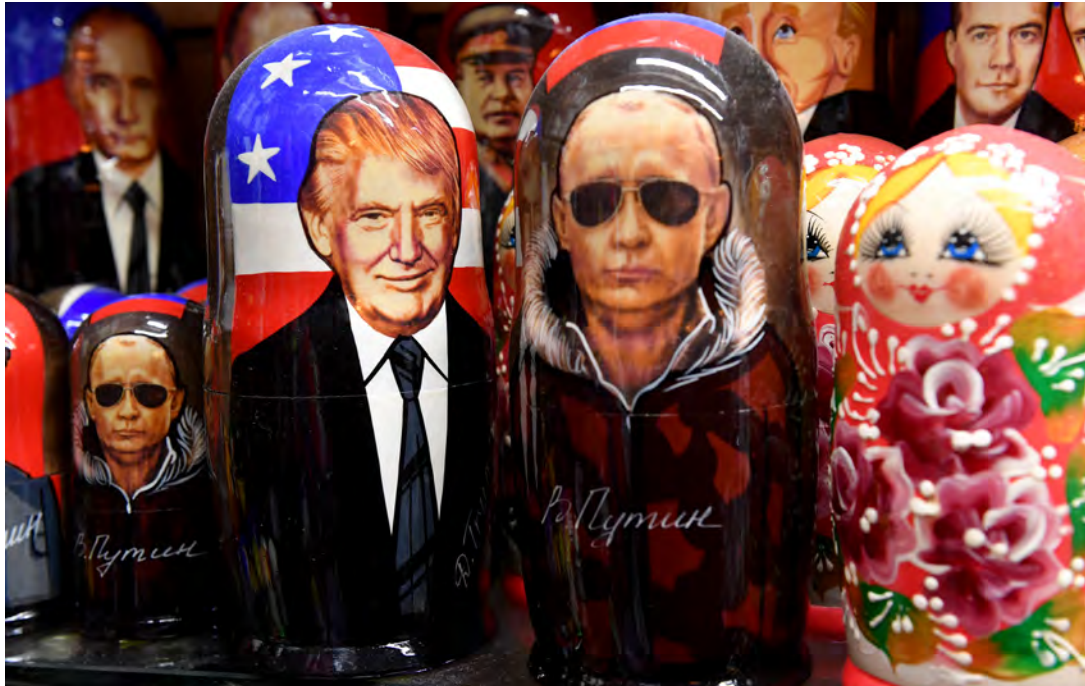
Traditional Russian wooden nesting dolls, Matryoshka dolls, depicting Russia's President Vladimir Putin and US President Donald Trump are displayed for sale in Saint Petersburg

"Both sides showed interest" in a meeting, Putin told reporters