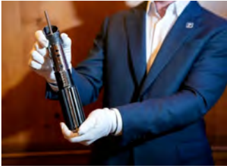
A man holds Darth Vader's lightsaber Los Angeles next month.

Reflecting that passion, it is predicted to fetch up to $3 million when it goes on sale in