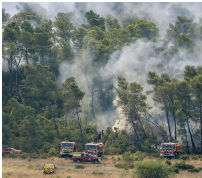
Firefighter vehicles in a burning forest area during a wildfire in Saint-Laurent-de-la-Cabrerisse, southern France. The largest wildfire of the summer in France ravaged 16,000 hectares of vegetation and pine forest, "more than the city of Paris," according to a French colonel. It also destroyed or damaged 25 homes and burned 35 vehicles, according to the provisional report from the prefecture.