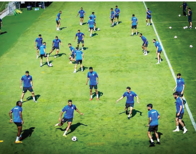
Bahrain's national team in training