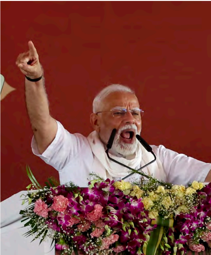
India’s Prime Minister Narendra Modi gestures as he addresses a public gathering (file photo)

Additionally, New Delhi fears that allowing the import of dairy products may upset the cultural and religious sensitivities of India’s majority Hindus, who revere cows as sacred.