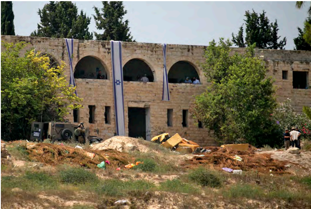
Israeli settlers return to the settlement of Sa Nur, which lies between the cities of Nablus and Janin in the occupied West Bank, on July 24, 2018 as they mark 13 years since their evacuation as part of the 2005 disengagement plan

On a visit to the area yesterday along with families who say they are preparing to move there,