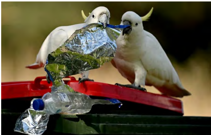
Cockatoos looking for food in a garbage bin near restaurants in the New South Wales coastal city of Wollongong

Charles Sturt University researcher Natasha Lubke docu-