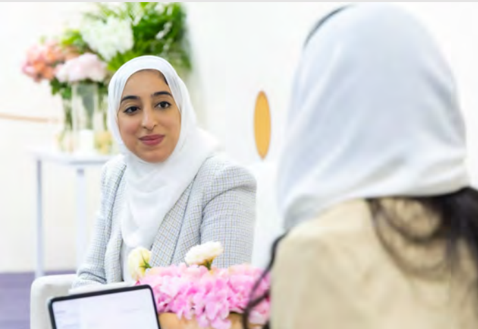
H.E. Fatima bint Jaafar Al Sairafi with distinguished guests, organisers and other attendees

During a tour of the specialized programs featured in the current edition, Her Excellency the Minister observed several programs that directly support the strategic objectives of Bahrain's tourism sector and strengthen the Kingdom's status regionally and internation-