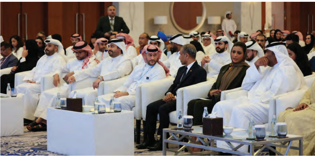
The LMRA Chief Executive Officer with distinguished guests