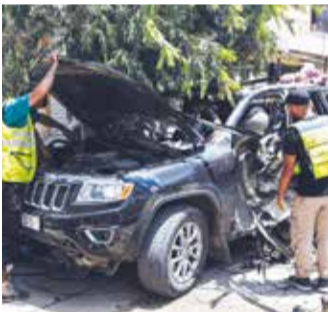
First responders inspect the wreckage of a car reportedly targeted by an Israeli strike in Nabatieh

This round of talks will be the sixth since spring between the two neighbours, which do not have diplomatic relations and are technically in a state of war.