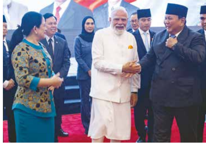
India's Prime Minister Narendra Modi (C) shakes hands with Indonesia's President Prabowo Subianto during his visit at the parliament building in Jakarta

disclosed, and an Indonesian defence ministry spokesman did not respond to a request for