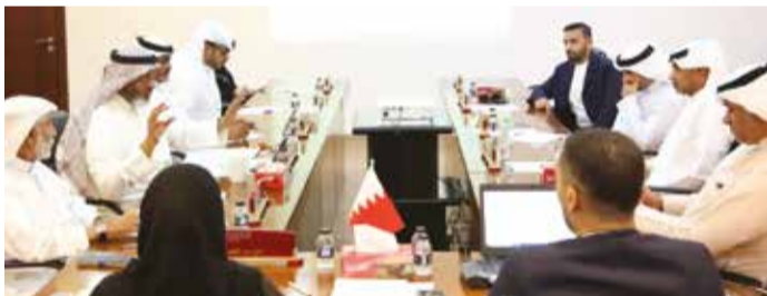
Councilors discuss the proposal in the last meeting

“The Maqasees market is not merely a place for selling used goods—it is a popular heritage landmark reflecting Bahrain's so-