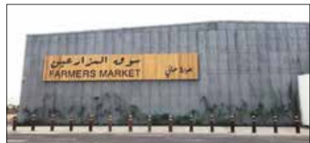
The market is planned for Hoorat A'ali, near the Farmers' Market

market operate during evening hours Sunday to Thursday, with morning and evening sessions on weekends.