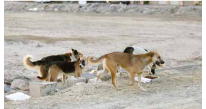
Stray dogs pictured inside a Bahrain graveyard following complaints from nearby residents.