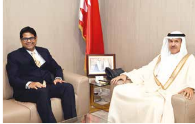
TDT | Manama

Senior official honours outgoing envoy as bilateral ties continue to flourish