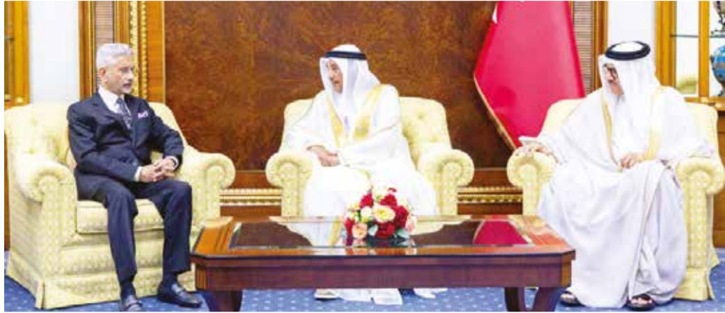
TDT | Manama

Deputy Prime Minister welcomes India's support