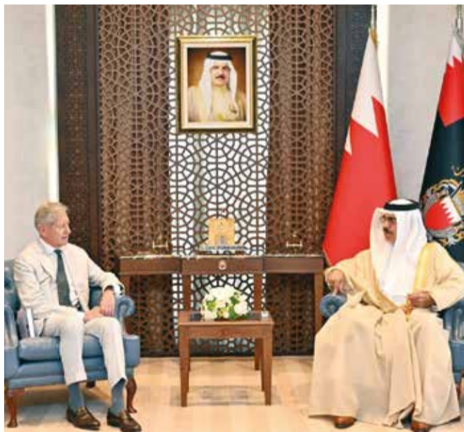
TDT | Manama