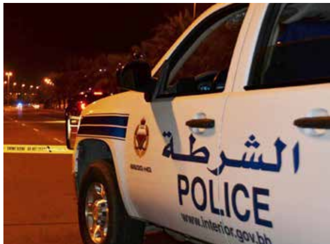
Representational image