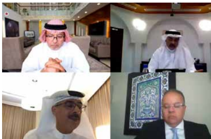
A screenshot from the symposium in session

The Minister of Justice, Islamic Affairs and Endowments, and National Committee for International Humanitarian Law (NCIHL) chairman, Shaikh Khalid bin Ali Al Khalifa, was speaking at a global symposium, titled "International Humanitarian Law in the Era of COVID-19", organised by the Judicial and Legal Studies Institution