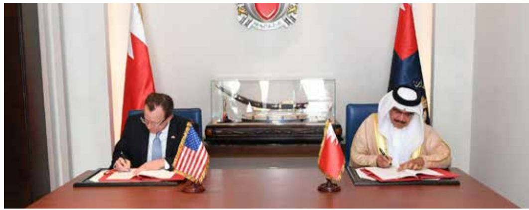
The Interior Minister and the US Ambassador signing the agreement letter

thanks and appreciation to the Interior Minister, hailing the cooperation and coordination of the Interior Ministry to promote bilateral relations between the two countries.