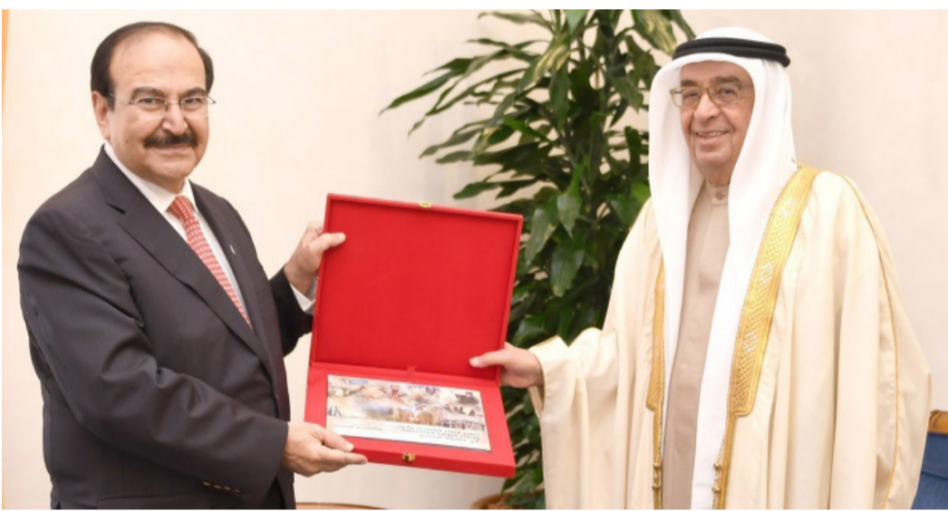
The Deputy Prime Minister, HH Shaikh Mohammed bin Mubarak Al Khalifa, received yesterday the Sustainable Energy Authority (SEA) president, Dr Abdulhussain bin Ali Mirza, who presented him with a copy of his book entitled "Development in the Electricity and Sustainable Energy Sectors in the Kingdom of Bahrain". Above, the Deputy PM accepting the SEA president's book.