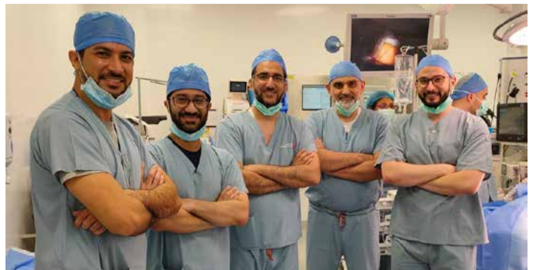
The surgical team at King Hamad University Hospital managed to eradicate a tumour in the lower oesophagus of a 50-year-old patient yesterday. The advanced and complex operation, was the first of its kind in the hospital's history. Using the latest advanced technology, the surgery took four hours under total anaesthesia to successfully remove the malignant tumour. The patient will soon begin the second stage of the treatment through radiotherapy at the Bahrain Cancer Centre. Above, the skilled medical team that performed the surgery.