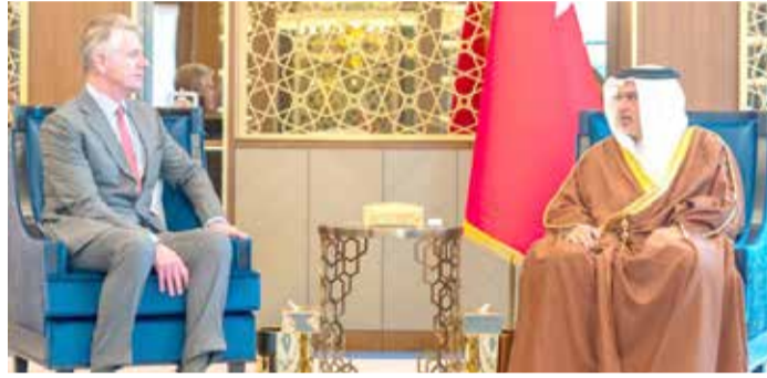
HRH the Crown Prince and Prime Minister with Lieutenant General (Retd) Sir Thomas Beckett

HRH Prince Salman commended the Kingdom of Bahrain's long and fruitful cooperation with the IISS, and the ongoing efforts to organise the