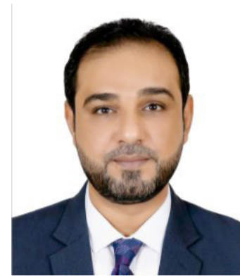
MP Mohsin Al Asbool