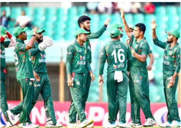
Bangladesh players celebrate during the match