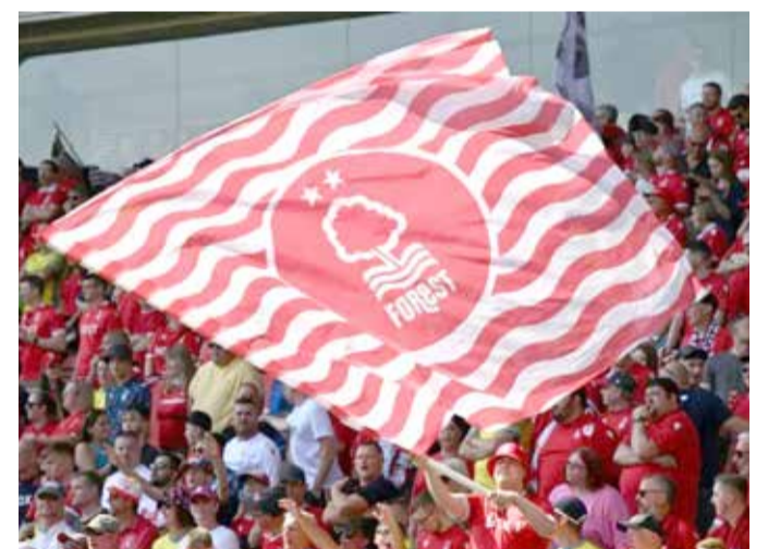
A Forest flag is waved ahead of a match (file photo)