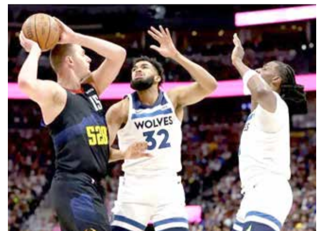
Denver's Nikola Jokic is smothered by Minnesota's defence