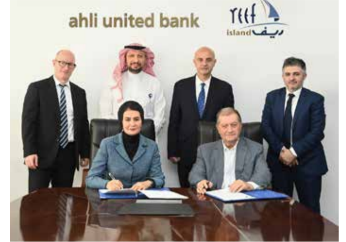
The deal signing