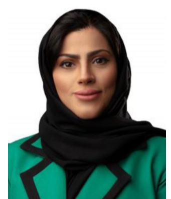
MP Basma Mubarak

each day's stay at hotels will merely serve to overburden tourists and citizens."