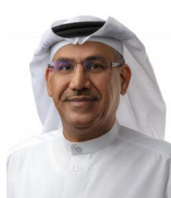
MP Ahmed Qarata