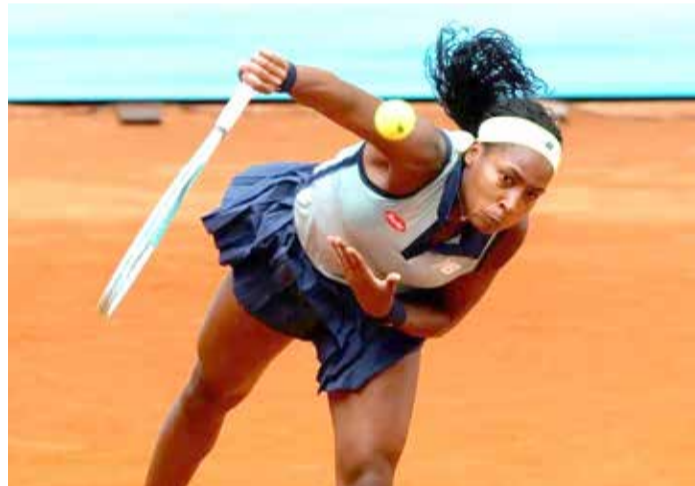
Coco Gauff in action

She added: "For me it's just serving better than I did last week. Honestly, I feel the other