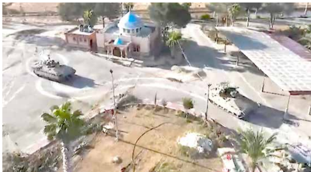
This image grab shows the Israel's 401st Brigade's combat team tanks entering the Palestinian side of the Rafah border crossing between Gaza and Egypt in the southern Gaza Strip.

"The crossings that have been closed need to be reopened, it is unacceptable for them to be closed," Press Secretary Karine Jean-Pierre told a briefing, adding that another crossing, at