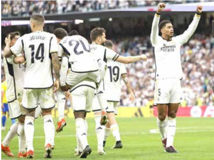
Real Madrid's Jude Bellingham celebrates scoring his team's second goal during a match (file photo)

"I am confident because this is Real Madrid, we have this squad,