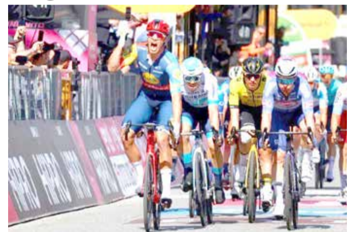
Jonathan Milan celebrates his narrow win in the Giro d'Italia fourth stage