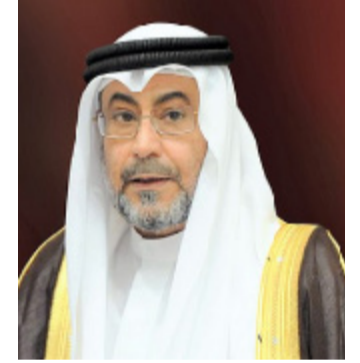
H.E. Ghanim Al Buainain

ly unrelated to the exercise of freedom of expression and freedom of speech.