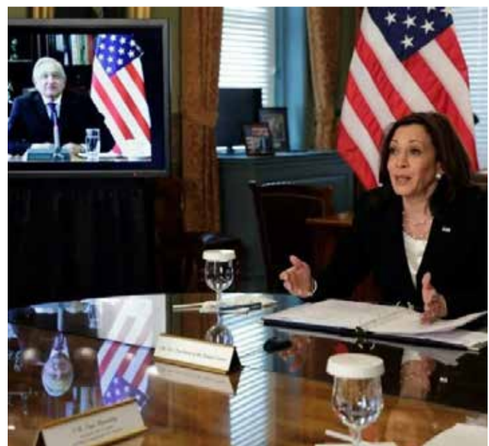
US Vice President Kamala Harris during a video call with Mexican President Andres Manuel Lopez Obrador

US Vice President Kamala Harris and Mexico's President Andres Manuel Lopez Obrador pledged Friday to cooperate on resolving the roots of the long-running and politically sensitive issue of illegal migration into the United States. Harris, speaking with Lopez Obrador in a virtual meeting, said they should work together on helping El Salvador, Guatemala and Honduras improve conditions and persuade many migrants to stay home. "It is in our countries' mutual interest to provide immediate relief to the Northern Triangle and to address the root causes of migration," Harris said. "Most people don't want to leave home and when they do it is often because they are fleeing some harm or they are forced to leave because there are no opportunity" Harris said that it was in the "mutual interest" of the United States and Mexico to address the "root causes" of mass emigration from the three Northern Triangle nations. "Our approach is to work with international institutions, to work with nations worldwide, the private sector and community organizations... and build a sense of hope for the people of the Northern Triangle," she said. Lopez Obrador referred