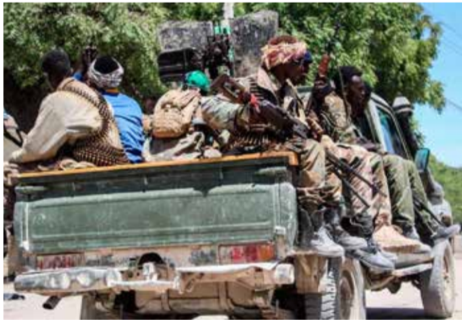
Somali military force supporting anti-government opposition leaders are stationed on a street in Mogadishu