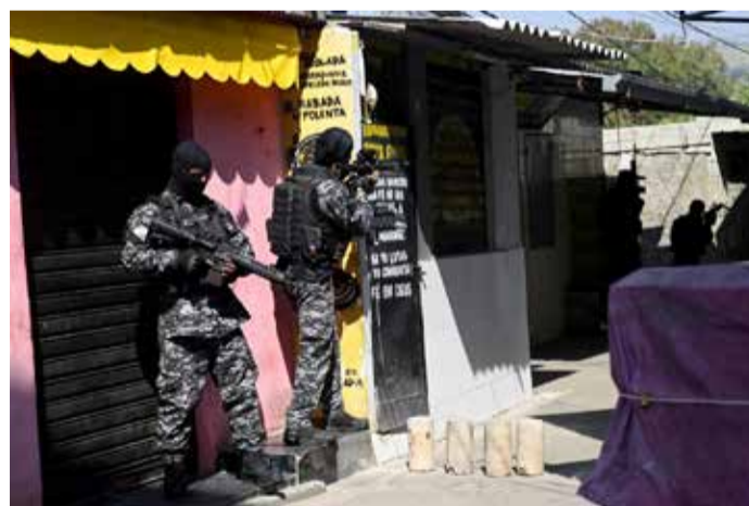
Rio de Janeiro police led an operation against drug traffickers