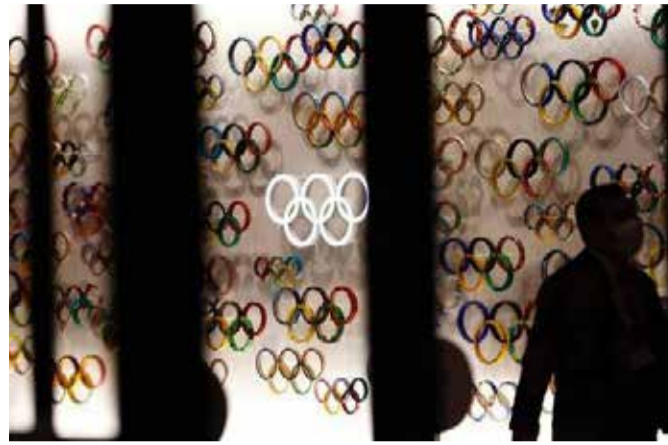
A man wearing a face mask walks past Olympic Rings at the Japan Olympic Museum in Tokyo