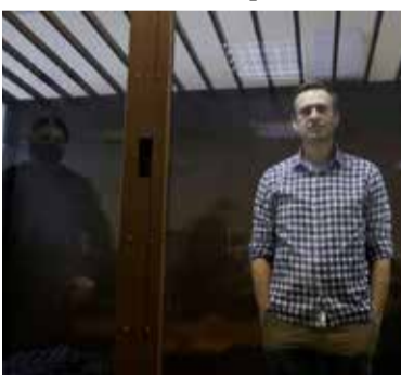
Russian opposition leader Alexei Navalny attends a hearing