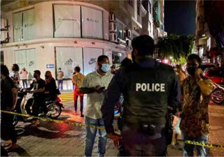
Police secure a site after a suspected bomb blast injured former Maldives president and current parliament speaker Mohamed Nasheed in Male

Maldives ex-president Mohamed Nasheed in intensive care after 'life-saving surgery' on chest, abdomen and limbs