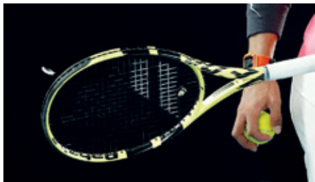
Spain's Rafael Nadal hits a feather with his racket during a match (file photo)

However, the tournament will now take place on the Tennis World Tour videogame and run from April 27-30, "with the world's biggest tennis stars squaring off from their