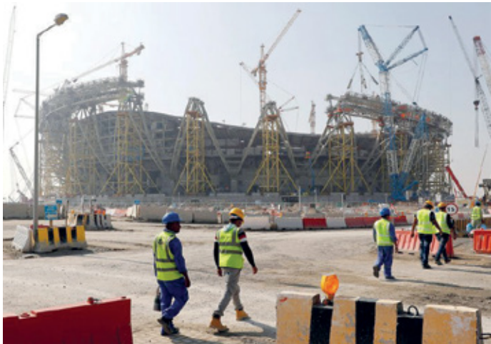
A general view shows the Education city stadium built for the upcoming 2022 FIFA World Cup in Doha

Warner has been accused of a number of crimes in the long-running U.S. probe, and