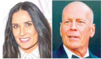
Demi Moore and Bruce Willis

Moore and Willis wore matching green striped pyjamas while