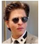
Shah Rukh Khan

Popular US talk show hosts Jimmy Fallon, Jimmy Kimmel and Stephen Colbert will host the event, which broadcasts live across the US television networks ABC, CBS and NBC, as well as being streamed online on April 18.