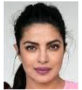
Priyanka Chopra Jonas

arity response fund and in celebration of health workers around the world.