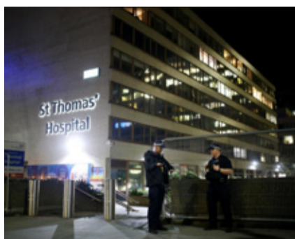
A general view of police officers outside the St Thomas' Hospital after Johnson was moved to intensive care