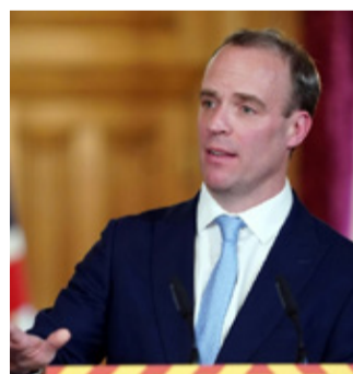
Foreign Secretary Dominic Raab is Johnson's de facto deputy