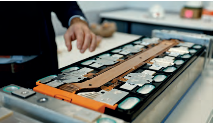
An employee shows a battery at the Automotive Cells Company (ACC) Gigafactory, which produces lithium-ion batteries for electric vehicles (EVs), in Douvrin, northern France

“ACC management confirmed to us this morning what we’ve long feared: that ACC’s plan to