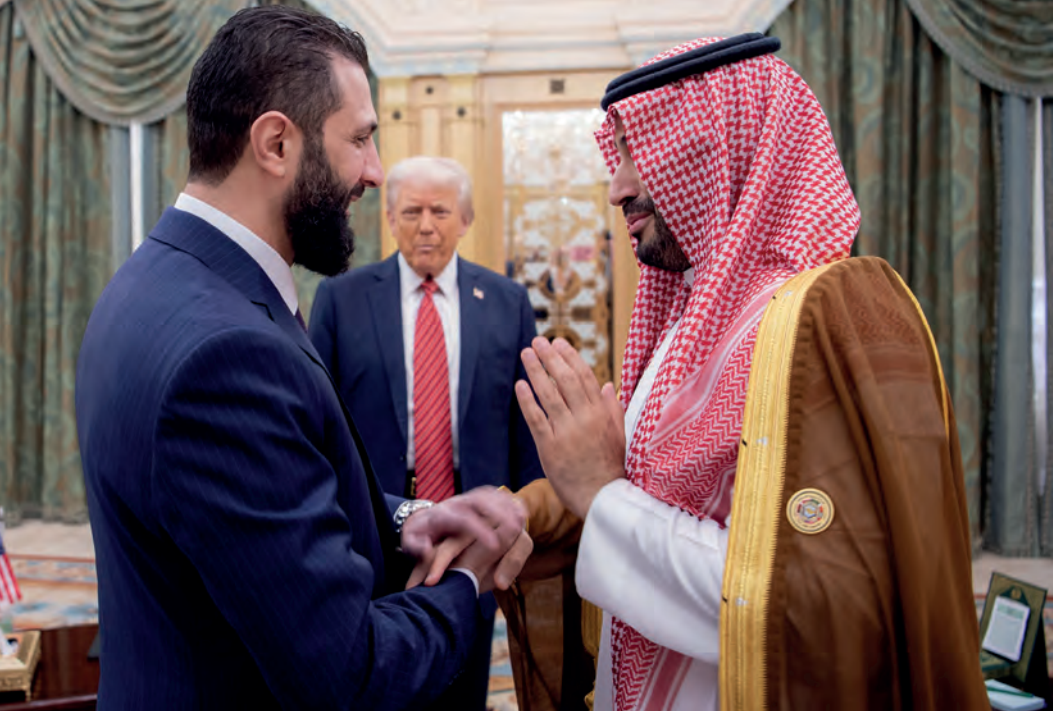
Saudi Crown Prince Mohammed bin Salman (R) greeting Syria's interim president Ahmed al-Sharaa as US President Donald Trump looks on