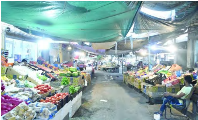
Jidhafs Central Market

The Undersecretary said the market needs a full upgrade to meet today's needs, and that