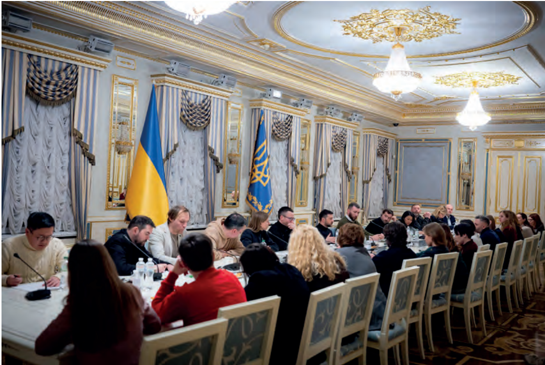
Ukraine's President Volodymyr Zelensky (C-L) chairs a meeting with journalists at his office in Kyiv

The United States wants Ukraine and Russia to end their nearly four-year war by June, and has offered to host talks between the two sides in Florida next week, Ukrainian President Volodymyr Zelensky said. US-led efforts to end Europe's deadliest conflict since World War II have stepped up a gear in recent weeks, but Moscow and Kyiv remain at odds over the key issue of territory. Russia, which occupies around 20 percent of its neighbour, is pushing for full control of Ukraine's eastern Donetsk region as part of any deal and has threatened to take it by force if talks fail. But Ukraine says ceding ground will embolden Moscow and so it will not sign an agreement that fails to deter Russia