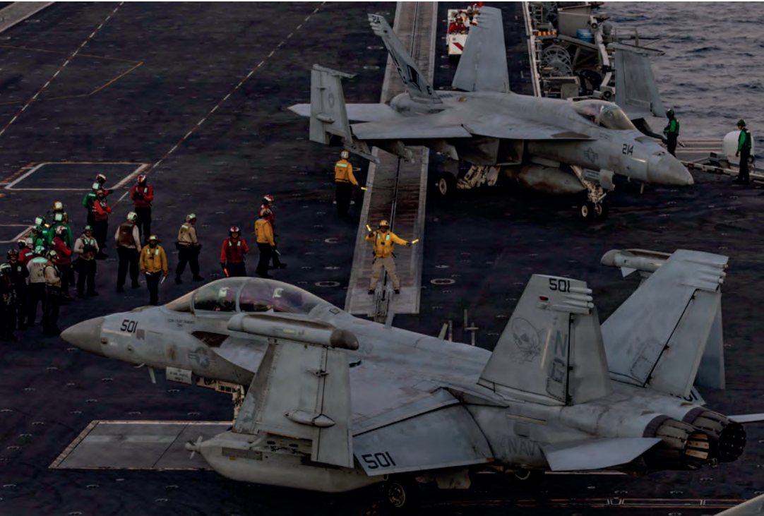
US sailors direct an EA-18G Growler, attached to Electronic Attack Squadron (VAQ) 133, on the flight deck of Nimitz-class aircraft carrier USS Abraham Lincoln in the Arabian Sea

He also said Iran's missile programme was "never negotiable" because it relates to a "defence issue". Washington has sought to address Iran's ballistic missile programme and its support for militant groups in the region -- issues which Israel has pushed to include in the talks, according to media reports. Tehran has repeatedly rejected expanding the scope of the negotiations beyond the nuclear issue. Friday's unprecedented talks between the two arch enemies came amid a major US military buildup in the region in the wake of Iran's crackdown on protests that began in late December, driven by economic grievances.