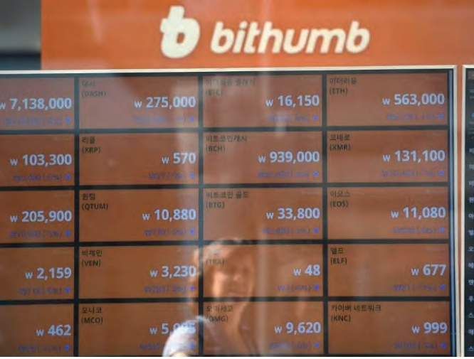
A woman is reflected on a screen showing exchange rates of cryptocurrencies at Bithumb virtual currency exchange in Seoul