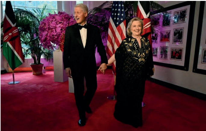
Bill Clinton, 42nd US President and his wife Hillary Rodham Clinton, 67th US Secretary of State, arrive at the Booksellers Room of the White House (file photo)

Former US president Bill Clinton and his wife Hillary are calling for their congressional testimony on ties to convicted sex trafficker Jeffrey Epstein to be held publicly, to prevent Republicans from politicizing the issue. Both Clintons had been ordered to give closed-door depositions before the House Oversight Committee, which is probing the deceased financier's connections to powerful figures and how information about his crimes was handled. Democrats say the probe is being weaponized to attack political opponents of President Donald Trump -- himself a longtime Epstein associate who has not been called to testify -- rather than to conduct legitimate oversight. House Republicans had previously threatened a contempt vote if the Democratic power couple did not show up to testify, which they have since agreed to do. But holding the deposition behind closed doors, Bill Clinton said Friday, would be akin to being tried at a “kangaroo court.” “Let's stop the games & do