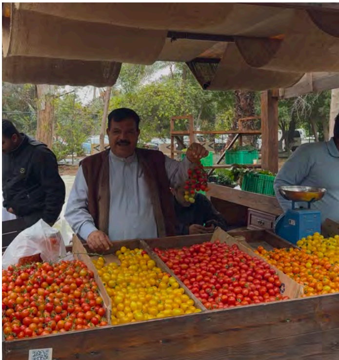
Bahraini farmer's fresh produce

Conversations between vendors and visitors continued