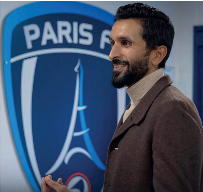
His Highness Shaikh Nasser bin Hamad Al Khalifa