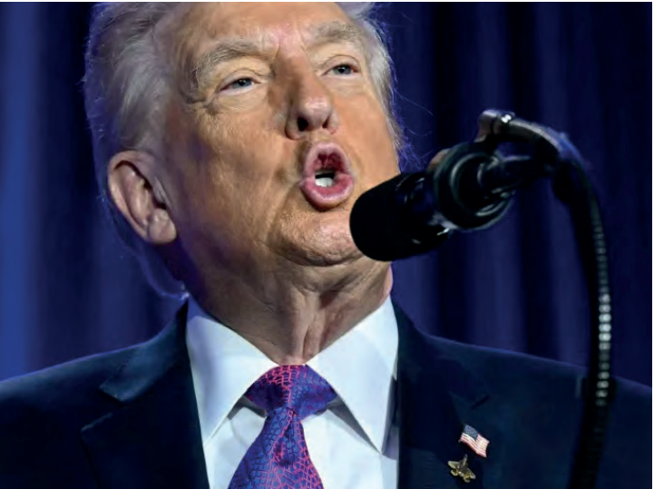
US President Donald Trump speaks during an event

President Donald Trump refused to apologize Friday for a video posted on his social media account depicting Barack and Michelle Obama as monkeys, though he said he condemned the post as the White House shifted the blame to staff. The video shared on Trump's Truth Social account late Thursday night sparked censure across the US political spectrum, with the White House initially rejecting "fake outrage" only to then blame the post on an error by a staff member. "I didn't make a mistake," Trump said on Air Force One late Friday when asked if he would apologize for the post. Asked if he condemns the racist imagery in the video, Trump replied: "Of course I do."