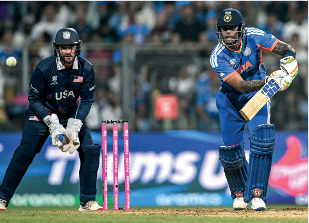
India's captain Suryakumar Yadav (R) plays a shot