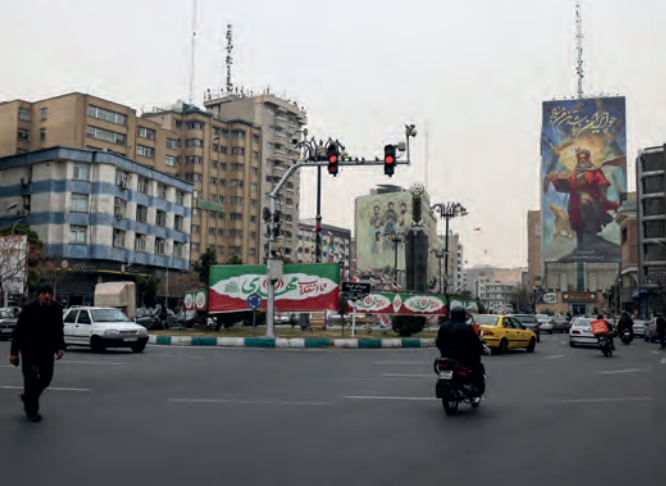
Traffic moves through a street in Tehran