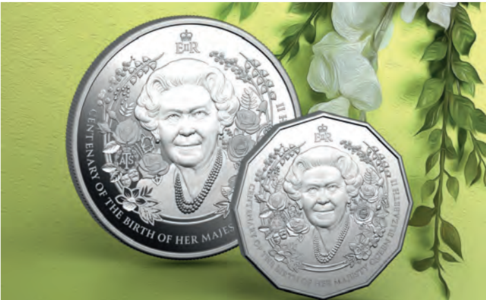
The newly launched coins with the image of the late Queen Elizabeth II