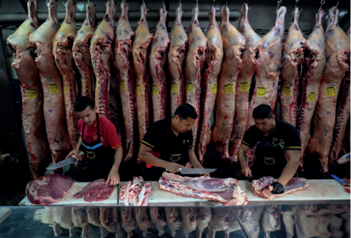
Workers cut beef at the H&H meat-packing plant in Buenos Aires

This applies to lean beef trimmings, which are blended with fattier ones to make ground beef products like hamburgers, the document added.