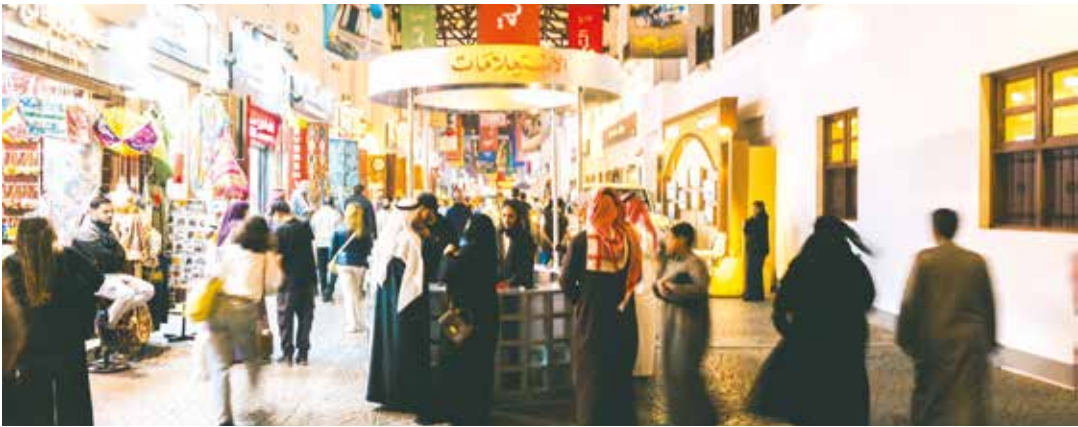
Visitors experience Manama's diverse cultural and tourism activities

This has allowed for a wider variety of experiences and activi-