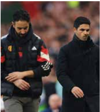
Ruben Amorim (L) and Mikel Arteta react after a match (file photo)

The Spaniard, appointed in 2019, endured a rocky start to his time in charge of Arsenal, but they now head into Thursday's match at home to reigning champions Liverpool six points clear at the top of the Premier League table as they chase a first English title