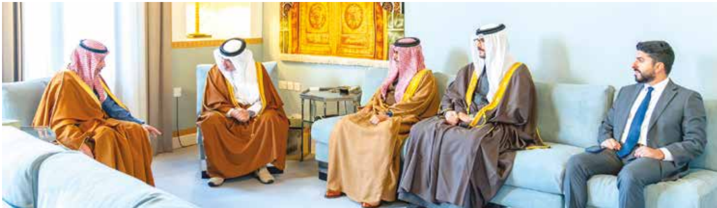
HRH the Crown Prince and Prime Minister with H.E. Saudi Ambassador Naif bin Bandar Al-Sudairi

HRH the Crown Prince and Prime Minister affirmed that the historic relationship between Bahrain and Saudi Arabia continues to advance across various fields in line with the support of both His Majesty King Ham-