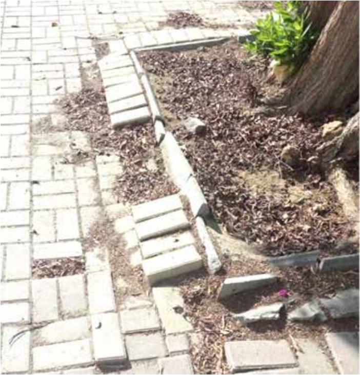
Damas trees are blamed for roads and sewage damage

The study said this pattern can damage infrastructure, with roots able to break into