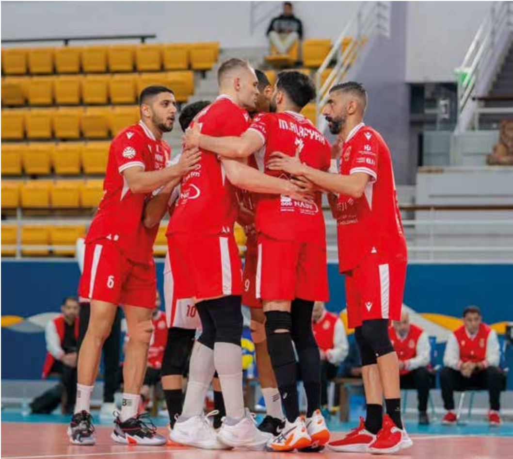
Muharraq's players huddle during their unbeaten league run