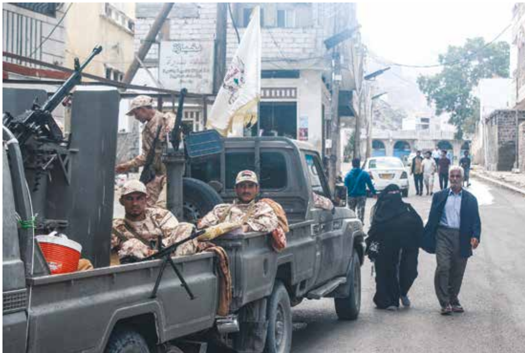
Members of the Southern Giants Brigade aka Al-Amaliqa sit in the back of military vehicles deployed in Aden

But he failed to board the flight carrying his delegation, and the coalition struck his home province of al-Dhale after