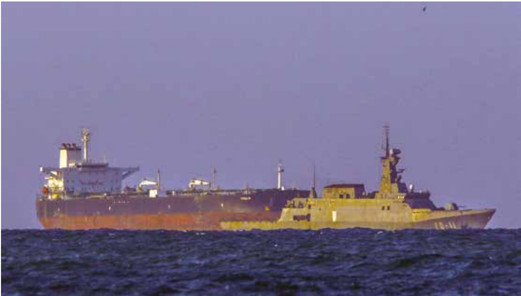
A Venezuelan navy patrol boat escorts Panamanian flagged crude oil tanker Yosefin near the El Palito refinery in Puerto Cabello, Venezuela

The United States on Wednesday seized a Russian-flagged oil tanker in the North Atlantic after pursuing it from off the coast of Venezuela, in an operation condemned by Moscow. Washington says the tanker is part of a so-called shadow fleet that carries oil for countries such as Venezuela, Russia and Iran in violation of US sanctions, and seized it despite the ship being escorted by the Russian navy. The vessel had thwarted an