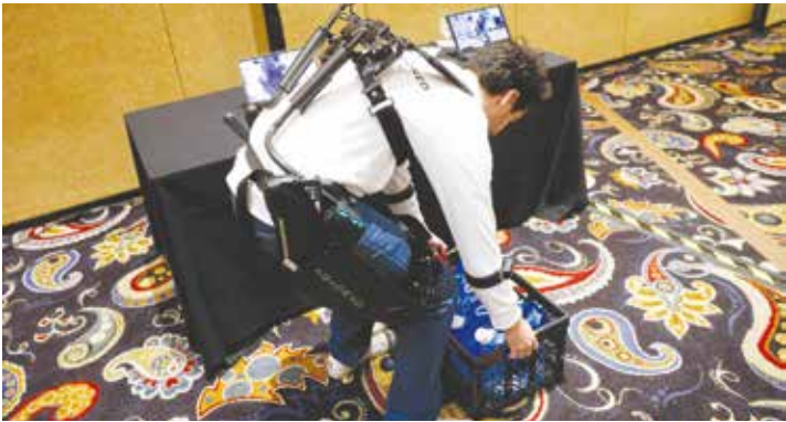
An exhibitor displays AGADE's Agadexo Lowback, its next-generation AI-driven industrial exoskeleton, during the Showstoppers event at the annual Consumer Electronics Show in Las Vegas, Nevada Lenovo hopes will showcase the breadth of its product portfolio. Unlike rivals focused on single categories, Lenovo was the only major manufacturer whose offering spanned laptops, tablets and smartphones -- under its Motorola brand, acquired in 2014 -- as well as servers and even supercomputers.

Lenovo, the world's top PC maker, unveiled its own AI assistant Tuesday at the CES tech show in Las Vegas, promising a tool that follows users seamlessly across laptops, smartphones and connected devices. The Beijing-based company commanded 28 percent of global PC market share in the third quarter of 2025, ahead of rivals HP at 21.5 percent and Dell at 14.5 percent, according to US research firm Gartner. Lenovo's new artificial intelligence agent, dubbed Qira, is designed as an autonomous interface capable of performing tasks rather than simply generating content on demand, a move