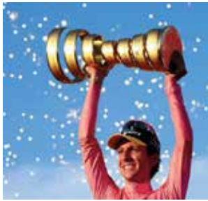
Simon Yates

Two-time Grand Tour winner Simon Yates announced yesterday that he was retiring from professional cycling, just seven months after winning the Giro d'Italia.