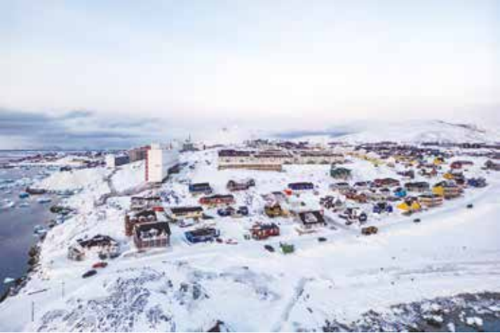
This aerial view shows snow-covered buildings in Nuuk, Greenland

Denmark has warned any move to take Greenland by force would mean “everything would