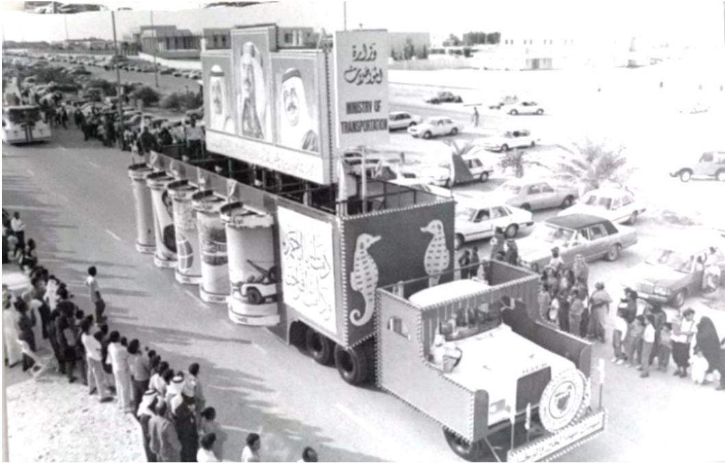
Enriching heritage with modern vision of Bahraini identity

The Ministry called for designs that blend originality with national pride and reflect one or more themes such as tech-