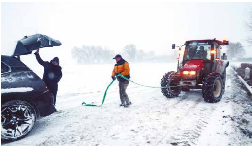
A local town hall employee attempts to tow a stranded vehicle on a snow-covered road near Sebourg, northern France

Guinean teenager Boubacar Camara, who is sleeping in a tent on the city's outskirts, told AFP he had "no choice but to keep