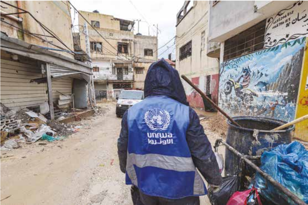
A man collects trash while wearing a jacket bearing the logo of the United Nations Relief and Works Agency for Palestine Refugees in the Near East (UNRWA), along a street in the city of Jenin in the occupied West Bank

The UN’s beleaguered agency for Palestinian refugees said yesterday that a “dire” financial crisis had this week forced it to fire hundreds of Gazan staff who had left the territory. “On Tuesday, 571 local UNRWA staff, outside Gaza, were informed that they were being separated from the agency with immediate effect,” a spokesperson told AFP in an email. For more than seven decades, the United Nations Relief and Works Agency for Palestine Refugees has provided aid and assistance to Palestinian refu-