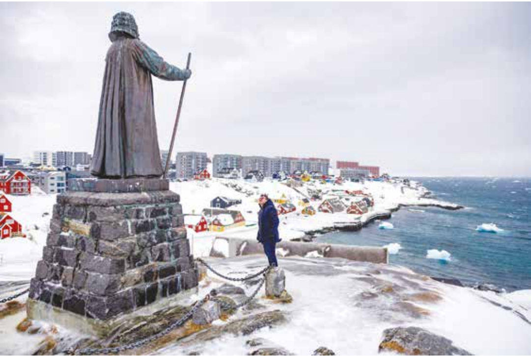
A tourist looks at the statue of Hans Egede (1686-1758), a Dano-Norwegian Lutheran missionary, in Nuuk, Greenland

as a global peacemaker, also touched on a personal grievance.