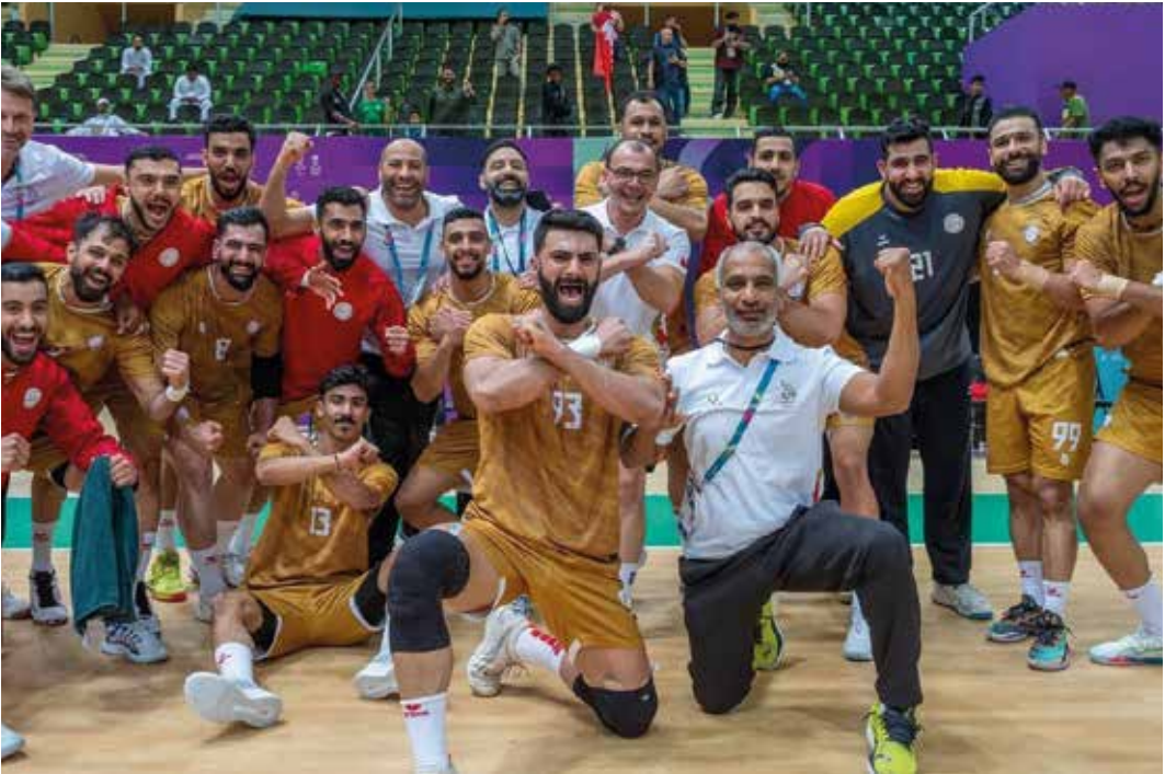
Passionate Bahrain celebrations at 2025 Islamic Solidarity Games

Bahrain will open their campaign tonight against North Macedonia at 10:30 PM. They then meet hosts Switzerland