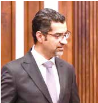
H.E. Wael Al Mubarak

The prosecution's case centres on CCTV footage and witness statements.