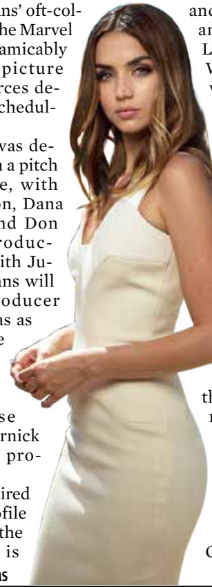
Ana De Armas

described as a high concept romantic action-adventure film. The change comes because the intent is to get the picture into production by February, and the timing didn't work out for Johansson. Ellison led the charge to bring in de Armas, who's about as hot an actor out there right now after 'Knives Out' and 'No Time to Die', and with the Adrian Lyne-directed 'Deep Water' upcoming with Ben Affleck. She most recently starred with Evans and Ryan Gosling in the Joe and Anthony Russo-directed 'The Gray Man' for Netflix. She has also been in talks to play the lead in the John Wick spinoff 'Ballerina'.