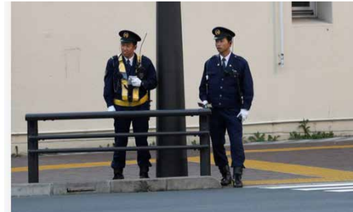
Police officers stand guard near the US embassy in Tokyo

"The US Embassy has received reports of foreigners stopped and searched by Japanese police in suspected racial profiling incidents. Several were detained, questioned, and searched," the tweet said.