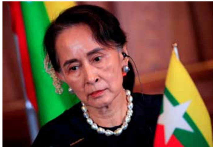
Myanmar's Aung San Suu Kyi

"The conviction of the State Counsellor following a sham trial in secretive proceedings before a military-controlled