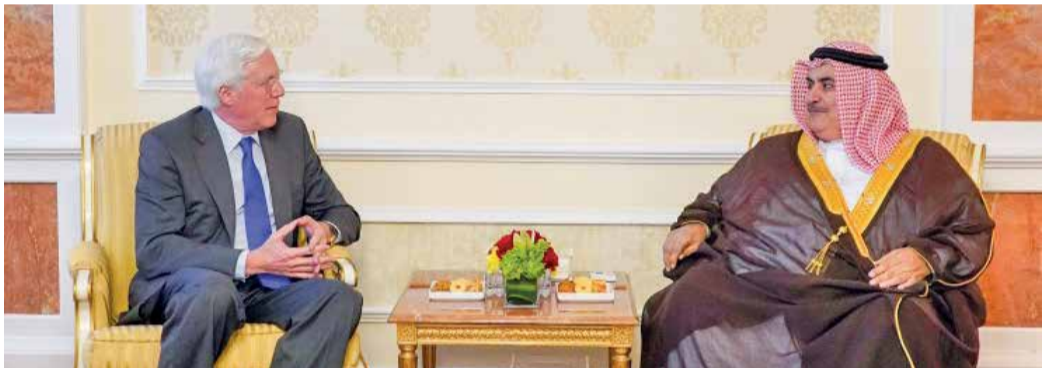
Foreign Affairs Minister Shaikh Khalid bin Ahmed bin Mohammed Al Khalifa holding talks with American Jewish Committee (AJC) delegation headed by John Shapiro. The minister welcomed the AJC members and stressed the keenness of the Kingdom of Bahrain to bolster cooperation with the US in various fields, for the common interest of the two countries. Regional and international issues of common concern were also discussed during the meeting.