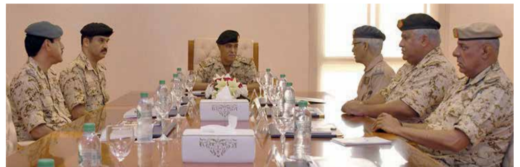
Chief of Staff of Bahrain Defence Force (BDF) Lieutenant General Dhiab bin Saqr Al Nuaimi chaired yesterday the meeting of Isa Royal Military College council which convened in the college building. Discussions focused on issues pertaining to the college development programmes as part of BDF modernisation policy.