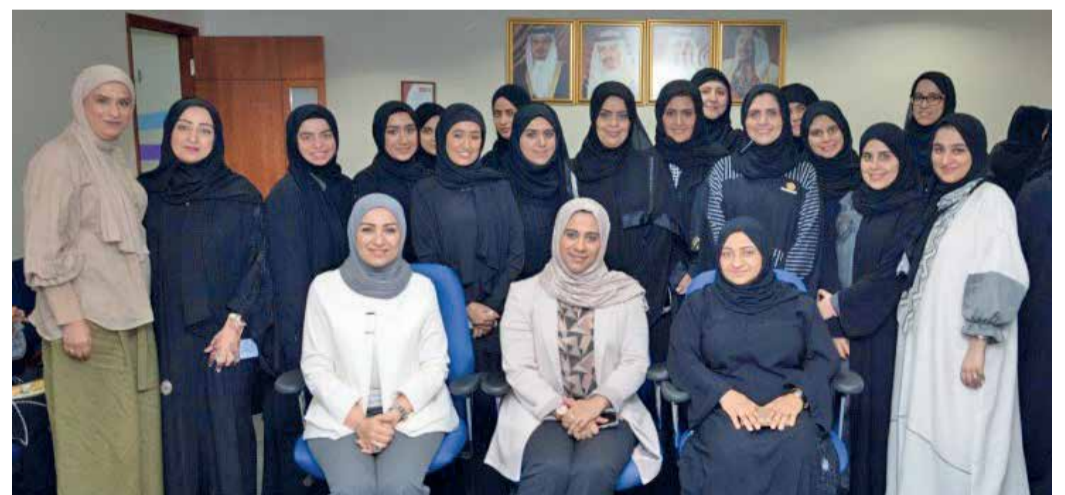
The Civil Service Bureau (CSB) employees during Bahraini Women's Day celebration themed "Bahraini women in the legislative and municipal fields". The celebration took place at the CSB premises in coordination with the Supreme Council of Women (SCW). Izzudin Khalil Al-Moayyed, Director of Media and Administrative Affairs at the SCW, held an awareness lecture which shed light at the role of SCW in following up the implementation of its terms of reference, and women's participation in parliamentary elections.