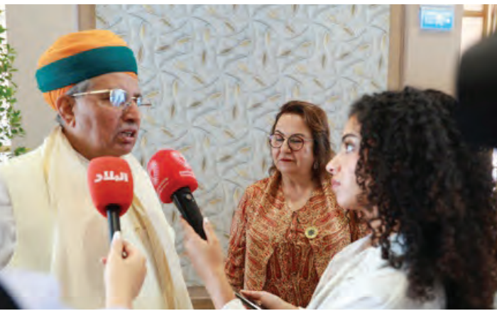
H.E. Arjun Ram Meghwal speaks to the press

India's Minister of Law and Justice Arjun Ram Meghwal praised Bahrain's establishment of the International Commercial Court (BICC) as a landmark step toward promoting neutral justice and sustainable economic development. In remarks to the press during the King Hamad Forum for Justice in Manama, Meghwal welcomed the establishment of the court, highlighting the importance of mutual respect law, dignity and communities among nations. "The principles of neutral justice contribute to strengthening good governance and feasible coexistence," he said. "When we resolve disputes through arbitration and mediation, our economies can grow. That is