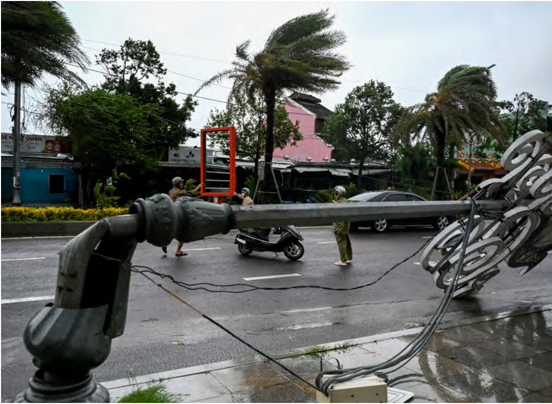
Residents make their way past a lamp post that collapsed in strong winds ahead of the arrival of Typhoon Kalmaegi near Quy Nhon beach in Gia Lai province in central Vietnam

Vietnam is in one of the most active tropical cyclone regions on Earth and is typically affected by 10 typhoons or storms a year,