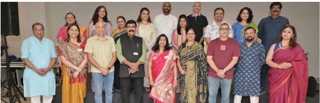
Indian Fine Arts Society officials and members

Indian Fine Arts Society (IFAS), one of Bahrain's oldest cultural associations, will mark a new milestone today with the semi-final and final of its 'Superstar Singer 2025' contest at Epix Cinema in Dana Mall.