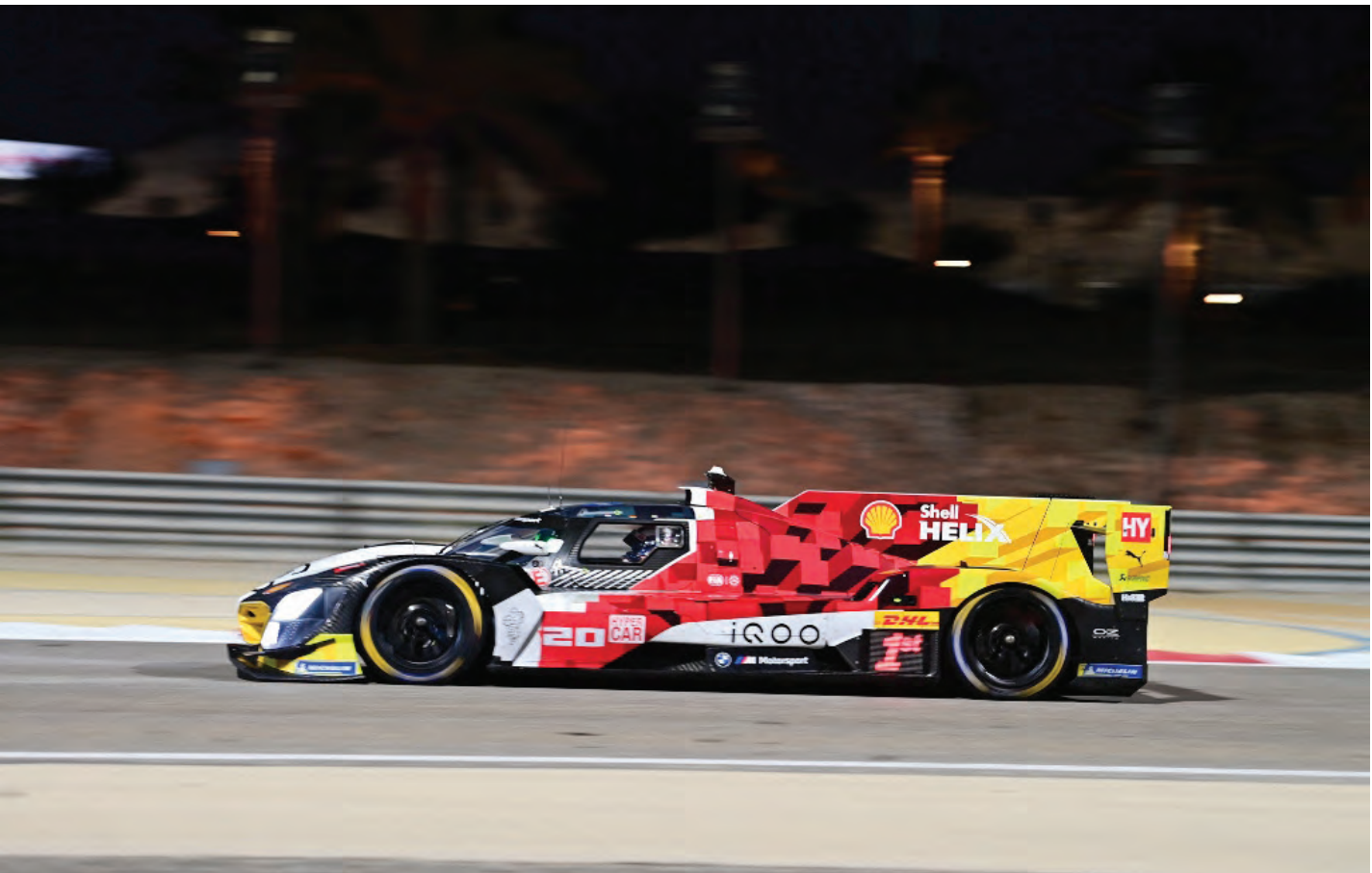
The leader in the hypercar category