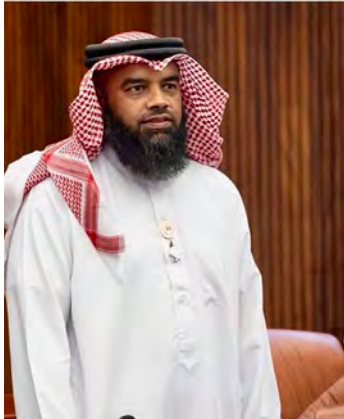
MP Bader Al Tamimi

The submission argues that bringing the hospital under the Ministry of Health would nar-