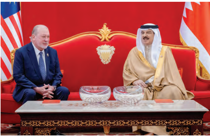
His Majesty King Hamad welcomes HM King Sultan Ibrahim of Malaysia

HM King Hamad and HM King Sultan Ibrahim emphasised