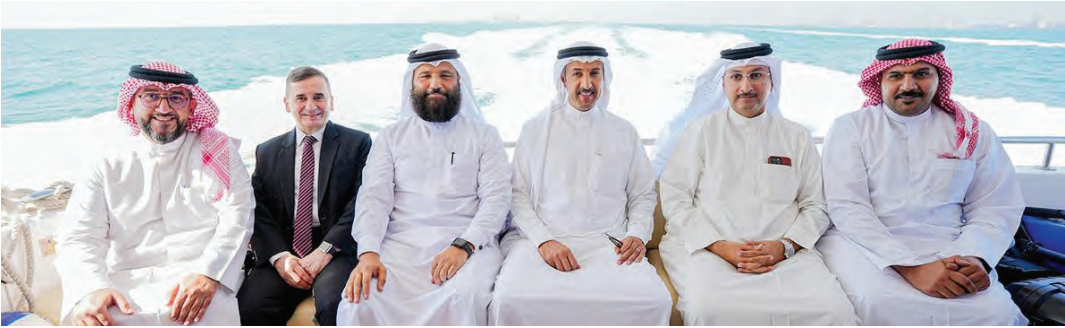
H.E. Dr. Shaikh Abdullah bin Ahmed Al Khalifa with Bahrain and Qatar senior officials at the passenger ferry line's inauguration

His Excellency Dr. Shaikh Abdullah bin Ahmed Al Khalifa, Minister of Transportation and