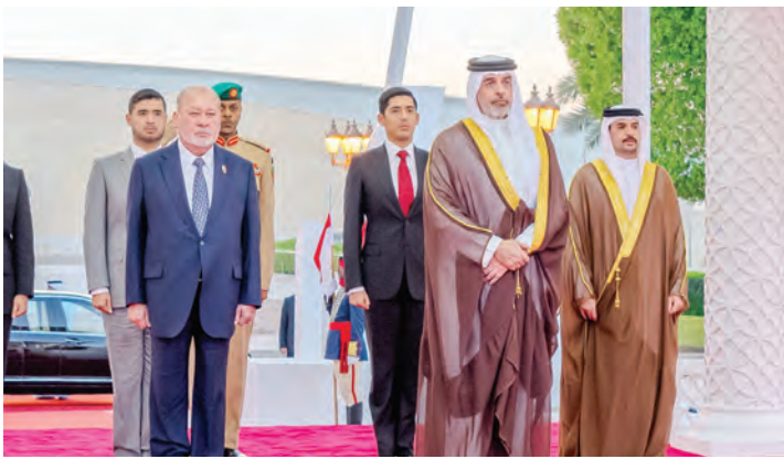
HM King Sultan Ibrahim, accompanied by His Highness Shaikh Abdullah bin Hamad Al Khalifa, Personal Representative of His Majesty the King and Head of the Mission of Honour, visits the Fallen Servicemen Monument

Malaysian King to the Kingdom, noting that the visit reflects the strong ties between the two nations and their shared commitment to strengthening cooperation in ways that serve mutual interests.