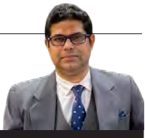
HIS EXCELLENCY VINOD K JACOB

Throughout its civilizational journey, India has been a land of songs and even today, songs continue to capture the national ethos. Songs reflect the popular trends of the times. They also entertain and inculcate values in society in equal measure.