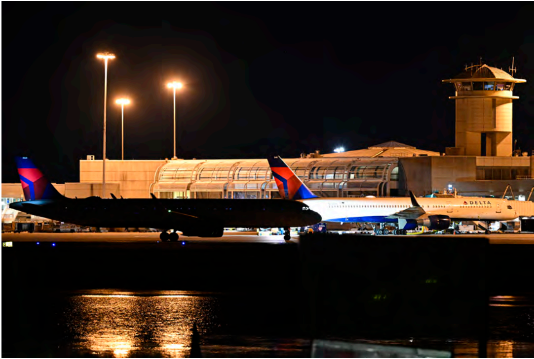
Delta Airlines planes are seen on the tarmac as flights are cancelled at Orlando International Airport in Orlando, Florida

The official list of affected airports is expected to be published later yesterday but, according to US media outlets, flights will be reduced at some of the busiest airports in the nation, including Chicago, Dallas, Los Angeles, New York, Miami and Washington.