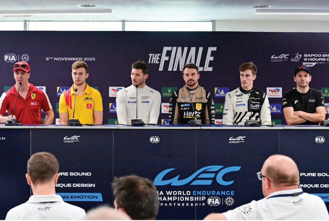
A glimpse of the press conference for the World Endurance Championship drivers