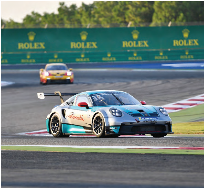
Action from second free practice session for the Porsche GT3 Cup