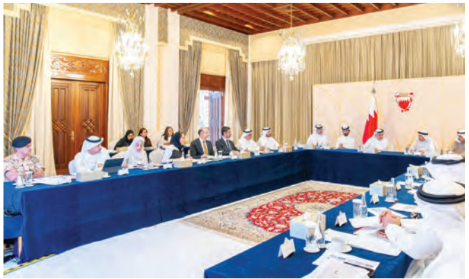
His Royal Highness Prince Salman bin Hamad Al Khalifa, the Crown Prince and Prime Minister, chairs the 32nd meeting of the Higher Urban Planning Committee. Progress on the National Plan and Development Strategy, the Muharraq City Development Project, and the Manama Souq redevelopment were reviewed.