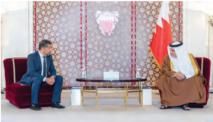
HRH Prince Salman with Eng. Ali Ahmed Alderazi and members of the NIHR Council of Commissioners

His Royal Highness Prince Salman bin Hamad Al Khalifa, the Crown Prince and Prime Minister, affirmed that the Kingdom of Bahrain continues to advance initiatives that strengthen and uphold human rights, in support of the comprehensive development led by His Majesty King Hamad bin Isa Al Khalifa. HRH Prince Salman was speaking as he met yesterday with the Chairman of the National Institution for Human