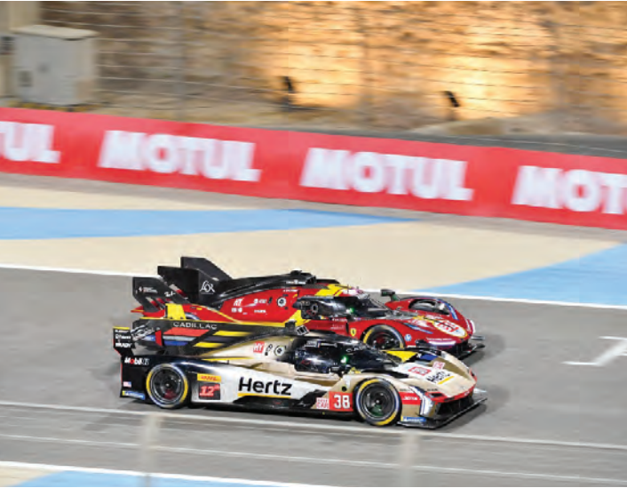
Competition during the second practice session of the World Championship