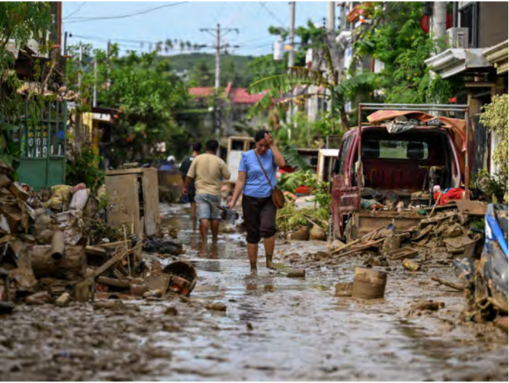
A woman walks along a mud covered street in the aftermath of Typhoon Kalmaegi in Liloan

but Kalmaegi is set to be the 13th of 2025.