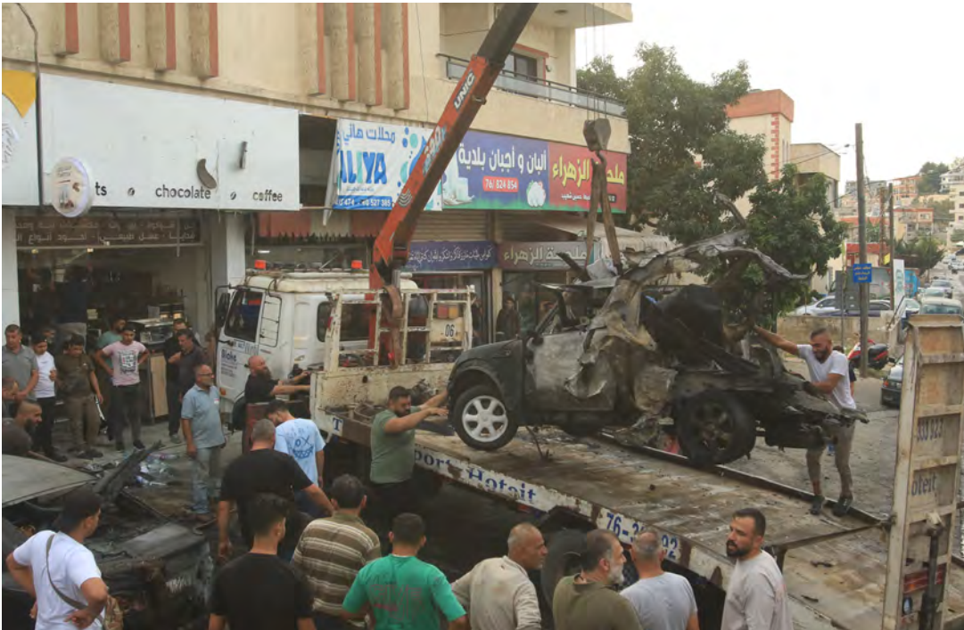
A crane removes the wreckage of car from the site of an Israeli drone strike that targeted a vehicle in the southern Lebanese village of Doueir(file photo)

lashed out at Lebanon's leadership, rejecting suggestions that it might be time to begin direct political talks with Israel.