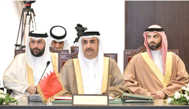
Dr. Ali bin Fadhel Al Buainain, Bahrain's Attorney General

Crypto crimes and cross-border justice dominate summit