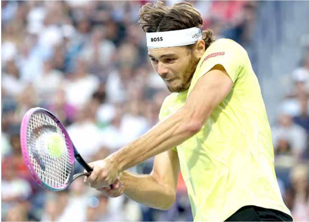
Taylor Fritz of United States returns a shot to Andrey Rublev

nated on rallies longer than nine shots. The result ended a seven-match win streak for last week’s Washington champion de Minaur. “I’m really happy with that performance. It showed mental toughness from start to finish,” Shelton said. “This win gives me a lot of confidence, I’m excited about the semi-final.