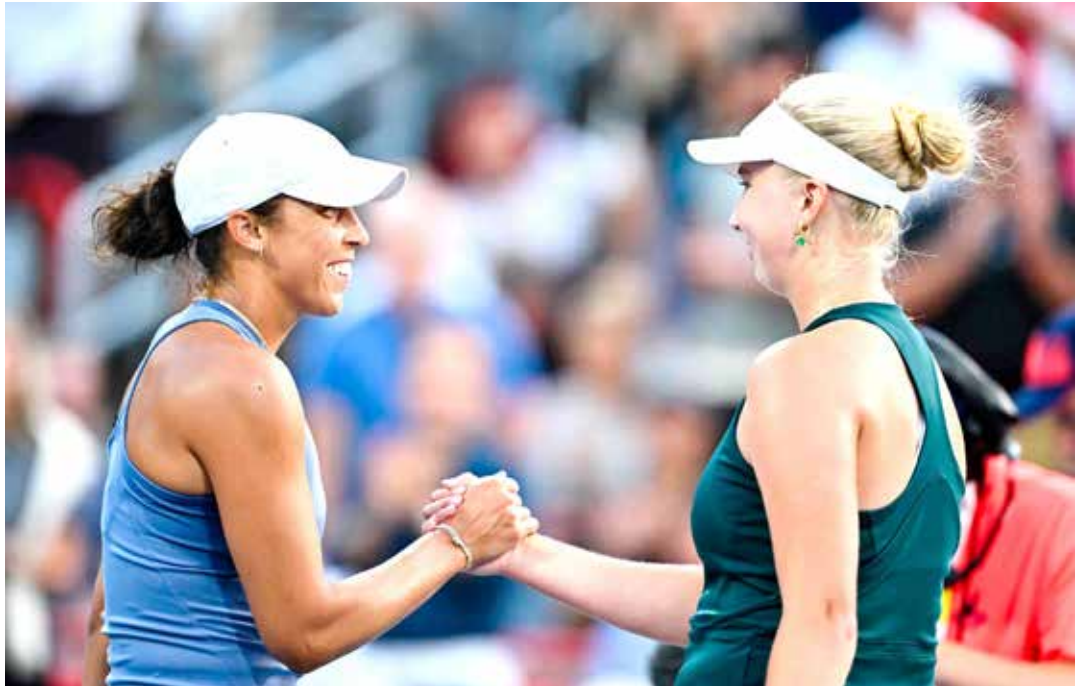
Madison Keys of the United States congratulates Clara Tauson of Denmark for her victory

Four-time Grand Slam champion Naomi Osaka advanced to the semi-finals of the WTA Canadian Open on Tuesday with a comprehensive 6-2, 6-2 triumph over 10th seed Elina Svitolina. Osaka, chasing her first WTA Tour-level title since the 2021 Australian Open, needed only 68 minutes to dispatch the Ukraine star and book a semi-final with Danish 16th seed Clara Tauson, who stunned reigning Australian Open champion Madison Keys 6-1, 6-4. “I’m just having a lot of fun playing. I’m glad to be here,” Osaka said. “I think I’ll be seeded in the US Open because I won my match. That was a really good goal for me. I’m just really excited.” Tauson dedicated her victory to her late grandfather, who died on Sunday as the Dane was dispatching Polish second seed Iga Swiatek, who won her sixth Grand Slam title last month at Wimbledon. “Two days ago, my grandfather unfortunately passed away so I really wanted to win for him